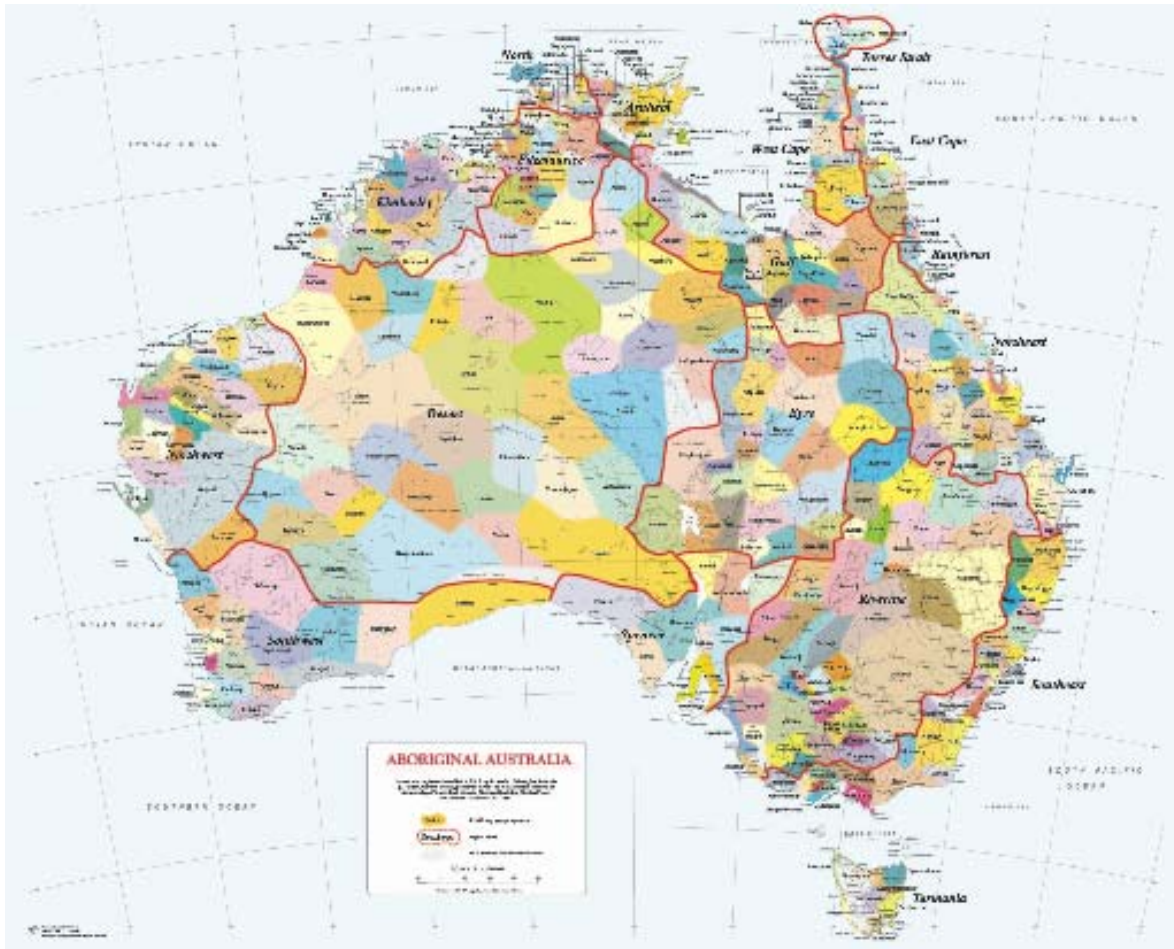
Encyclopaedia of Aboriginal Australia

This map from the Encyclopaedia of Aboriginal Australia (ed. D Horton), published in 1994 shows tribe/language areas using a fuzzy border. It does not illustrate any language classification. The colours are arbitrary and unrelated to each other. This map is appealing but of limited linguistic value. It does not correspond to precise needs. The information is based on the work of Norman Tindal, from the mid 1900s.