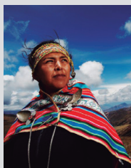
Andean cosmology of the Kallawayas , Representative List (2008).

The disappearance of a language threatens the continued practice and transmission of living heritage and may result in the loss of vital cultural and ecological knowledge.