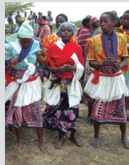
Traditions and practices associated with the Kayas in the sacred forests of the Mijikenda, Urgent Safeguarding List (2009).