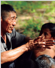
Mapoyo oral tradition and its symbolic reference points within their ancestral territory, Urgent Safeguarding List (2014).