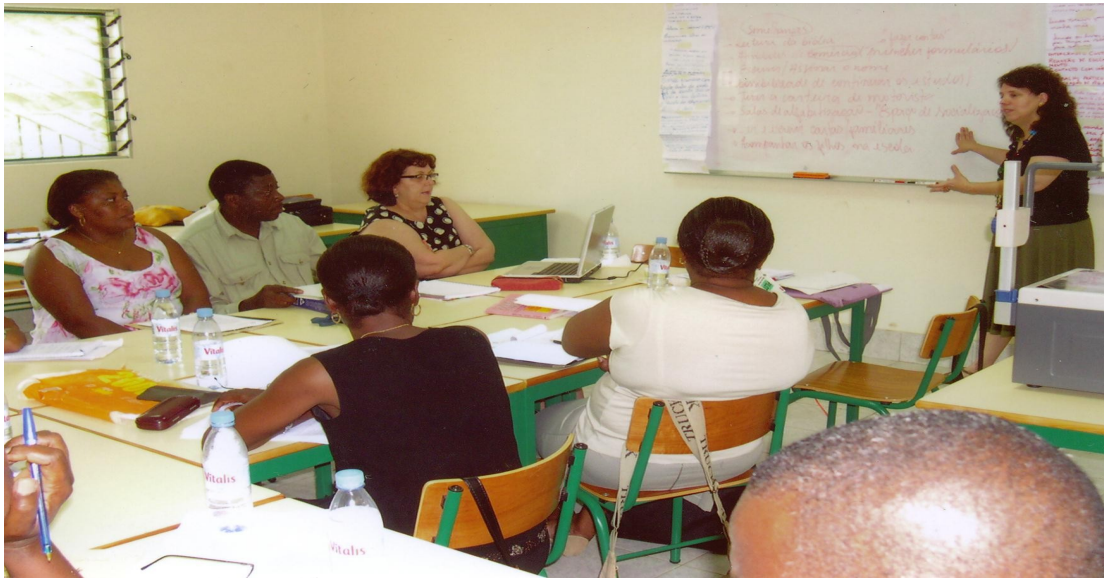
Fig. 1: Training session for literacy instructors

The literacy partnership program also provided the opportunity for a Brazilian technical team to offer technical training to literacy workers and coordinators in São Tomé and in the autonomous region of Príncipe in youth and adult education methodology.