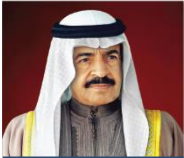
HIS ROYAL HIGHNESS PRINCE KHALIFA BIN SALMAN AL KHALIFA THE PRIME MINISTER OF THE KINGDOM OF BAHRAIN