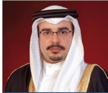
HIS ROYAL HIGHNESS PRINCE SALMAN BIN HAMAD AL KHALIFA THE CROWN PRINCE, DEPUTY SUPREME COMMANDER AND FIRST DEPUTY PRIME MINISTER