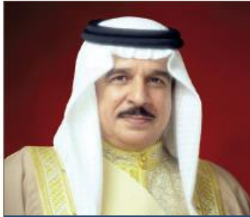
HIS MAJESTY KING HAMAD BIN ISA AL KHALIFA THE KING OF THE KINGDOM OF BAHRAIN