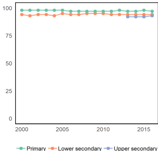
Adjusted net enrolment rate