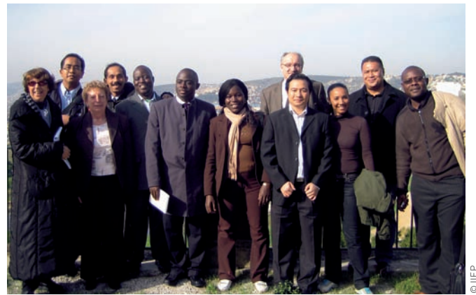
A group of ATP participants visiting a vocational upper secondary school in Marseille with the Inspector.

Provence-Alpes-Côte d'Azur was the region to welcome this year ATP's participants for the traditional study visit of the French Education System.