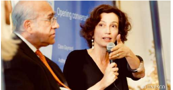
Ms Azoulay at the Women's Forum

The Women's Forum Global Meeting 2018 took place in Paris from 14 to 16 November.