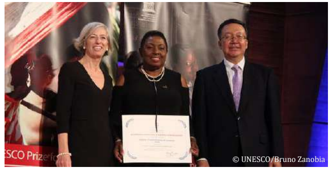
Ms Giannini; Hon. Olivia Grange, Minister of Culture, Gender, Entertainment and Sport of Jamaica, Women's Centre of Jamaica Foundation; and Mr Tian.

<u>The Women's Centre of Jamaica</u> provides continuing education for pregnant adolescent girls and mothers who had to drop out of school. The Foundation's project has become a powerful model and has replicated in countries including Grenada, Guyana, and South Africa.