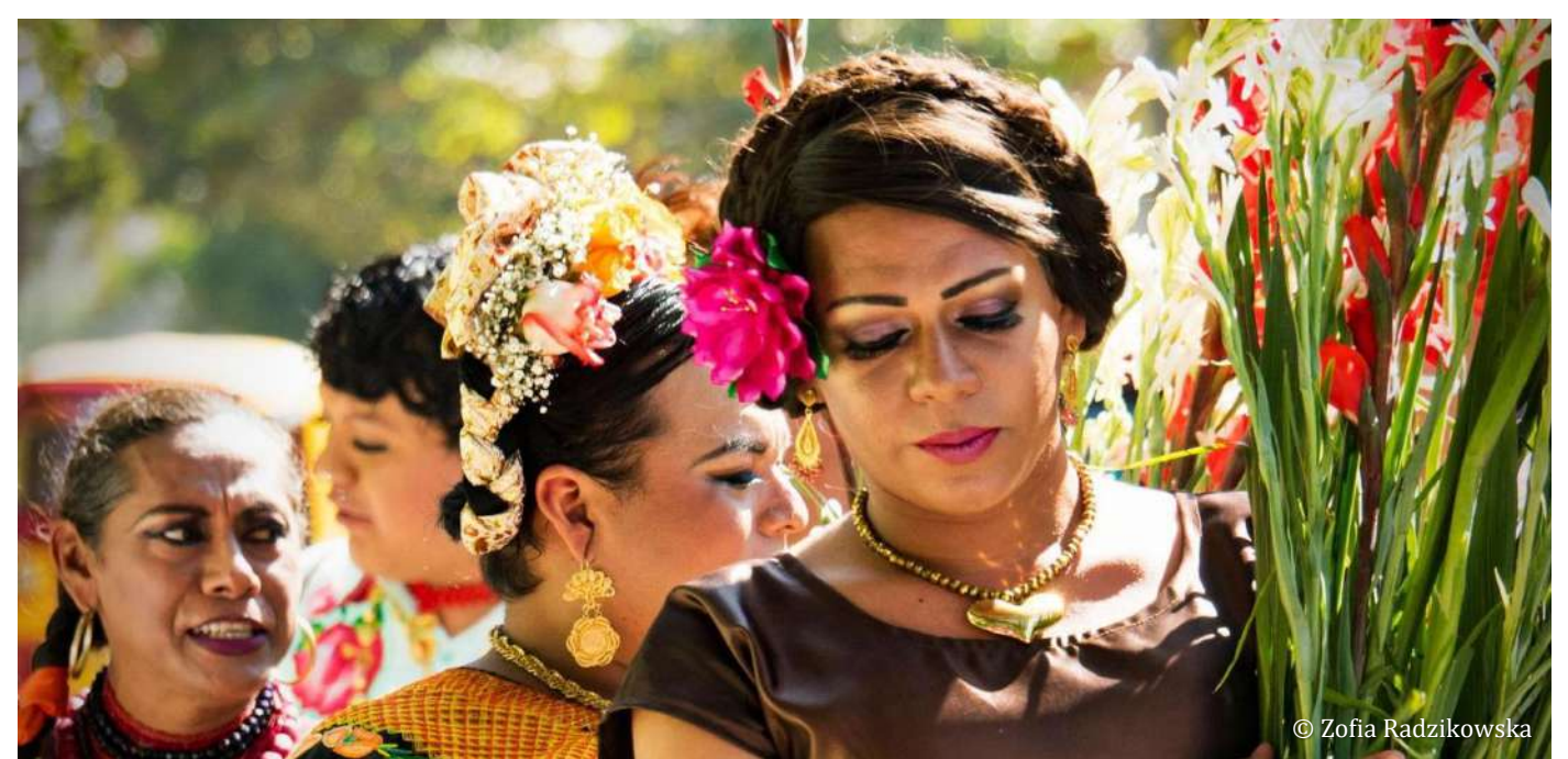
The muxes: the third gender of southern Mexico

Did you know that, in the Istmo de Tehuantepec region in Mexico's southern state of Oaxaca, there are three genders: female, male and muxes?