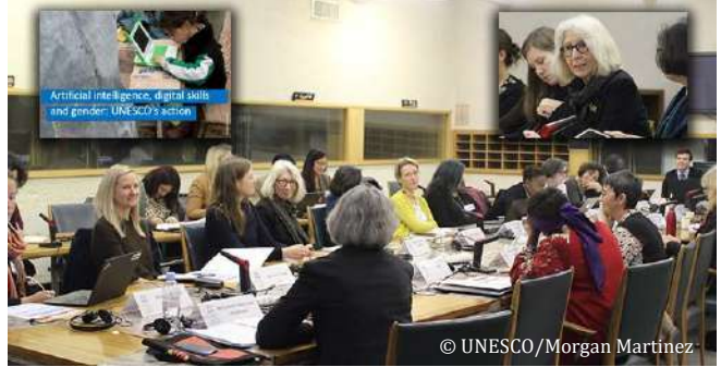
Inter-sessional Meeting of IANWGE

Inter-sessional Meeting of IANWGE Paris, France – 30 October