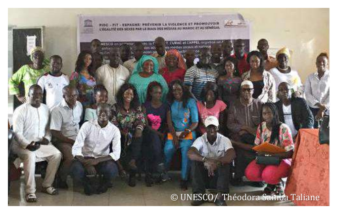
The first traveling workshop of the programme "Preventing violence and promoting gender equality through the media in Senegal" was held from 16 to 18 August 2018 in Thiès.

The traveling workshops were also held other cities, such as Kaolack (September), St. Louis (October) and Kolda (November). Promoting a culture of peace and gender equality is central to UNESCO's mission.