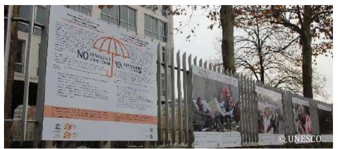
Exhibition providing facts on violence against women in the domains of competence of UNESCO.

will extend throughout the 16 Days of Activism and it may also be viewed online <u>here</u>.