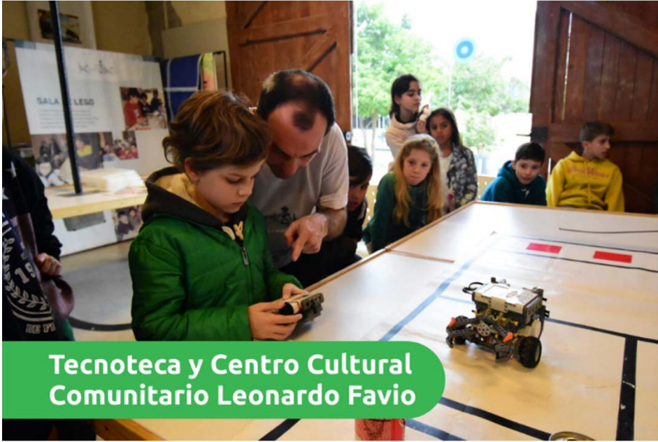
Tecnoteca y Centro Cultural Comunitario Leonardo Favio