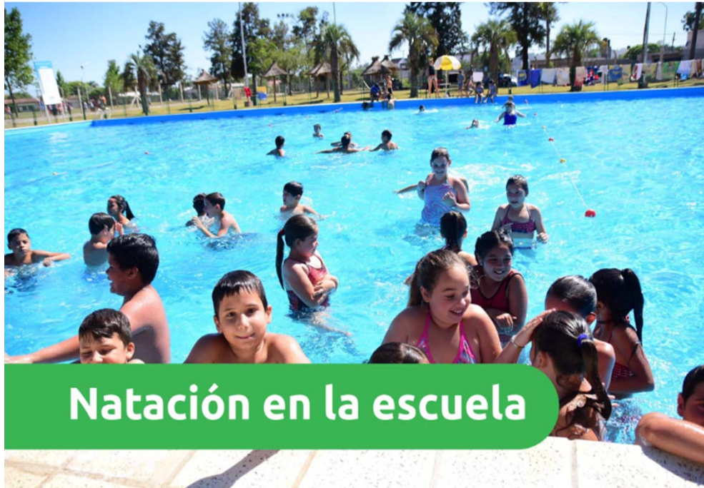
Natación en la escuela