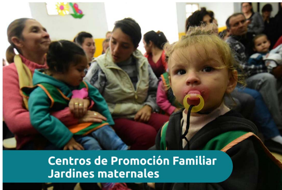
Centros de Promoción Familiar Jardines maternos