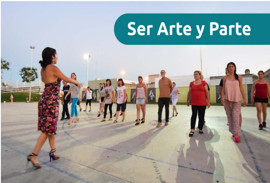
Ser Arte y Parte