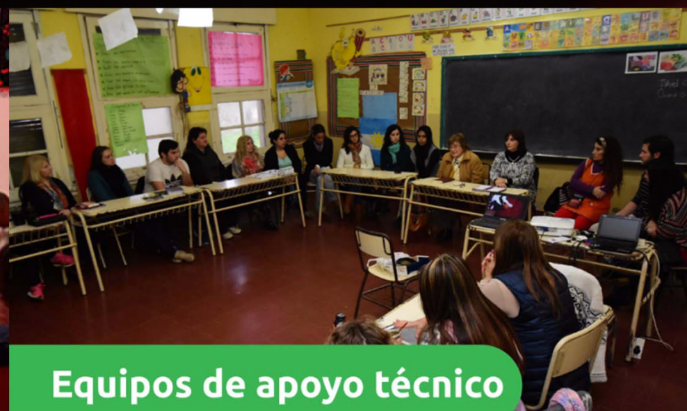
Equipos de apoyo técnico