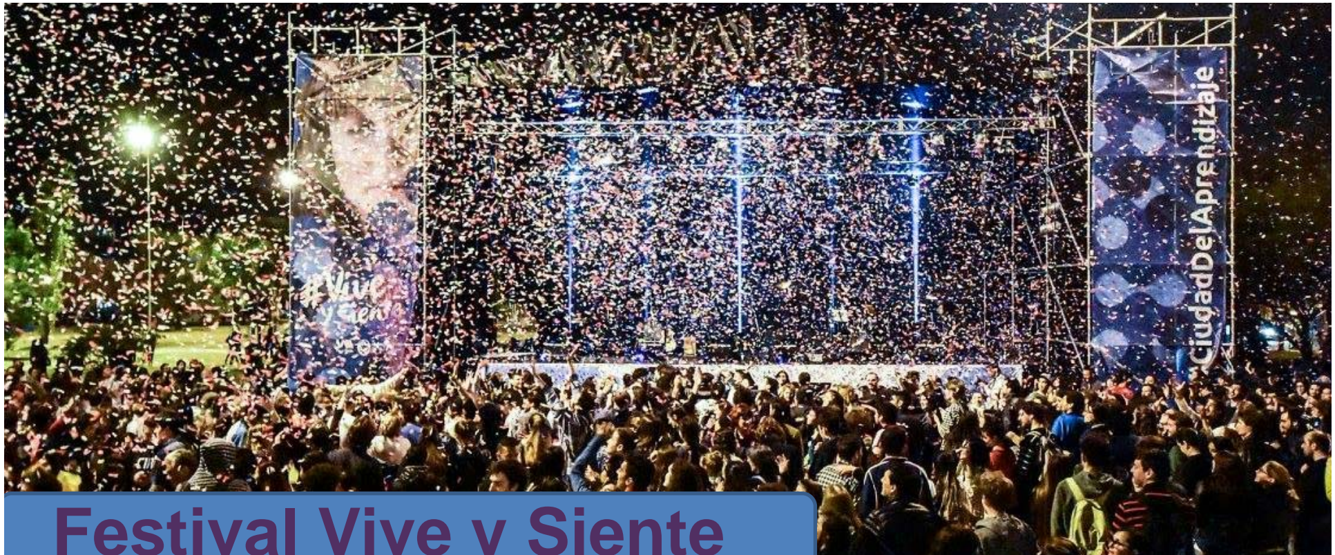
Festival Vive y Siente