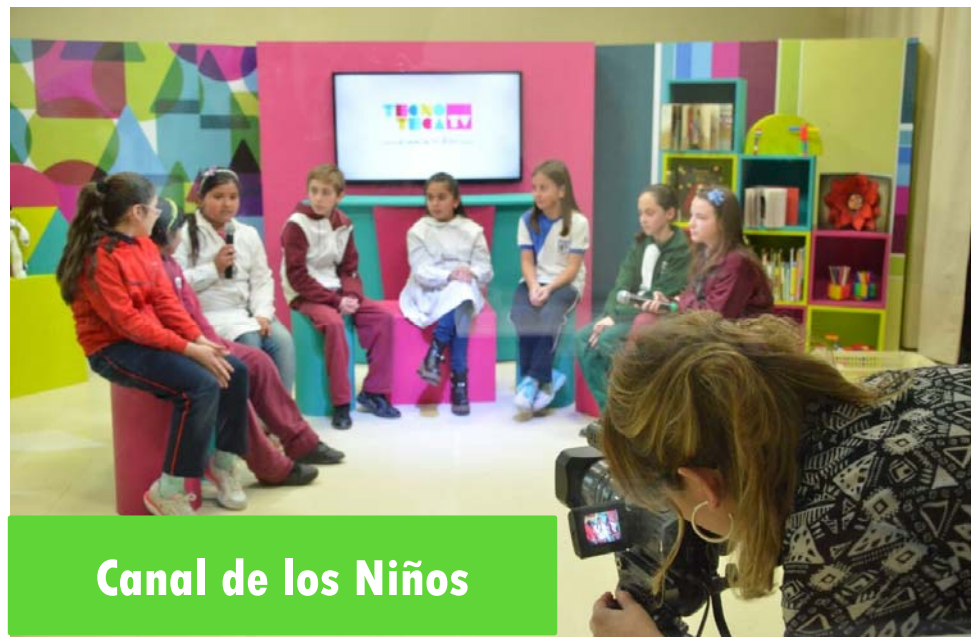
Canal de los Niños