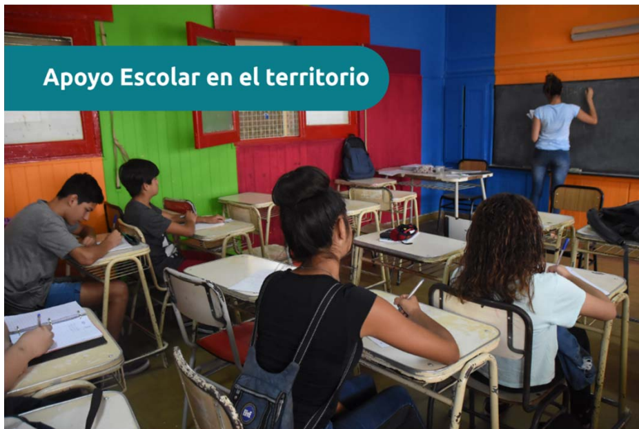
Apoyo Escolar en el territorio