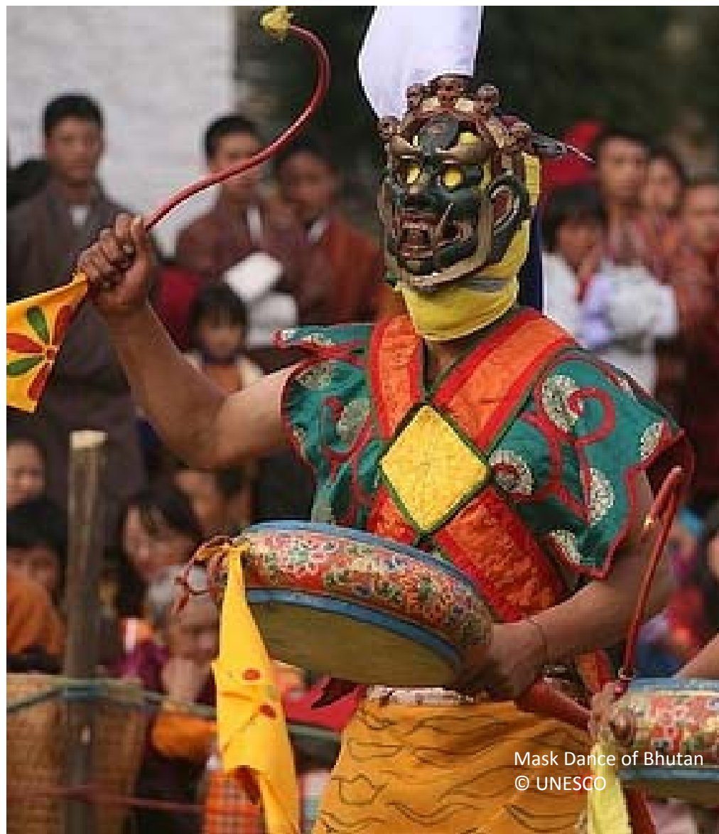
Mask Dance of Bhutan