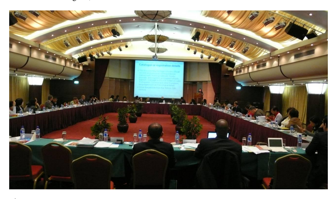
4th MOWCAP General Meeting

The 4th General Meeting of MOWCAP was held in Macau SAR, China on 17-18 March 2010. It attracted 57 participants and was hosted by the Macau Foundation and the Macau Documentation and Information Society. The Bureau met in Hanoi on 2-4 February 2011, hosted by the UNESCO National Commission of Vietnam. The 5<sup>th</sup> General Meeting is scheduled for March 2012 in Bangkok, Thailand.