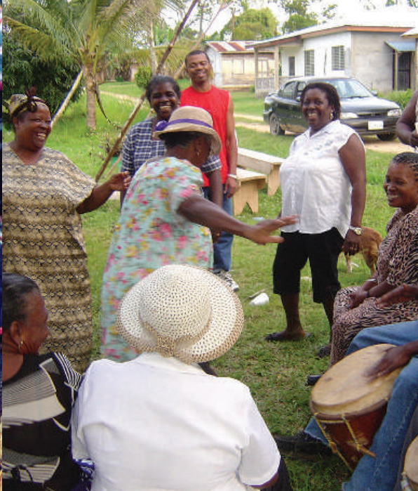
Language, Dance and Music of the Garifuna