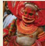
Intangible Cultural Heritage