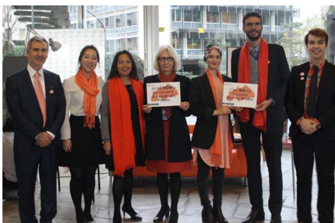
Staff members of the Division for Gender Equality

Staff members of the Division were present in the Orange Zone throughout the day and distributed publications, infographics and postcards with key messages as well as facts and figures concerning violence against women migrants and refugees. The participation of staff at HQ and in the field offices was impressive, with many colleagues from the field joining their voices to this campaign by sending pictures carrying messages of non-violence and engagement. During the evenings of 24 th and 25 th of November, UNESCO’s globe, a landmark in Paris, was illuminated in orange – the official colour of this Day – as a sign of UNESCO’s commitment.