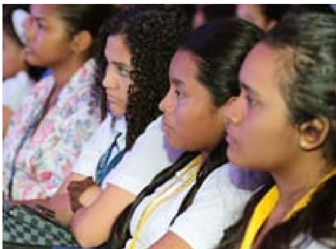
Middle school students attending the TeachHER Regional Workshop

The six day event was part of the TeachHER Initiative designed to address the gender gap in science, technology, engineering, arts/design and maths (STEAM) education by working with global, regional and local partners to provide countries with capacities to engage middle school girls in STEAM fields. Despite high global demand in the technology and engineering fields, women are still severely under-represented in the STEAM workforce across all regions of the world.