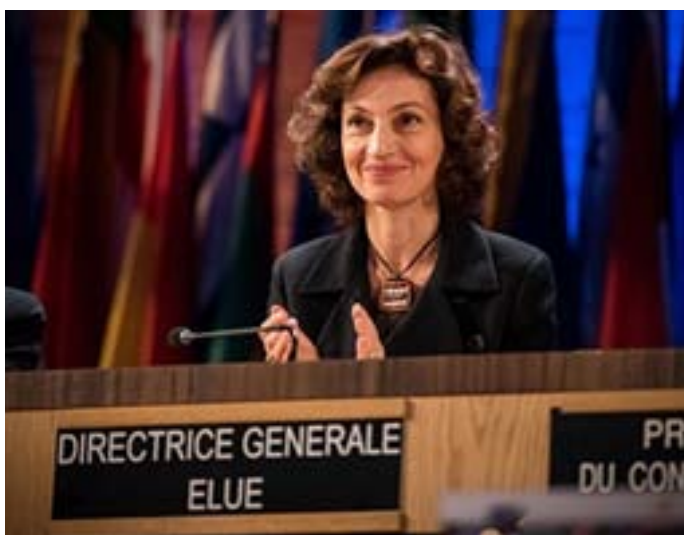
Audrey Azoulay at the 39th session of the General Conference

The 39 th session of the General Conference elected Audrey Azoulay (France) to the post of the Director-General of the Organization. Ms. Azoulay is the 11 th Director-General of UNESCO and the second woman to occupy this position after the previous Director-General Irina Bokova (Bulgaria). In her speech at the General Conference on November 10 th Ms. Azoulay said: