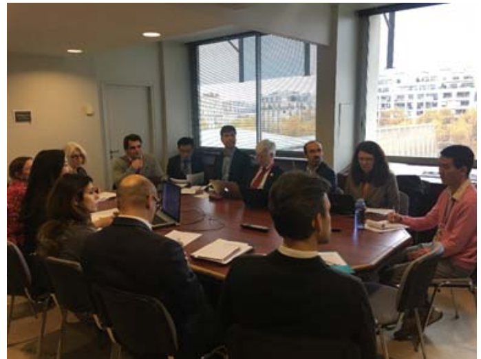
EQUALS Skill Coalition Working group meeting in UNESCO HQ

As the co-lead of the EQUALS Skills Coalition, UNESCO hosted a two-day interagency meeting at UNESCO headquarters with 18 colleagues from 8 agencies present both physically and virtually.