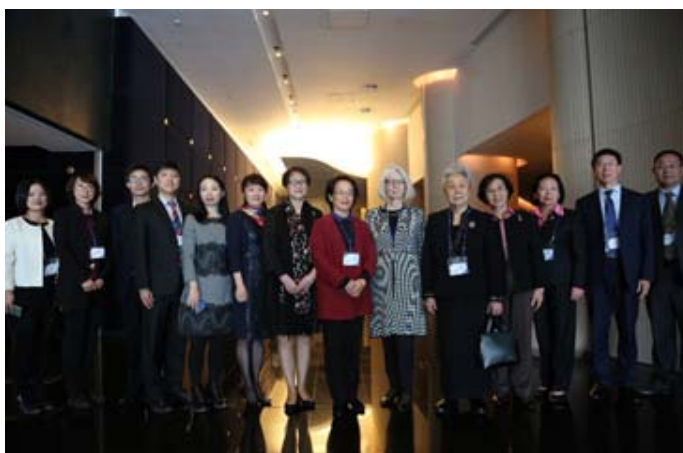
Attendees of the Forum in Russia