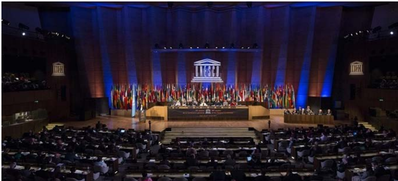
Room 1, UNESCO, during the 39th Session of the General Conference

This year, the two most important governing body meetings of UNESCO were held barely a month away from one another – the Executive Board in October and the General Conference in November. The topics of gender equality and women’s empowerment were frequently discussed during many debates and Member States confirmed their on-going support for Priority Gender Equality.