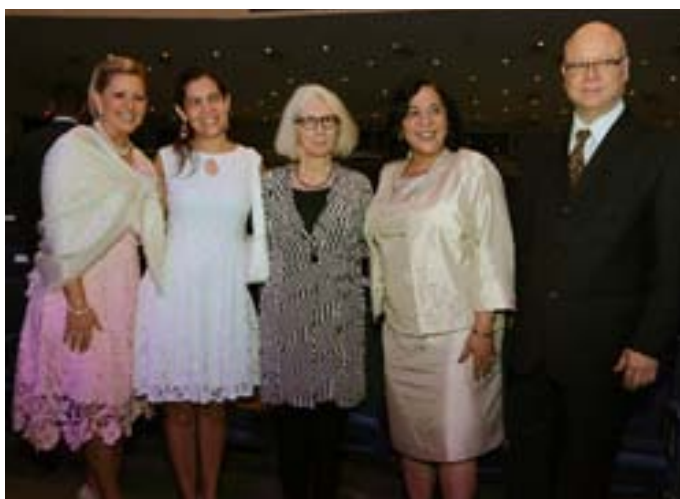
From left to right, First Lady of Panama, Participant, Director for the Division for Gender Equality at UNESCO, Minister of Education of Panama, and the Ambassador of Panama to UNESCO

A growing number of girls and women are interested in STEAM fields yet we see the enrolment numbers decrease as they move up in the education system. UNESCO is a core partner of the initiative along with other organizations including the International Institute for Education (IIE), Microsoft, FitBit, the Higher Life Foundation, and others.