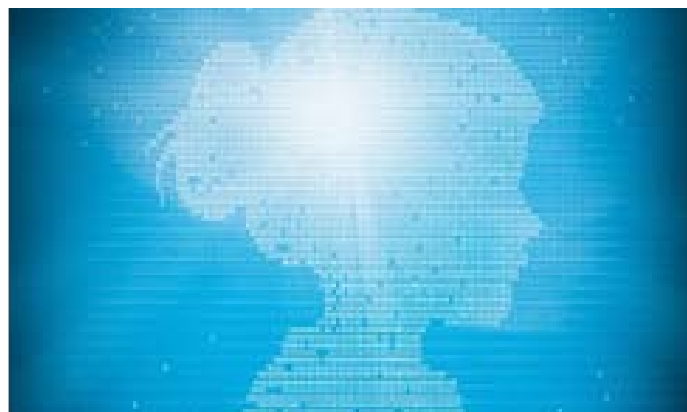
Click on the image to access the publication