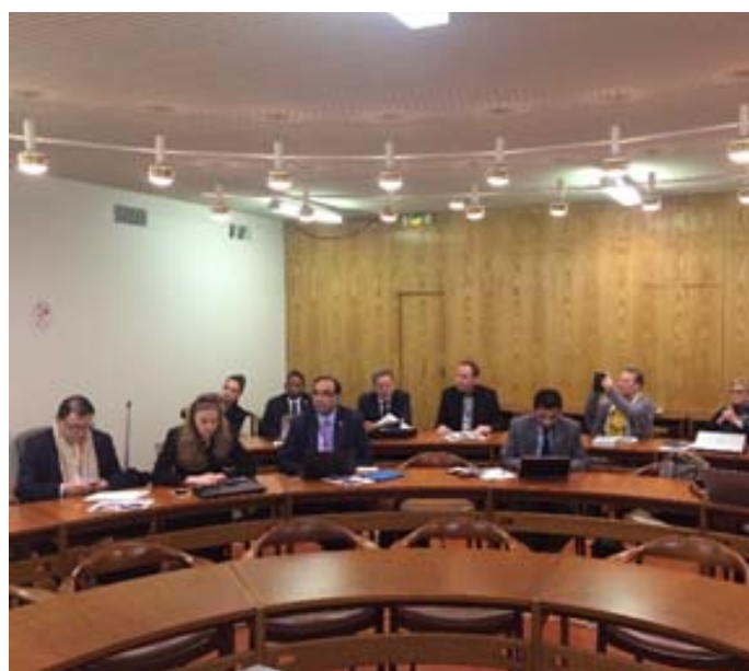
Representatives of Field Offices in UNESCO HQ

The Director of the Division for Gender Equality met with 26 field office representatives to reiterate the importance of Priority Gender Equality and provide updates on new policies and initiatives on Gender Equality. The Director explained the new Executive Board Decisions that call on UNESCO to implement gender transformative programmes in all of its sectors and the new budget tracking system for Priority Gender Equality that has been introduced starting the next biennium (2018-2020).