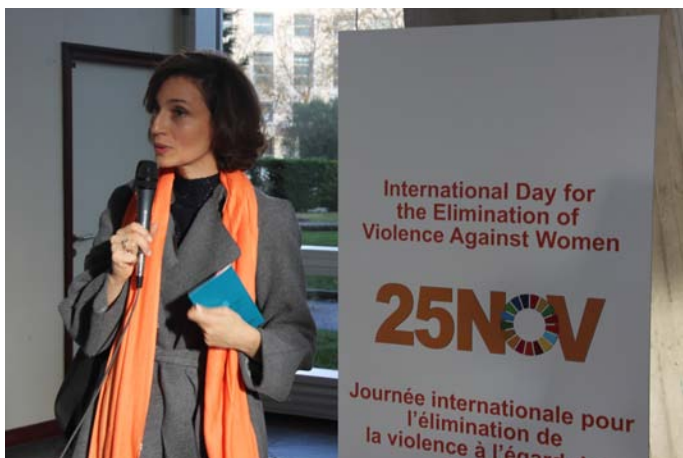
Ms Audrey Azoulay, Director-General of UNESCO

On Friday 24 th November, the Division for Gender Equality organized an Orange Zone at UNESCO Headquarters in observance of the International Day for the Elimination of Violence against Women (25 th of November). The day marked UNESCO’s strong commitment to eradicate violence against women and was a powerful tool for global activism.