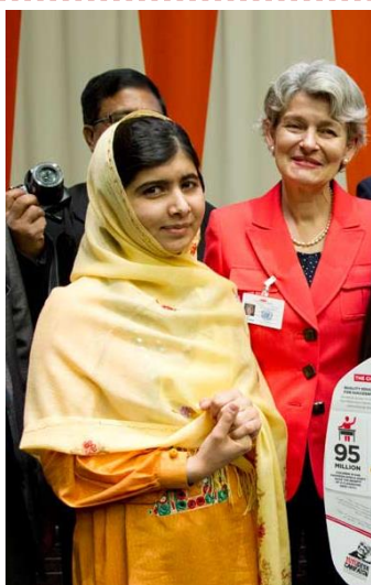
UNESCO DG and Malala, New York 2013

GEM level: 3, gender transformative. To read the whole workplan, please click here .