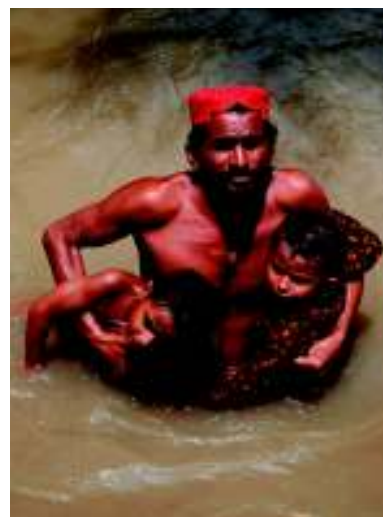
Flood Disaster Pakistan

Within the framework of OP II, UNESCO Pakistan will be guided by, and partnered with, the UNCT. UNESCO will align itself and benefit from the opportunity of a combined One UN platform (see Annex: IV for link between country programming document, and operational plan). This will help enhance cooperation with sister UN agencies in joint programming—with a focus on reducing transaction costs, duplication, joint monitoring and implementation, for the achievement of better outcomes. In this context, UNESCO’s own country programming will be guided by the OP II Management Structure (see Figure: 1). Such an alignment will ensure that UNCT and UNESCO are adequately supported and advised on both programmes and operations, so that strategic oversight can be maintained, and UNESCO will be able to establish its cross-agency role and operational arrangements.