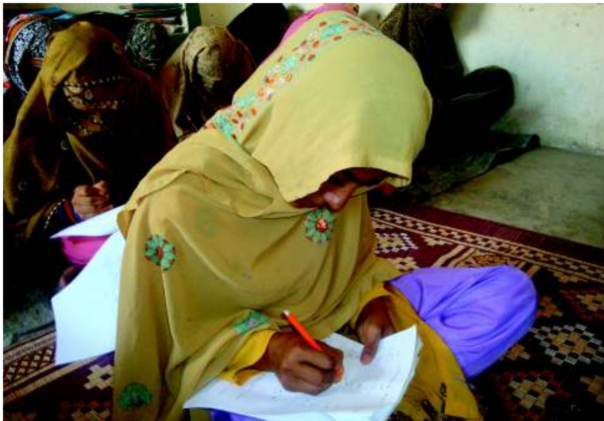
Adult Literacy Project

At the level of higher education, Pakistan has a total enrollment of over 1.108 million students annually at 139 tertiary education institutions, 67 per cent of whom are male and 33 per cent of whom are female). 41 According to a Pakistan Council for Science and Technology survey 2009, there are 44,639 researchers attached to Higher Education Institutes (HEI). The major impetus for expansion