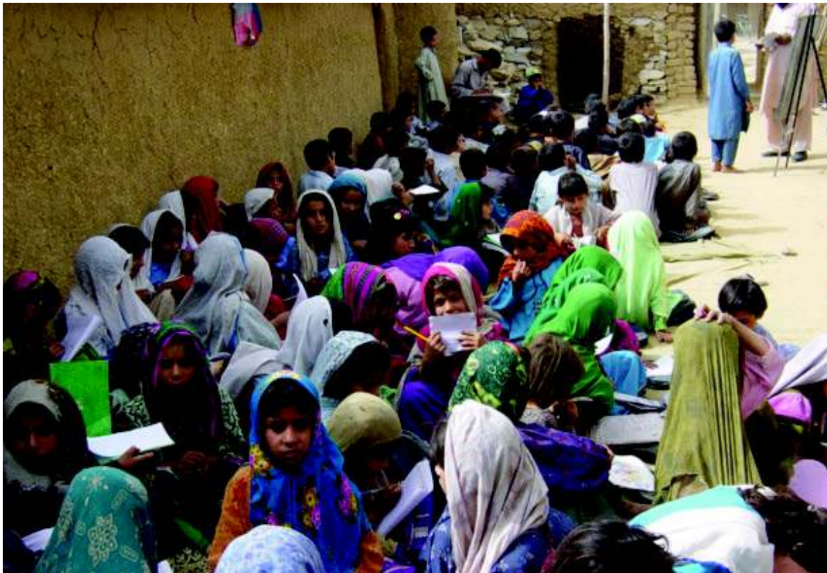
UNESCO Schools for Afghan Refugees

On the environmental front, UNESCO's Man and Biosphere programme for Balochistan's Juniper Forest will be up scaled-up from its pilot phase, to expand local theoretical and practical knowledge, safeguard biodiversity and maintain the ecosystem services. The Juniper ecosystem could prove to be Pakistan's testing grounds for green economy initiatives in sustainable use of natural resources. For science popularization and advocacy, UNESCO intends to foster interaction between scientists, policymakers and civil society, to steer the connection towards an inclusive and interdisciplinary relationship. Such holistic architecture of policy design and implementation will be achieved by promoting broad-based societal participation in STI – advocating central roles for indigenous knowledge and community-based actions, and through wider public awareness and youth engagement.