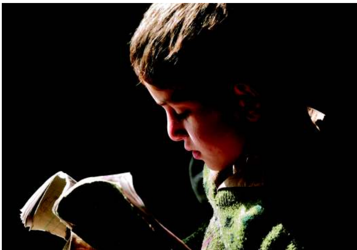
Literacy for All

in the last 10 years. 36 Out of this refugee population, 50 per cent are under the age of 14, whereas 70 per cent are under the age of 18 years. 37 To help them meet basic needs, Pakistan has been facilitating the provision of education services to refugee children. Regardless of these efforts, the illiteracy rate is still very high among Afghan refugee children. Only 55,000 (3.4%) of 1.61 million registered Afghan refugees have completed primary education, whereas 120,000 (19%) Afghan refugee children of age between 5 and 16 years are enrolled in primary school, of which only 4% of girls and 6% of boys complete the primary education cycle. 38