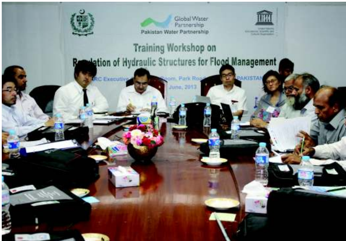
Flood Management Workshop