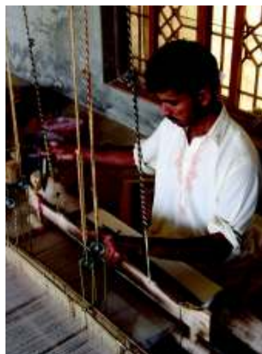
Culture for Development

After the 2005 earthquake, UNESCO supported the rehabilitation of affected TVET institutions, besides building two industrial training schools for women in Azad Jammu Kashmir (AJK). UNESCO provided technical assistance for the integration of earthquake-resistant design and construction in Diploma of Associate Engineer (Civil) curricula. Subsequent upon their approval by NAVTTC, assessment resources for competencies required for masons and carpenters as per new skill standards were developed. UNESCO promotes national dialogue on TVE by the organization of national roundtables, which include the participation of representatives from all provinces and relevant stakeholders.