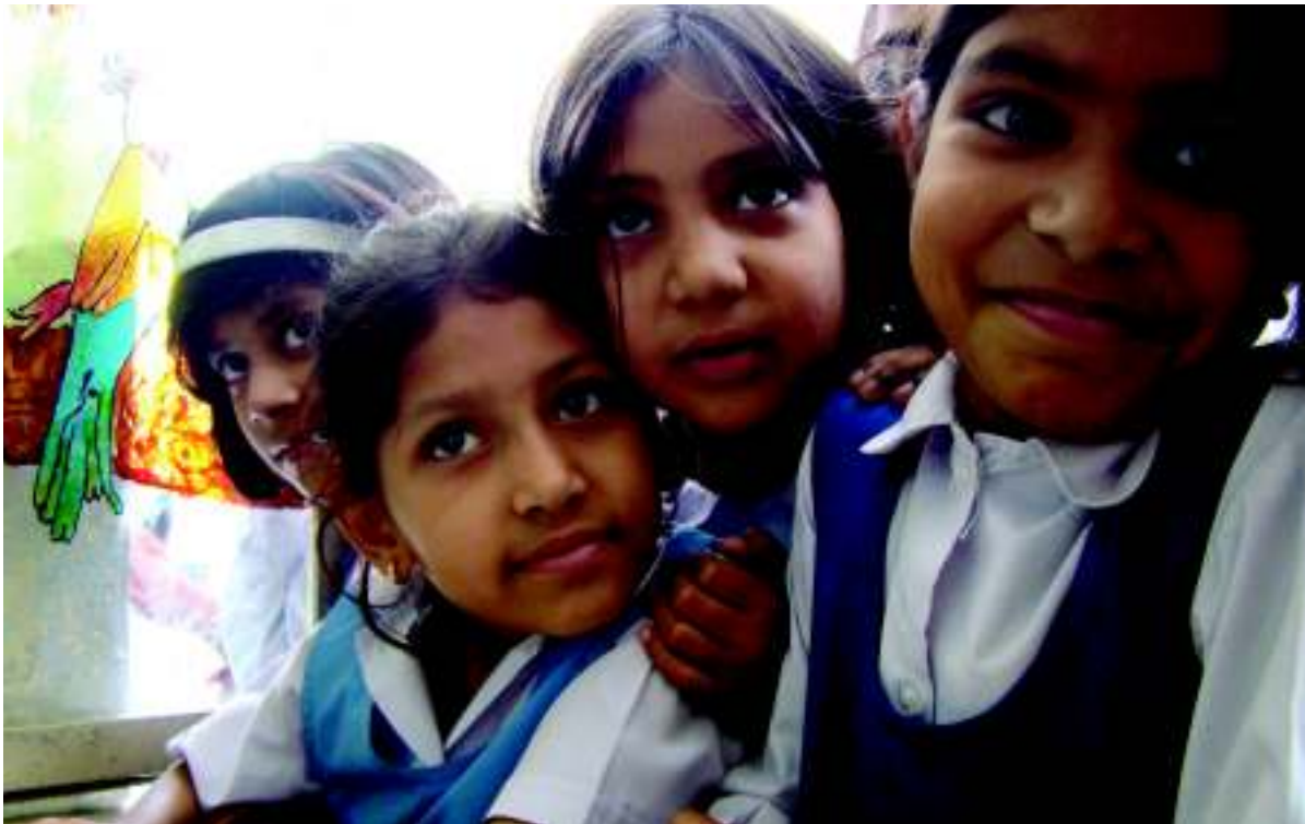
Primary Education

UNESCO with its partner agencies will work towards the implementation of an inclusive monitoring and evaluation framework that will respond to core design elements of the One UN Fund, and help improve results-based management and accountability mechanisms. This will serve as a tool for regular assessment of One UN efforts, create linkages between financial investments and programmatic results, enable allocation based on performance, and enhance the organizational learning at project and programme levels. Such a mechanism will also streamline the allocation of funds with provincial and federal counterparts, and help UNESCO and other partner agencies to address capacity and resource gaps, extend support for transitional arrangements and pave the way for joint monitoring and evaluation of SPA 1.