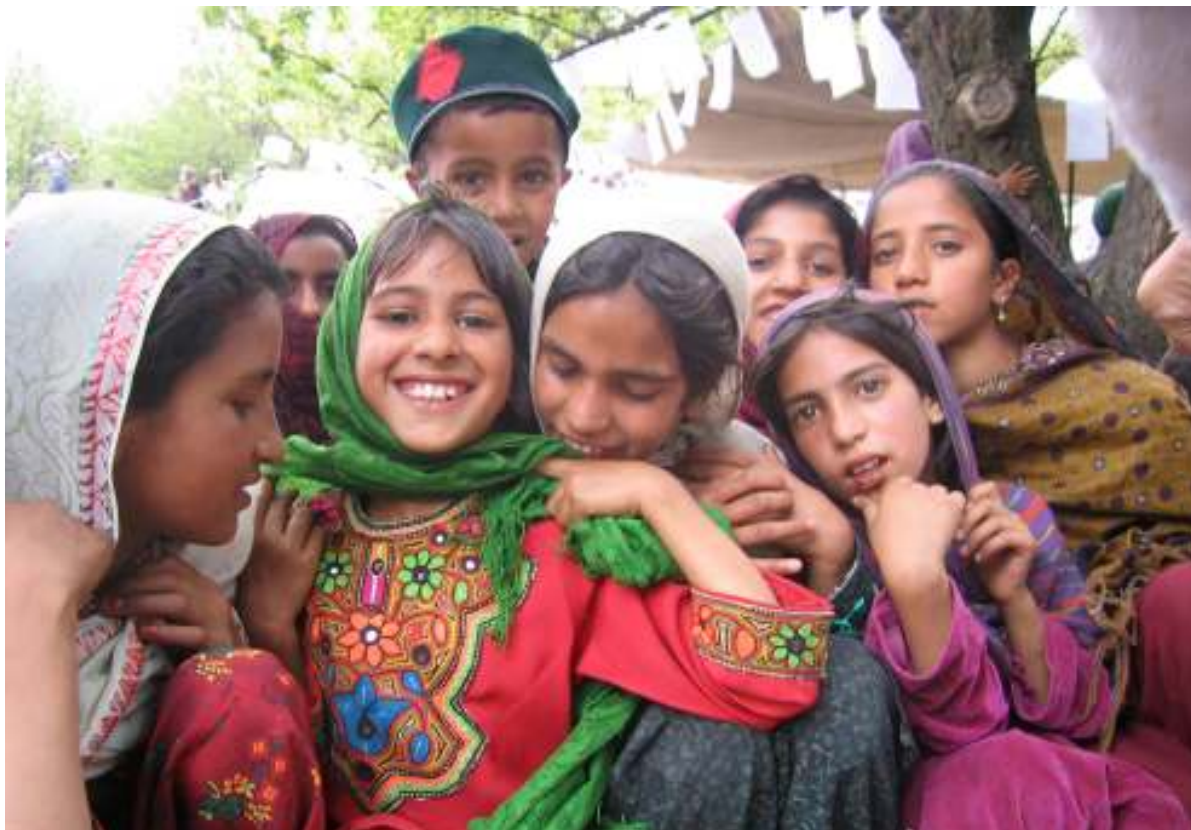
Recrafting Destiny through Culture