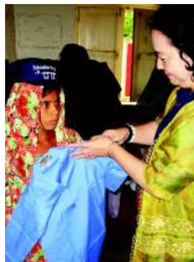
Distribution of Uniform in Flood Affected Area

UNESCO has conducted various school safety workshops in Balochistan, Sindh, Pakistan Administered Kashmir, Khyber Pakhtunkhwa and FATA, which has resulted in the development of a school safety action plan (a policy document), and interdepartmental provincial mechanisms. It also