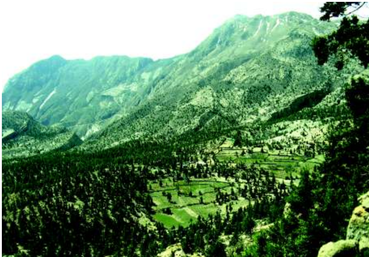
MAB Ziarat Juniper

In the aftermath of recurrent floods (2010-2011), Pakistan needed an immediate upgrade in its analysis and forecasting capabilities, especially along the Indus River, to predict and assess the likely extent of damages. In order to reduce the human and socioeconomic impact of floods in the country, and to improve their ecological benefits for agriculture and storage, UNESCO with financial assistance from the Government of Japan supported major upgrades to Pakistan's flood