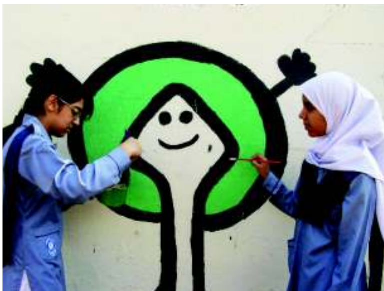
Heritage in Young Hands

Women in Pakistan need education and empowerment for inclusive engagement in order to act and contribute to society as an equal and effective pillar. Legislative support, institutional protection, societal inclusion, and attitudinal change, are needed on the part of society as a whole to allow women to stand at their rightful place as equal decision-makers in family, community and the national level.