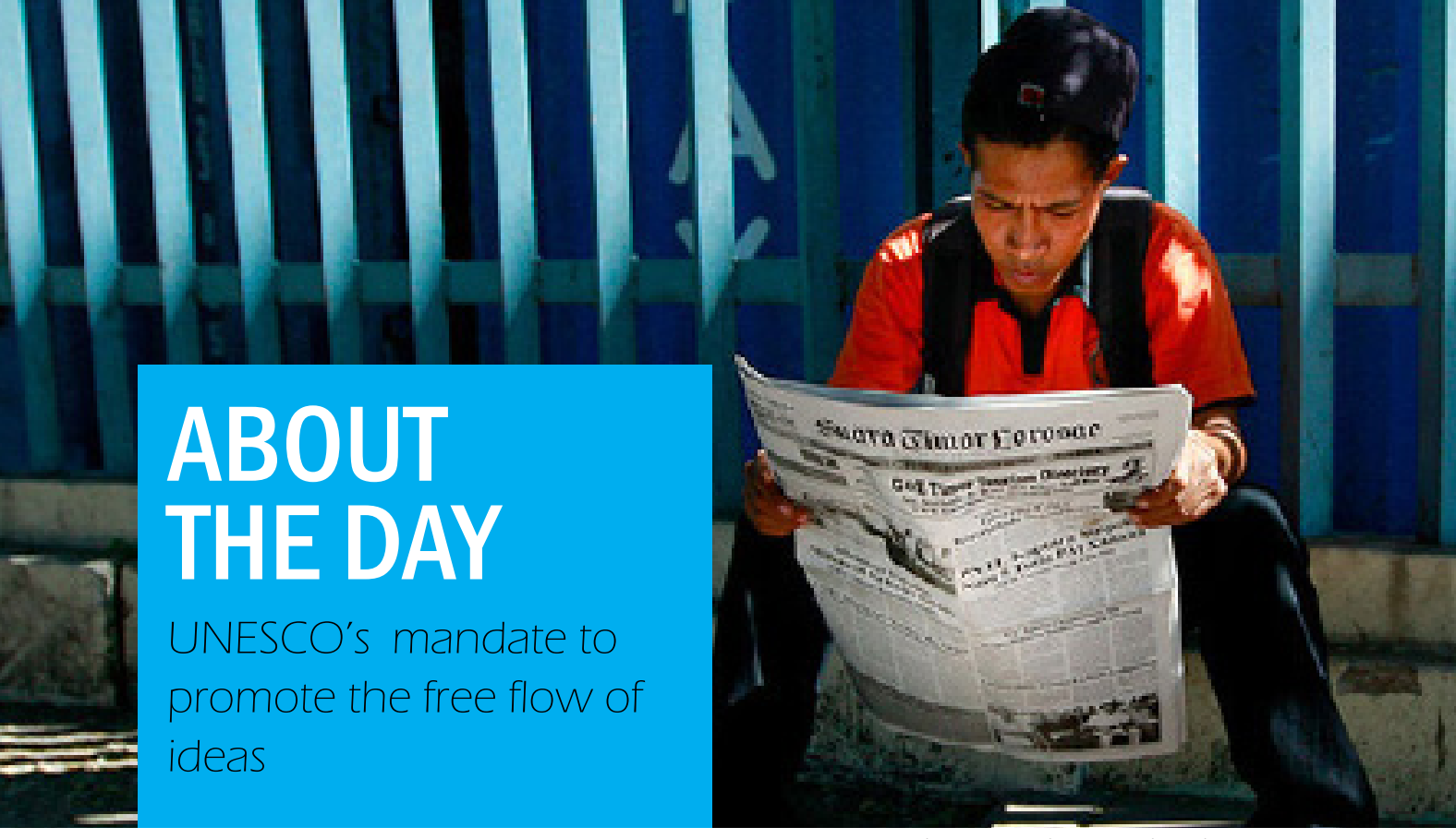
Young man reading newspaper in Dili, Timor-Leste.

he United Nations Educational, Scientific and Cultural Organization (UNESCO) is the United Nations specialized agency with the mandate to promote and defend freedom of expression as well as its corollary, freedom of the press. UNESCO's Constitution adopted in 1945 calls on the organization to foster "the free exchange of ideas and knowledge" and the "free flow of ideas by word and image."