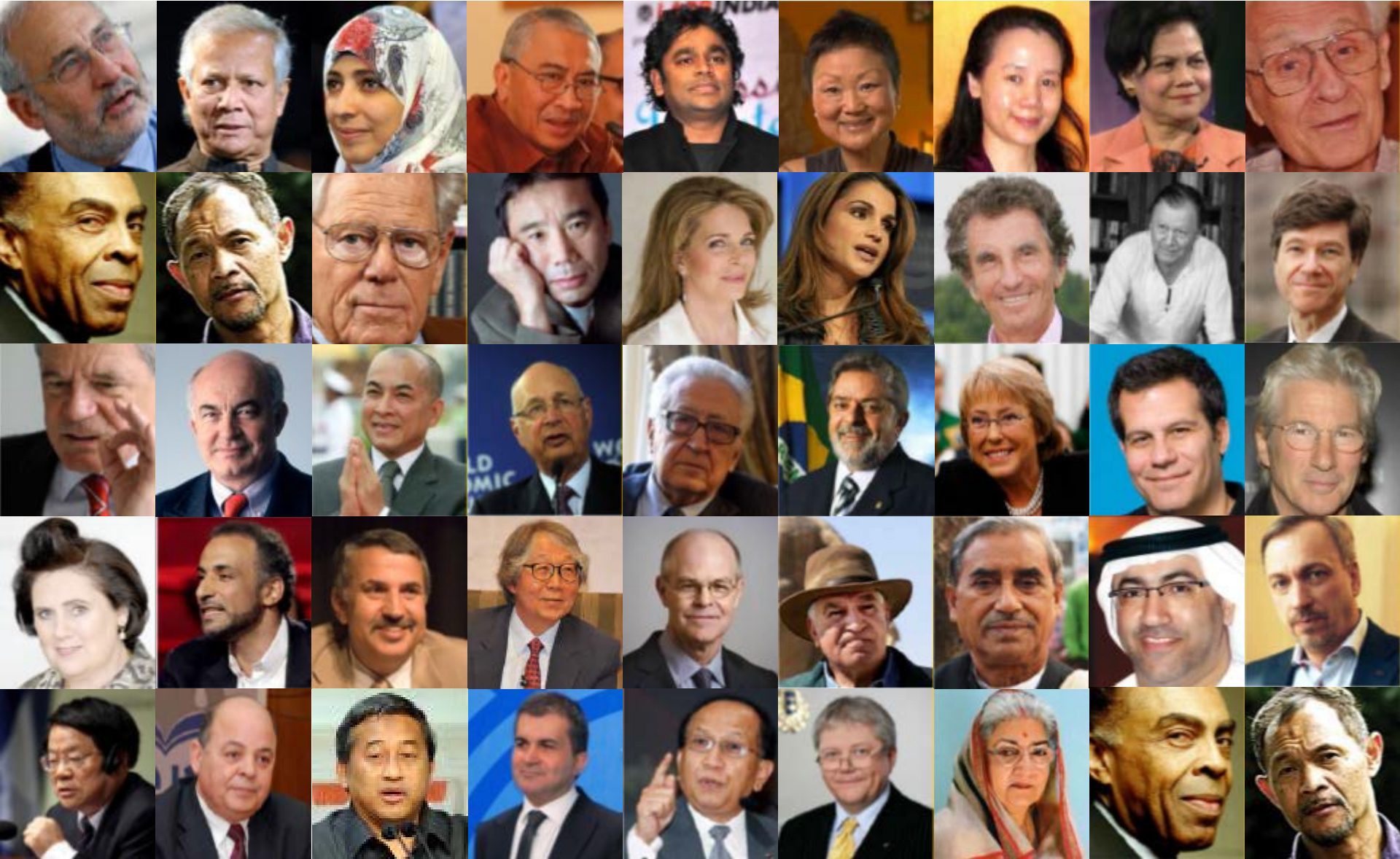
Proposed Speakers: Nobel Laureates, Minister of Cultures, Eminent cultural experts and practitioners