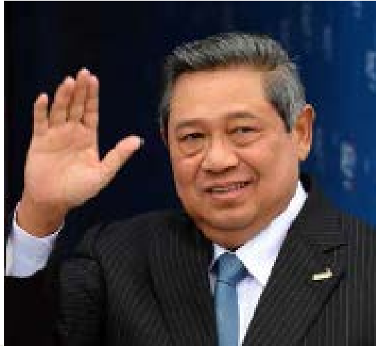
H.E. DR. H. SUSILO BAMBANG YUDHOYONO

The President of The Republic of Indonesia