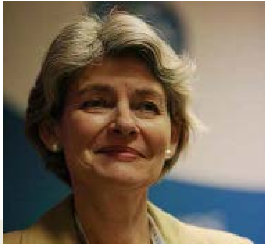
H.E. IRINA BOKOVA