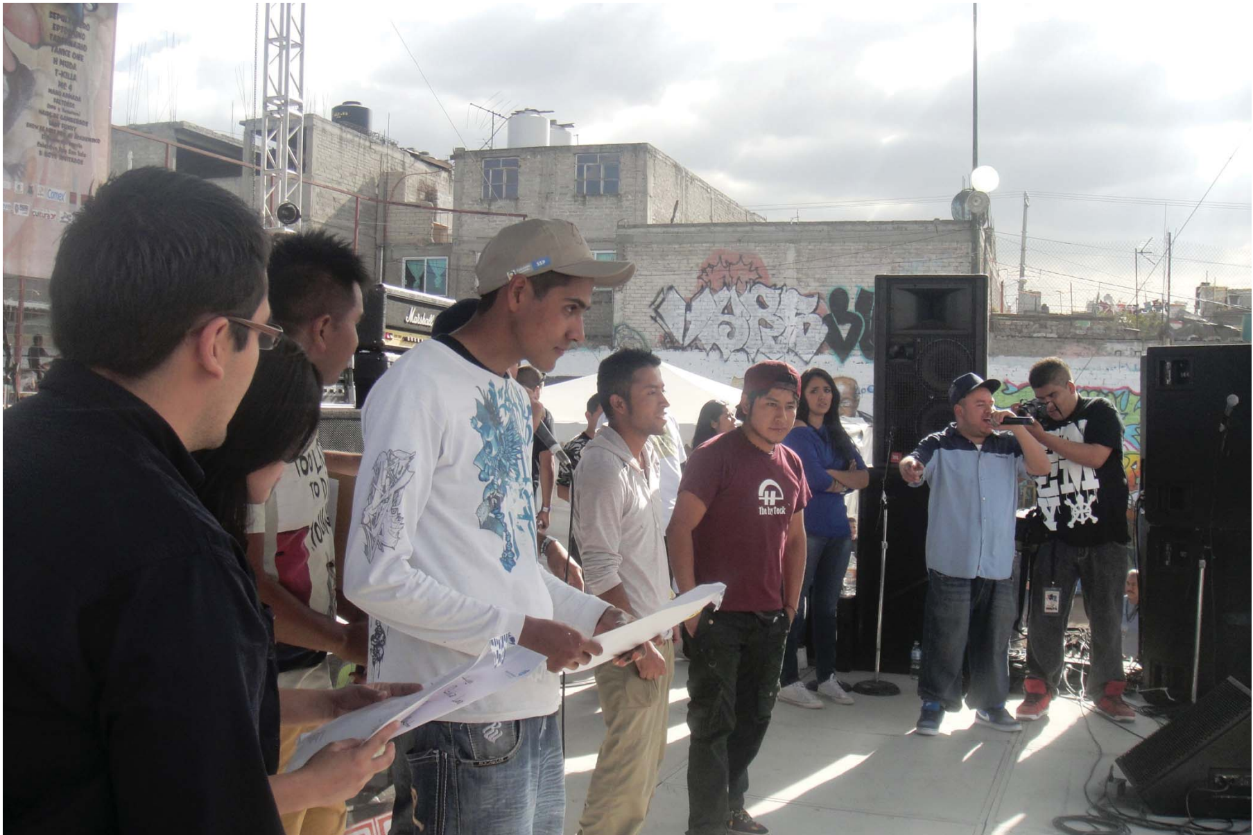
Mexico. Consejo para el Desarrollo Comunitario - Chavos Banda Codeco. Urban Art [graffitti & hip hop] workshops to promote a culture of peace in Iztapalapa, Mexico City.