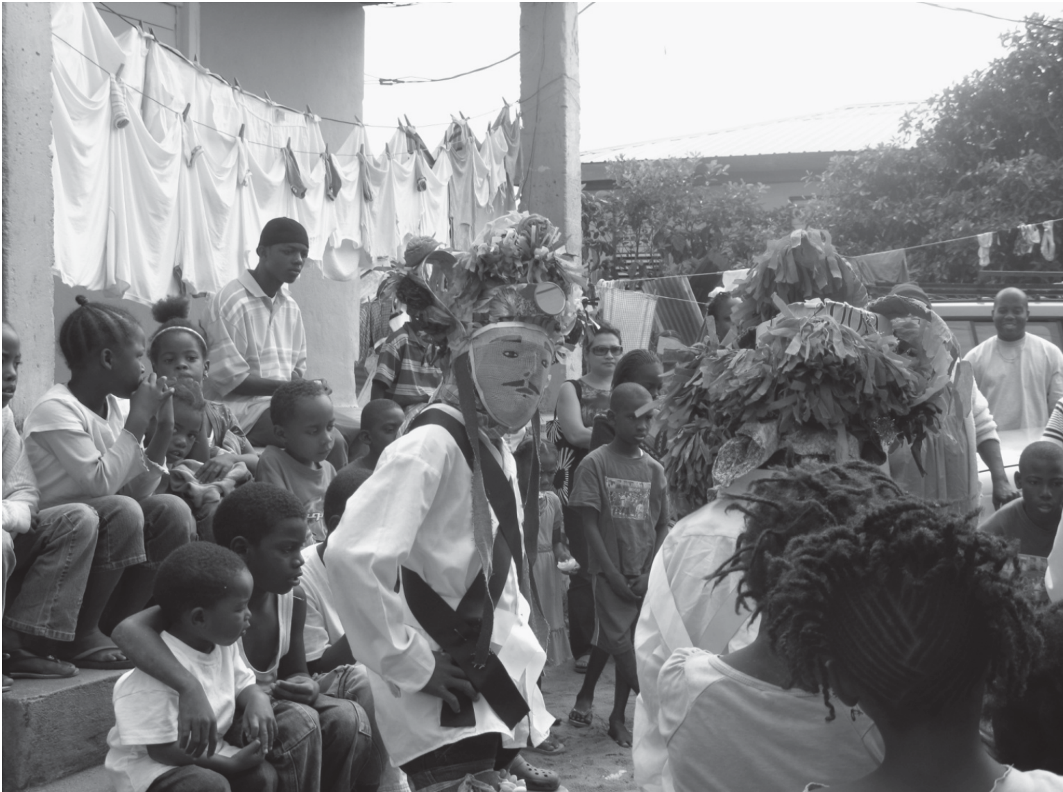
Belize. Placencia Peninsula Arts Association. Way Bak Den: Preserving and celebrating Creole and Garinagu culture through creative writing, photography and journalism for the collection of oral ancient myths of Placencia Village and Seine Bight Village, Stann Creek.