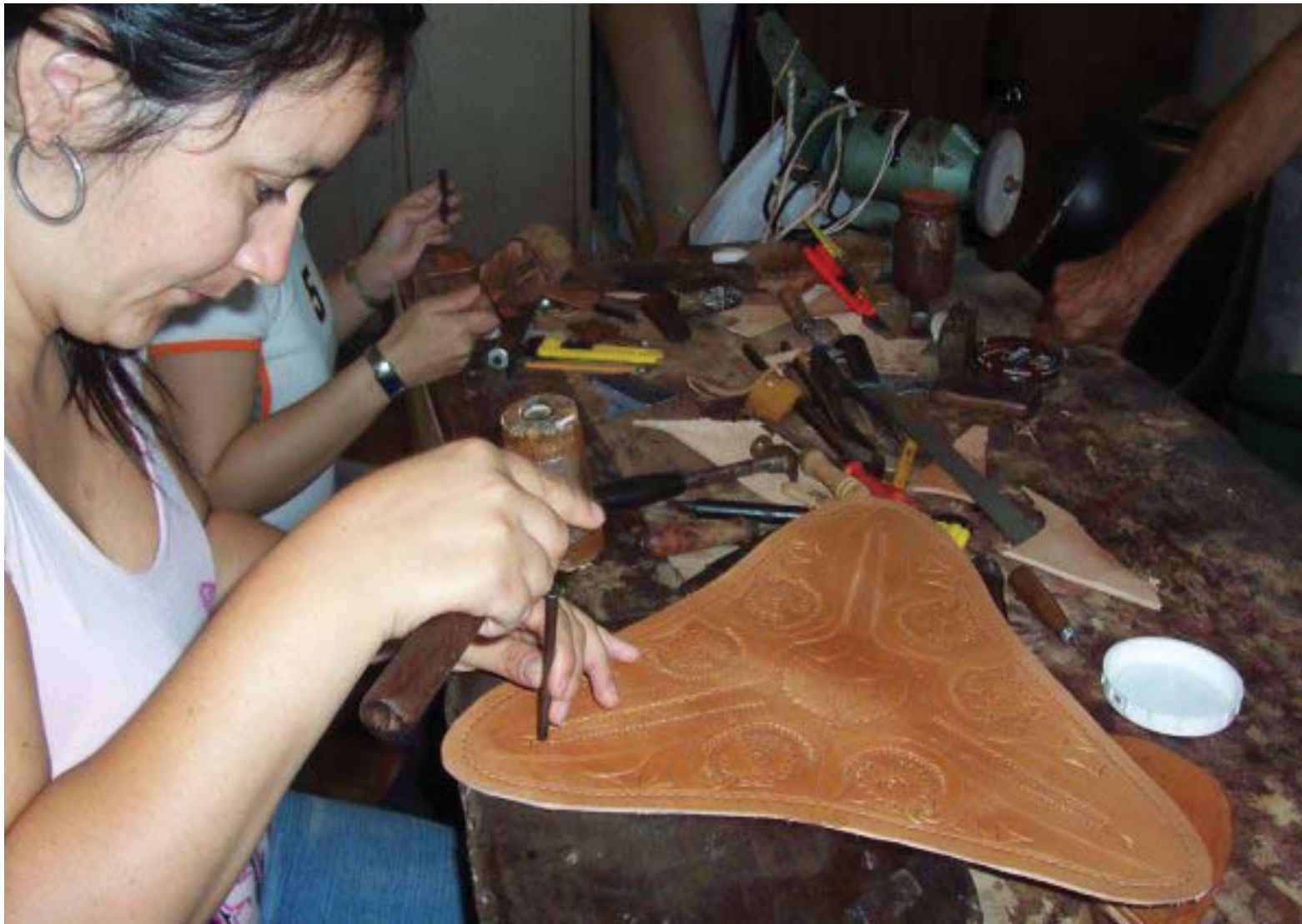
Argentina. Museo de Artesanías Tradicionales Folklóricas. Rescuing our Heritage: traditional leather production workshops in Corrientes.