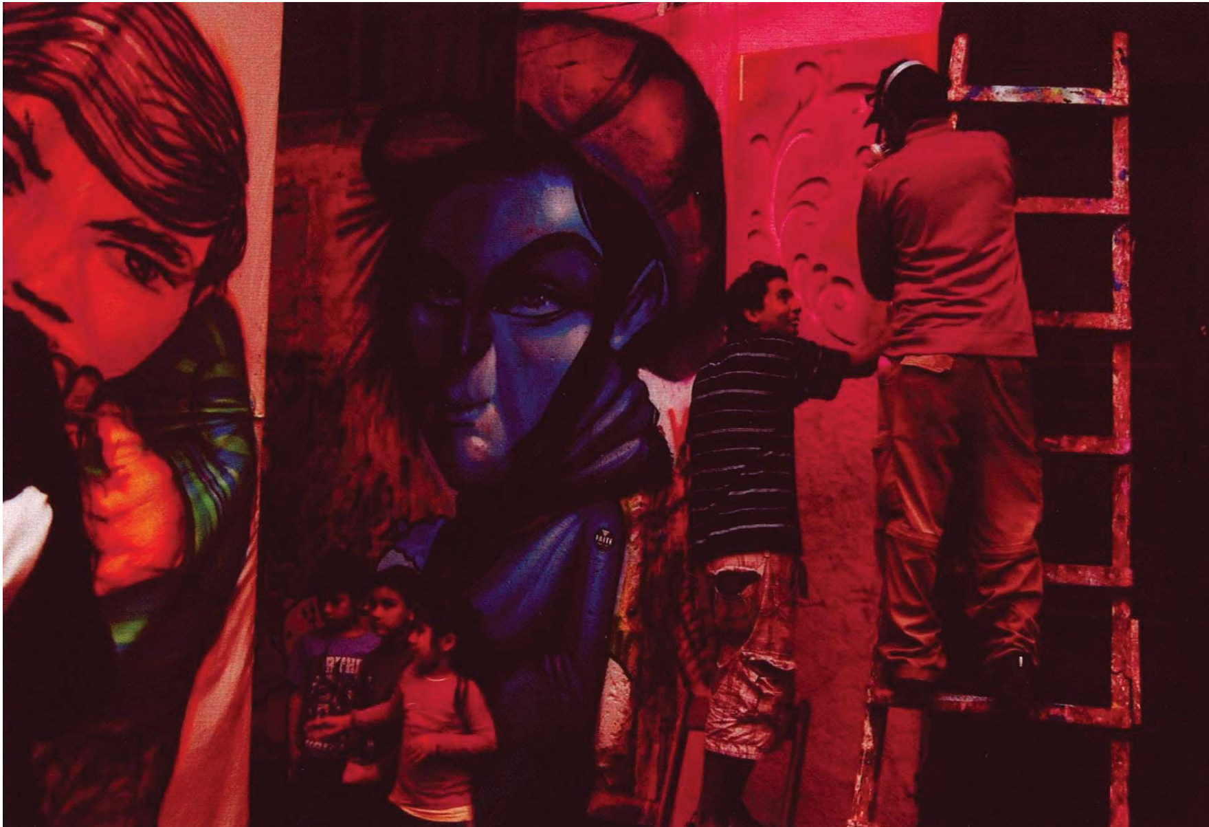
Peru. Casa Vieja Project by Parakultural Art and Science. Urban development awareness campaign to improve basic living conditions through a coalition of artists implemented in downtown Lima