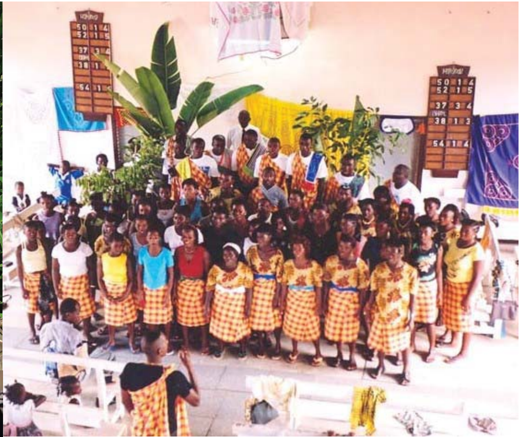
Suriname. Tooka Foundation. Music training courses for the Saramacan ethnic group in the Upper Suriname Region.