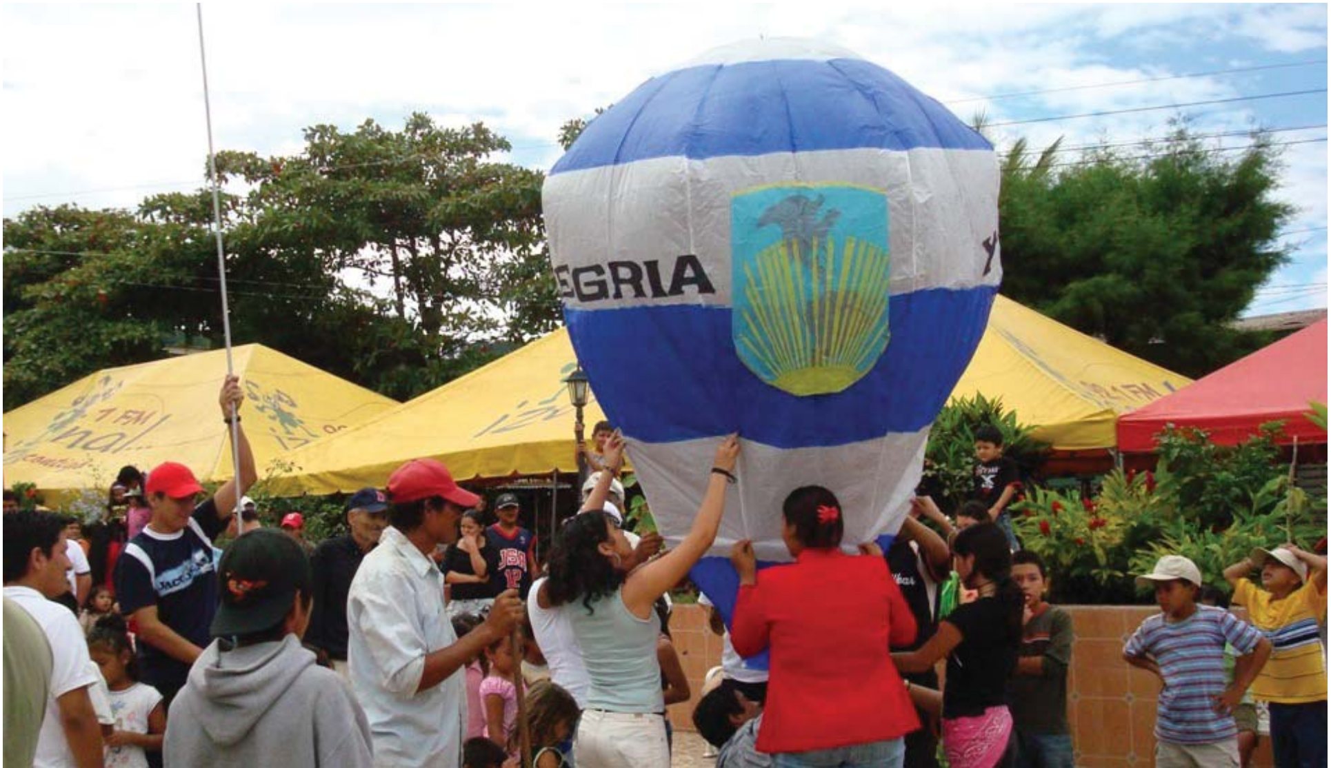
El Salvador FUNDE - Fundación Nacional para el Desarrollo. Revival of cultural tourism in the town of Alegría, Department of Usulután.