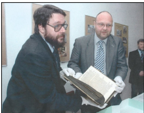
The director of the Municipal Library of Prague (left) receives the last of the restored old printed books from the hands of the Director-General of the National Library. The whole collection of old books in the Municipal Library was flooded in 2002. After having been frozen, all the books were dried and restored in the National Library, mostly in the specially built large capacity vacuum drying chamber (below).

Library in Prague which had been frozen to preserve them after floods. Its capacity will now be used to assist the National Technical Museum with the preservation of all the old documents of Czech architecture and aviation.