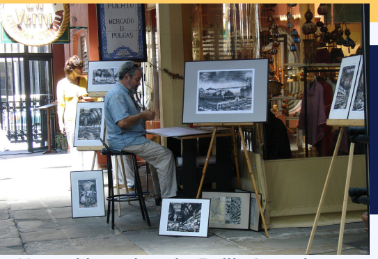
Montevideo painter by Emilia Garassino CC BY-SA 2.0

As global food supplies have been disrupted by the pandemic, some cities have responded to increase food security. In Montevideo ( Uruguay ), for example, citizens and local organizations are implementing a traditional model of home deliveries of food, fruits and vegetables called "ollas populares" – some directly from producers to consumers, with special attention to vulnerable people. In the city of Bamberg ( Germany ), a World Heritage Historic City, urban gardening has been practiced since the Middle Ages. These late medieval structures for gardening, and the traditional knowledge of how to farm them, have helped the city maintain a resilient food system during the crisis. Inspired by an initiative launched by UNESCO Creative Cities of Crafts and Folk Art Fabriano ( Italy ), bakers from several cities shared videos on social media on how to prepare the typical bread of local culture and tradition, including Paducah ( United States ), San Cristobal de Las Casas ( Mexico ) and Duran ( Ecuador ).