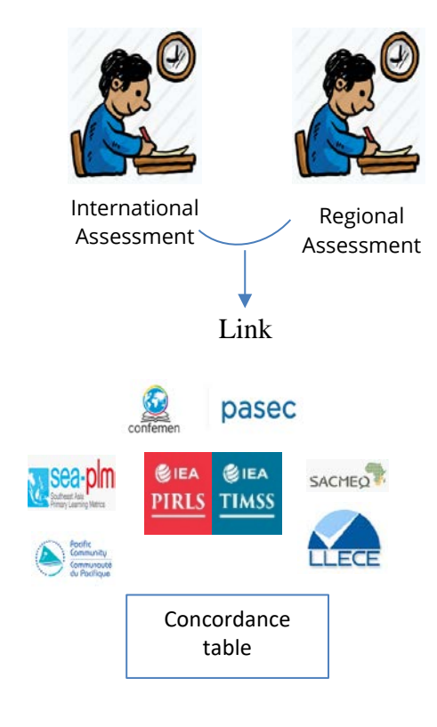
Figure 2. Simplified illustration of the test-based linking methodology

Which levels of education? It could be done at the end of primary education where regional and global assessments coexist and there is global capacity and interest. It would take advantage of the proficiency levels set forth by the International Association for the Evaluation of Educational Achievement (IEA) for its two assessments: TIMSS and PIRLS. TIMSS has been measuring trends in mathematics and science at four-year intervals since 1995. PIRLS has measured trends in reading literacy at five-year intervals since 2001. With 50 to 70 countries participating in each assessment cycle, the TIMSS and PIRLS achievement scales and their International Benchmarks are well established and used by countries all around the world.