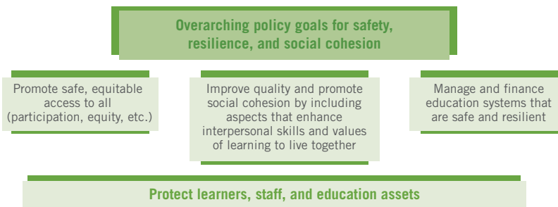
Figure 3.2 Policy goals