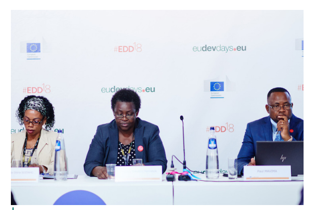
Female Teachers and Gender Equality debate panel

The TTF actively participated in the Pan-African High-level Conference on Education (PACE 2018) in Nairobi (Kenya) in April 2018 by organizing a parallel session on Teaching and Learning under the title: `Accelerating reforms to address the learning crisis: what are the most urgent and effective interventions to enhance Teaching and Learning? `. The session allowed for peer learning about good practices and innovative approaches to teaching and learning since 2015. It enabled exchange among countries and stakeholders on innovative and "what works" approaches to recurrent challenges in promoting quality of education; it also helped disseminate recent information on the state of the art for the subject in Africa. The results of the session was collected by the African Union Commission, IICBA, AFTRA and EI (Africa Region)<sup>5</sup> for their follow up under the CESA Strategic Objective 1 on "Teacher Development in Africa"