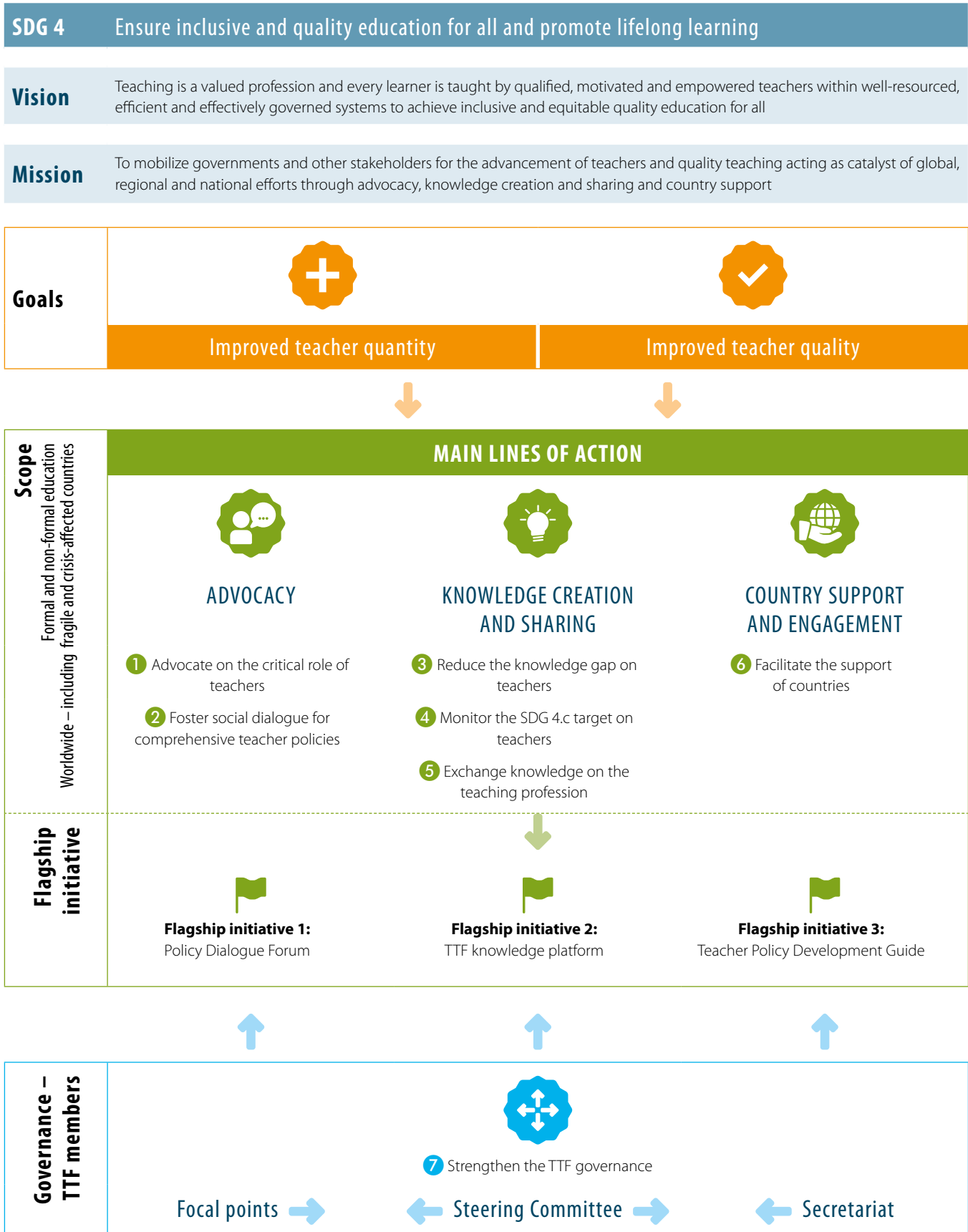
Figure 1: Theory of change