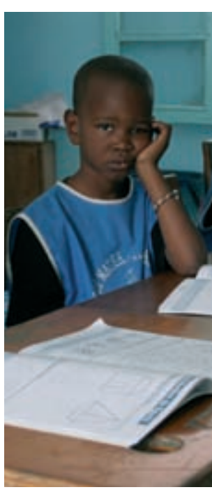
© UNESCO BREDA - Maio Bels & By Reg