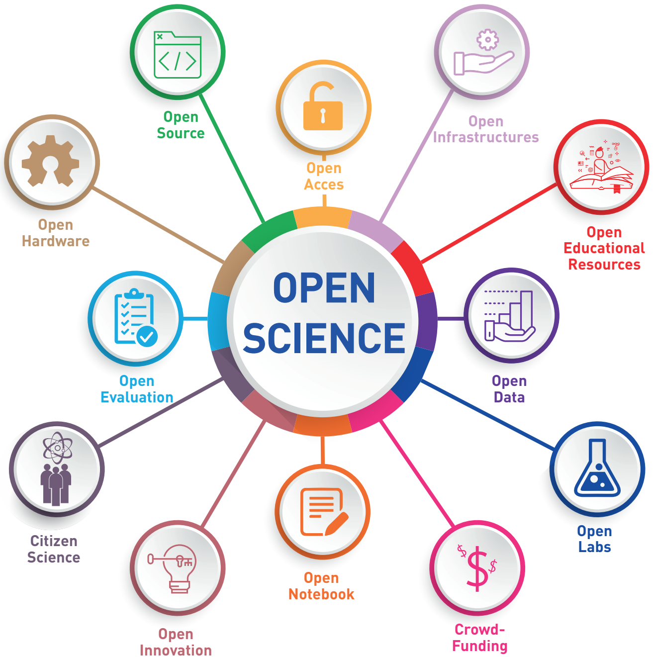
Components of Open Science