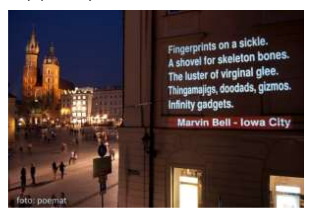
A portion of a poem by former lowa Poet Laureate Marvin Bell is shown on the wall of a building in Krakow's market square as part of a sub-network collaboration among Cities of Literature.

addresses the city, and a photo that ties with the poem, for a display at the Reykjavik city hall.