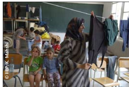
Displaced families in Lebanon

Educational outcomes in the region are particularly worrying. Various national and international assessments have concluded that Arab countries rank below the international average and significantly below scores achieved by developed countries. All Arab States have highly centralized education systems, dominated by government-produced curricula and textbooks. Curricula are often content-heavy, and textbooks, the sole source of