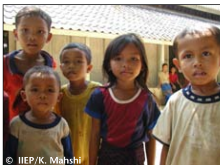
School children in Laos

A SIA is a continent of immense contrasts – with among the largest and smallest countries of the world in population, size, and economic development. It also has a rich diversity of culture, language, religion, history, and ideology. Even if limited to South, South-East, and East Asia, any analysis of progress towards EFA shows great variety in terms of achievements so far and the challenges ahead.