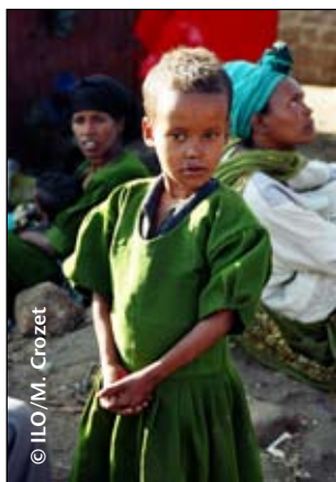
Street-child in Addis Ababa

ACCORDING to the 2007 Millennium Development Goals Report 1 , poverty declined in absolute and relative terms in the past fifteen years “ The proportion of people living in extreme poverty fell from nearly a third to less than one-fifth between 1990 and 2004 ”. Although undoubtedly something to be proud of, this is essentially due to the high and rapid economic growth in East and South-East Asia which has led to an impressive reduction of poverty. The situation is not quite as favourable in Western Asia and sub-Saharan Africa. Despite improvement in recent years, the proportion of people living on one dollar a day remains very high in sub-Saharan Africa (41.1%) and in Southern Asia (29.5%). Also, while the number of extremely poor people declined, income inequalities increased in almost every region, leading to further tensions. Specific strategies have to be devised to focus on the poorest segments of the population.