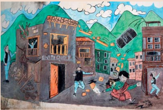
Earthquake mural, Kathmandu

Nepal is among the world's 20 most disaster-prone countries. Besides floods, landslides, storms, fires, and avalanches, a major earthquake tends to devastate the Kathmandu Valley every 70 years (the last one dating back to 1934). It is feared that the next earthquake could cause over 100,000 casualties, and it is estimated that 60 per cent of the public schools in the valley are at risk of considerable infrastructural damage. In addition, Nepal has faced armed conflict with the Maoist insurgency from 1996 to 2006, and civil unrest in the southern Terai plains since 2007. The Schools as Zones of Peace campaign 1 has been remarkably successful in reducing conflict risks in the education sector, and was adopted officially by the government in 2011.