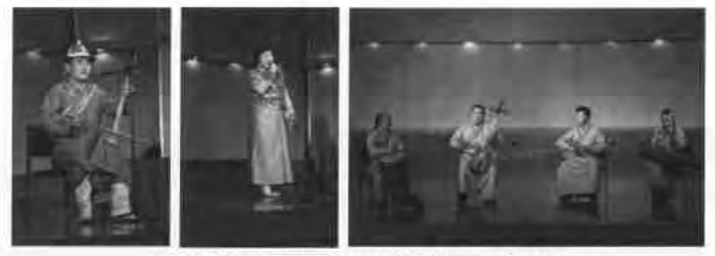
Opening Ceremony continues with IHC performing arts