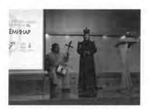
Opening Ceremony starts with Folk long song & Horse head fiddle