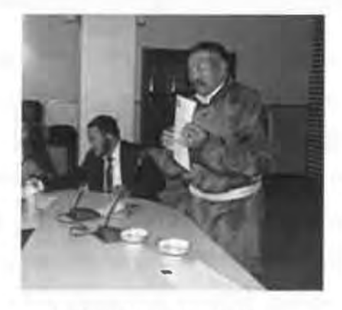
Bearer of Traditional Silversmith