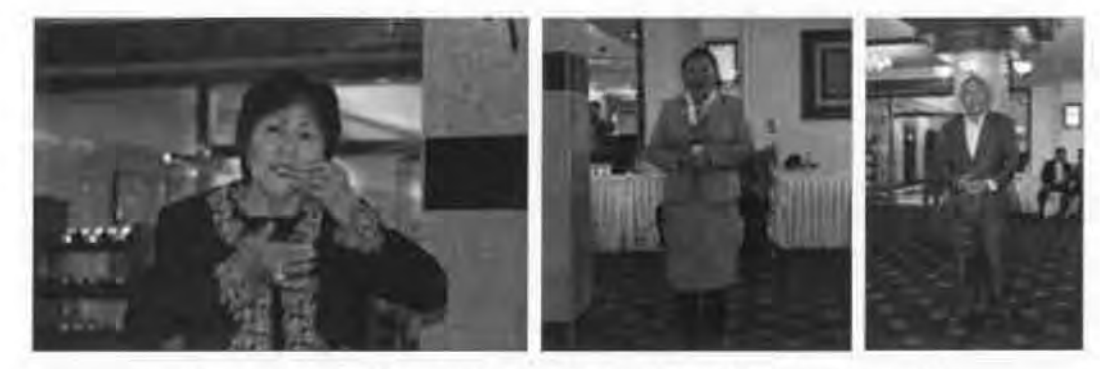
Bearers are performing their skills and practices for farewell

had nice buffet time with various dishes of Mongolian traditional meat and European salads and drinks.