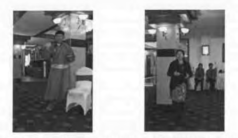
Bearers are performing their skills and practices for farewell