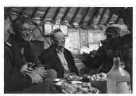
Guest are in the ger (traditional dwelling) being welcomed by the family

Several participants have organized a field trip to a countryside to visit a herder family. International expert was introduced to a family's daily life, customs, traditions and rituals related with animal husbandry.