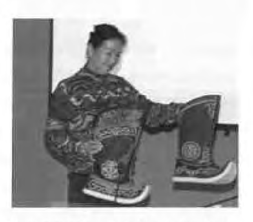
Bearer of Craftswoman of Mongolian Boot