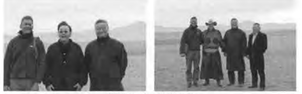
Participants outside the ger