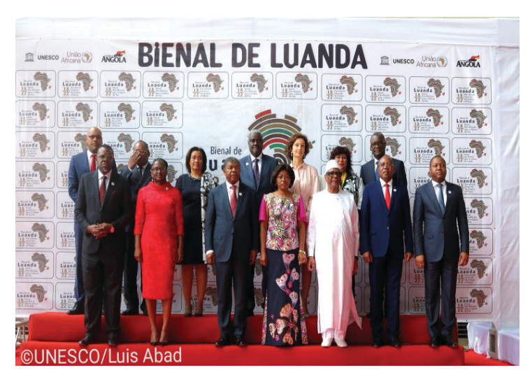
Heads of States, Government Officials, Chairperson of the African Unuon and Director General of UNESCO

The first Pan-African Biennale of Luanda for the Culture of Peace from 18 to 22 September 2019, with the main objective of facilitating the development of a Pan-African movement for a culture of peace and non-violence through the developing partnerships involving all stakeholders and ensuring that women are actively engaged as important pillars for sustainable peace on the continent.