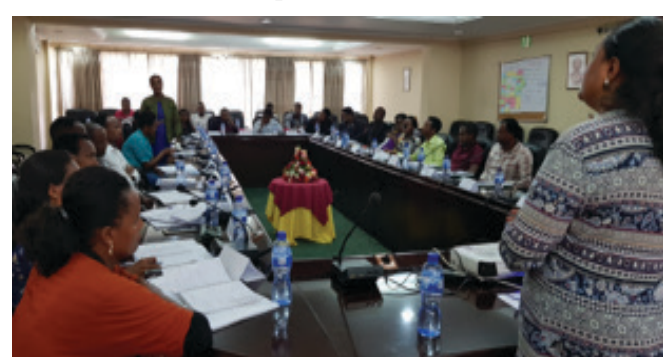
Workshop on on CLSE

UNESCO Liaison Office is closely working with its partners in the Federal Ministry of Education and regional education bureaus, as well as in educational institutions and teachers to promote CLSE and youth-friendly sexual reproductive health (SRH) education and facilities. The office organized a workshop for 29 senior curriculum experts, where core gaps in Ethiopian curricula with regards to CLSE and SRH were identified and addressed. Improved CLSE is expected to help the country and continent at large to reap the benefits of the demographic dividend.