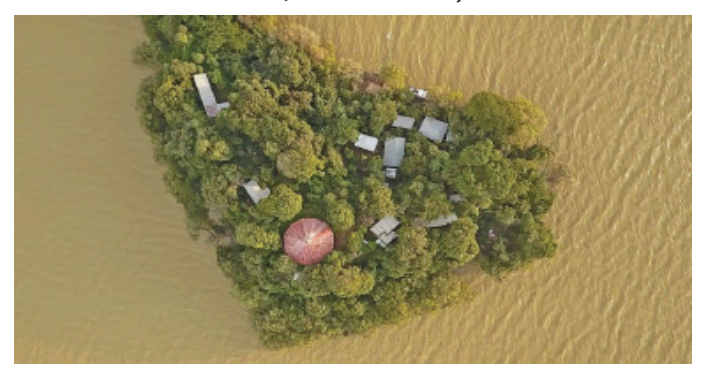
Extract from Lake Tana Documentary

Being listed as an UNESCO biosphere reserve since 2015, Lake Tana is the largest lake in Ethiopia and the main source of the Blue Nile. As such, it is an integral part of the diverse local ecosystem.