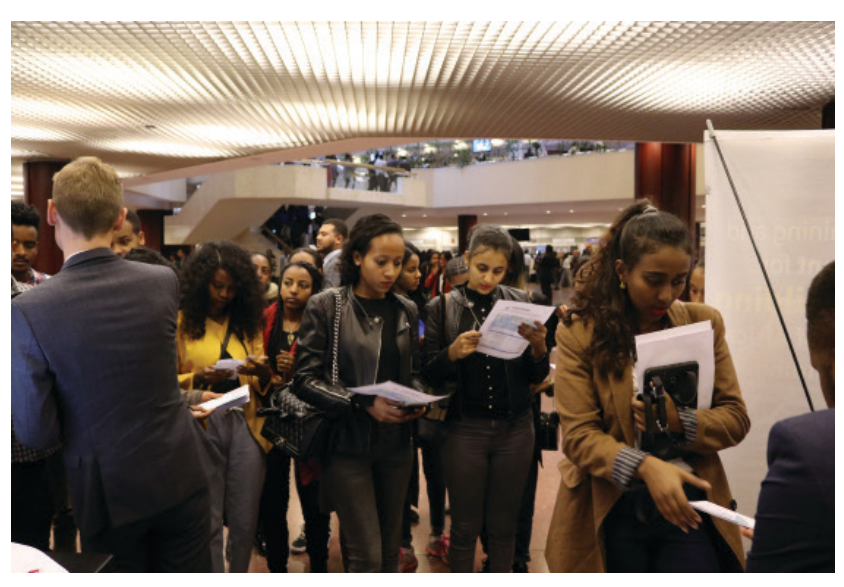
Young Participants at the Career Fair