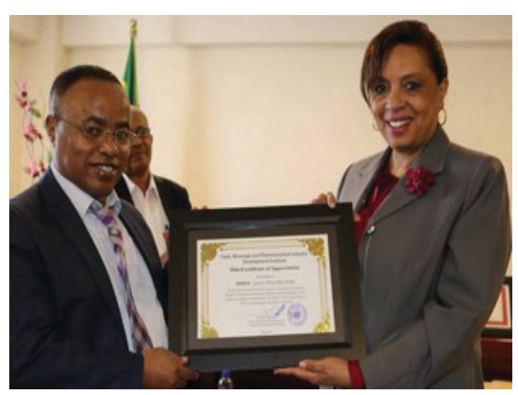
The Director of the UNESCO Liaison Office to AUC and UNECA in Addis Ababa receiving a Certificate of Appreciation.

UNESCO received a certificate of appreciation from the Ethiopian Food, Beverage and Pharmaceutical Industry Development Institute (FBPIDI) for its contribution to the sector in Ethiopia. This award signifies the importance of the work that UNESCO is doing in the Agro-processing sector and the need to continue this fruitful collaboration between the Ministry of Industry, Technical and Vocational Education and Training (TVET) agencies and UNESCO. Through the Better Education for Africa's Rise II (BEAR II) project, UNESCO is supporting the Ministry of Industry in the labour market assessment on demand and available skills for young people in the areas of Agroprocessing, Occupational Standards and Curriculum review and development, TVET teachers, leaders and institutional capacity building. The project contributes to global efforts to implement the Education 2030 Agenda, the Continental Education Strategy for Africa (2016-2025) (link is external), and the UNESCO Strategy for TVET (2016 - 2021).