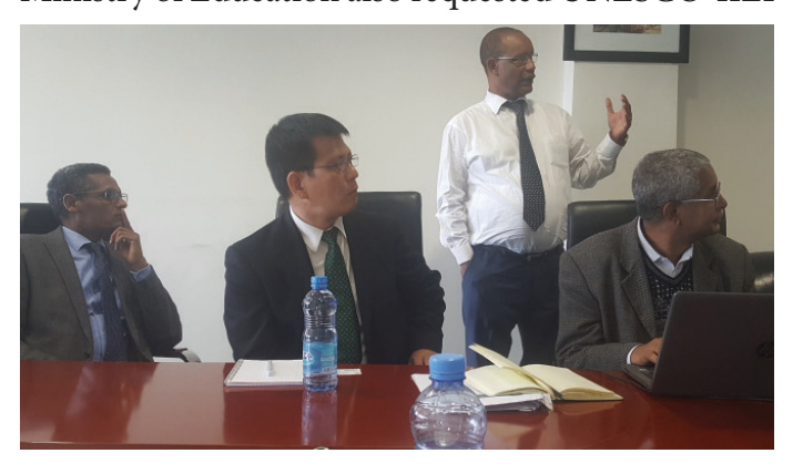
H.E. Dr. Tilaye Gete, Minister for Ministry of Education

UNESCO was asked by the Government of Ethiopia to provide technical support to finalize the Education and Training Roadmap. A UNESCO technical assistance team was established, consisting, two HQ units, UIL, UNESCO Liaison Office in Addis Ababa and IICBA with the leadership of IIEP. The technical team had joint scoping mission from 30 June to 6 July 2019 and a one-week writing workshop held from August 5-11, 2019 to finalize the Roadmap. At the moment, the Roadmap is ready for approval by the national authority. Concurrently, the Federal Ministry of Education also requested UNESCO-IIEP