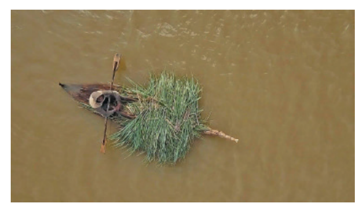
Young man in his Papyrus Tankwa after cutting fodder for his cattle being filmed by the UNESCO Film Crew on Lake Tana, November 2017.