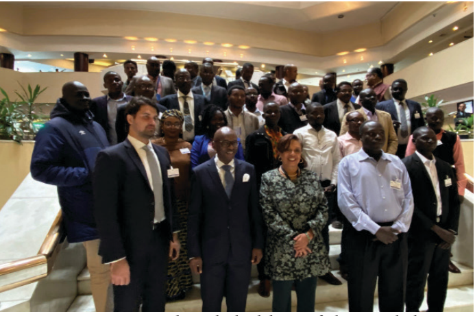
Participants and Stakeholders of the workshop