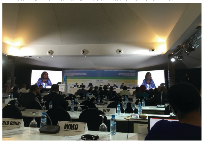
The Scene of the 20th session of the Regional Coordination Mechanism for Africa (RCM)

the African Union and its organs in the context of African Union and United Nations reforms.