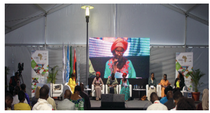
Women's Forum Session at the Luanda Biennale for a Culture of Peace

on the State of Peace and Security in Africa with the Institute of Peace and Security Studies of the Addis Ababa University, reflecting on the challenges and solutions African societies have faced in establishing non-violence across the continent. Lastly, the Office facilitated the participation of over 35 youths coming from all over the continent, as well as the attendance of representatives from Femwise. This was generously supported by Ethiopian Airlines, who offered a 20% discount on their tickets for participants of the Biennale, as well as provided free tickets to 15 participants. UNESCO is looking forward to organizing the next Biennale in 2021 an equally successful event for all partners and participants.