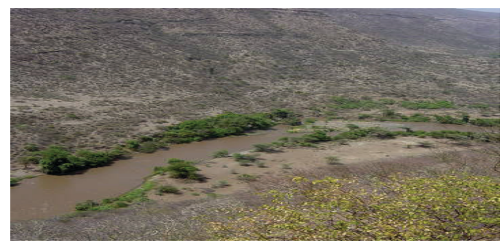
Lower Valley of the Awash in Ethiopia

The Ethiopian Wildlife Conservation Authority (EWCA), in collaboration with UNESCO Liaison Office and the UNESCO Regional Office for Eastern Africa, organized a workshop, led by Mr. Koen Meyers, UNESCO Consultant, that aimed at strengthening national capacities for preparing World Heritage nomination dossiers for natural heritage sites in September 2019 in Ethiopia. The country was one of the first signatories to the UNESCO 1972 Convention concerning the Protection of the World Cultural and Natural Heritage, and boasts two of the first dozen sites inscribed on the prestigious UNESCO World Heritage List in 1978, namely the 'Rock-Hewn Churches, Lalibela' and 'Simien National Park'.