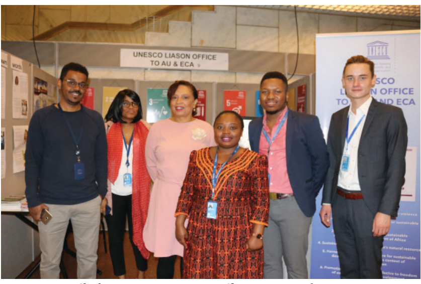
Staff of UNESCO Liaison Office to AU and UNECA

Besides the chance to network with the UN as a potential employer and informing themselves about the work of different UN agencies, the young participants could practice their interview and application skills by attending mock-interviews. Two representatives from UNESCO Addis Ababa Office supported these efforts and were very happy to offer participants tips for future interviews.