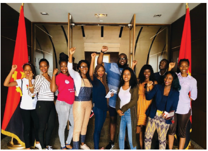
Youth participants at the Luanda Biennale

To celebrate the diversity, whilst calling for strength by finding unity in shared heritage, the UNESCO Liaison Office created a mobile exhibition on African World Heritage Sites and Intangible Heritages. The Office also organized a side-event