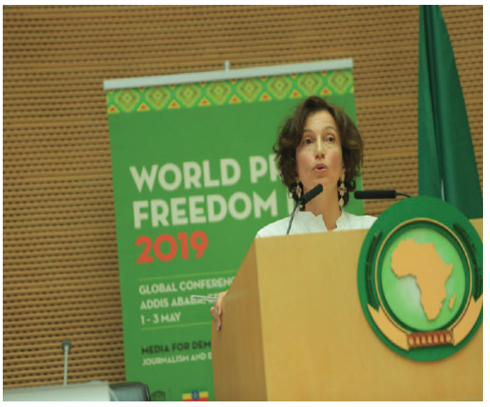
Ms. Audrey Azoulay at the World Press Freedom Day Conference in Addis Ababa