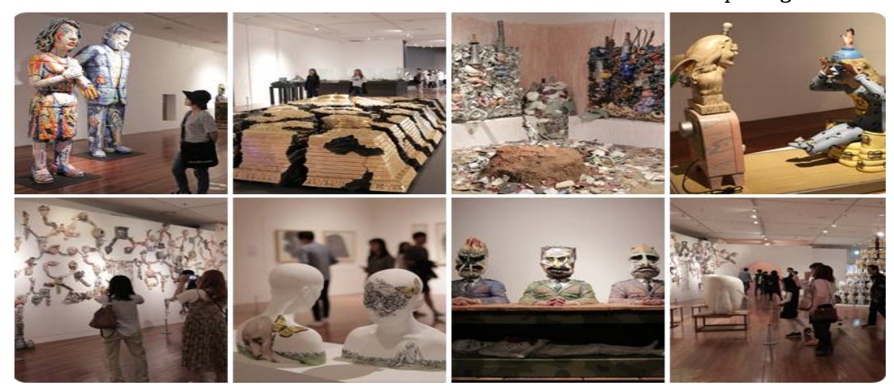
** Explanation: It is comprised of approximately 90 pieces of artwork by six foreign artists of the 20<sup>th</sup> century who have opened up the door to narrative ceramics with an innovative consciousness and behavior, and around twenty foreign and domestic artists who have worked actively in 2000s. The exhibits that reflect the life of contemporaries through colorful narrative expressions offered an opportunity to newly experience various stories of life as well as think about the life of modern people who are existential and social beings.