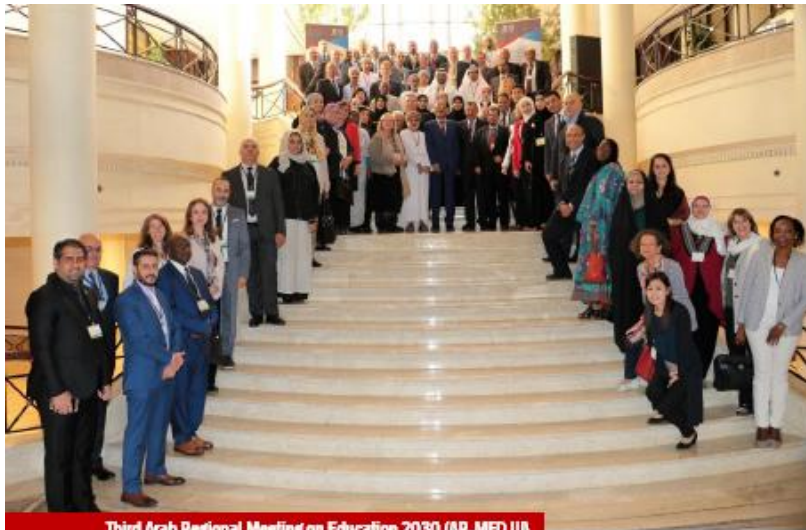
Third Arab Regional Meeting on Education 2030 (AR-MED III)

Aligning Curriculum, Teachers and Learning Assessment to Reach SDG4 Targets in Arab Countries