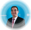
Justin Yifu Lin