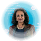
H. E. Ms Sahle-Work Zewde Chair, International Commission