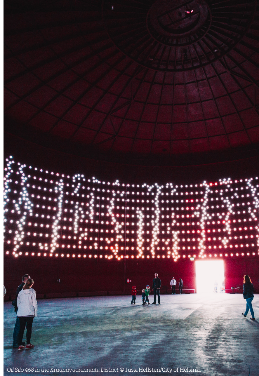
Oil Silo 468 in the Kruunuvuorenranta District