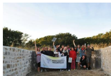
© UNESCO Tentative List since 2002

Louis XIV created Rochefort arsenal in 1666 after the advice of Jean-Baptiste Colbert to endow the Atlantic façade of France with a safe maritime base. Housing prestigious monuments such as the royal rope factory (designed by Blondel) and dry docks, the arsenal is situated 24km from the coastline, following the course of the Charente River in order to be protected from invasion. The city of Rochefort was built on a grid pattern plan close to the arsenal and in time was surrounded by its own wall which was finished in 1690. The defense of the arsenal was assured by the fortification of Pertuis, in particular the 'l'île d'Aix', which was the only defense of the natural harbour. The estuary of the Charente encompasses a collection of forts that had pre-existed, or been built or planned around the same time as the arsenal for its own defense.