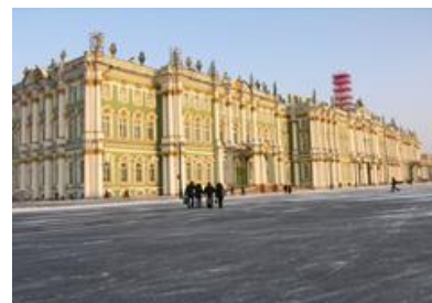
Cultural site inscribed in 1997

The 'Venice of the North', with its numerous canals and more than 400 bridges, is the result of a vast urban project begun in 1703 under Peter the Great. Later known as Leningrad (in the former USSR), the city is closely associated with the October Revolution. Its architectural heritage reconciles the very different Baroque and pure neoclassical styles, as can be seen in the Admiralty, the Winter Palace, the Marble Palace and the Hermitage.