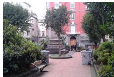
© UNESCO Cultural site inscribed in 1995

Naples is one of the most ancient cities in Europe, whose contemporary urban fabric preserves the elements of its long and eventful history. Its street pattern, its wealth of historic buildings from many periods, and its setting on the Bay of Naples give it an outstanding universal value without parallel, and one that has had a profound influence in many parts of Europe and beyond. Much of the significance of Naples is due to its urban fabric, which represents twenty-five centuries of growth.