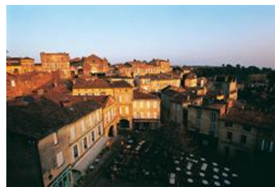
Cultural site inscribed in 1999

Viticulture was introduced to this fertile region of Aquitaine by the Romans, and intensified in the Middle Ages. The Saint-Emilion area benefited from its location on the pilgrimage route to Santiago de Compostela and many churches, monasteries and hospices were built there from the 11th century onwards. It was granted the special status of a 'jurisdiction' during the period of English rule in the 12th century. It is an exceptional landscape devoted entirely to wine-growing, with many fine historic monuments in its towns and villages.