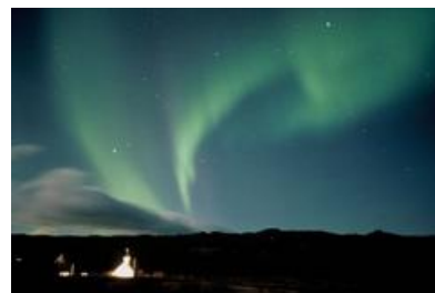
Cultural site inscribed in 2004

Þingvellir (Thingvellir) is the National Park where the Althing, an open-air assembly representing the whole of Iceland, was established in 930 and continued to meet until 1798. Over two weeks a year, the assembly set laws - seen as a covenant between free men - and settled disputes. The Althing has deep historical and symbolic associations for the people of Iceland. The property includes the Þingvellir National Park and the remains of the Althing itself: fragments of around 50 booths built from turf and stone. Remains from the 10th century are thought to be buried underground. The site also includes remains of agricultural use from the 18th and 19th centuries. The park shows evidence of the way the landscape was husbanded over 1,000 years.