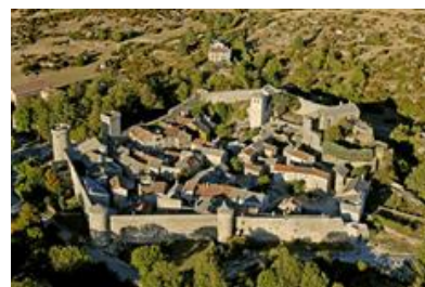
Cultural site inscribed in 2011

This 302,319 ha property, in the southern part of central France, is a mountain landscape interspersed by deep valleys that is representative of the relationship between agro-pastoral systems and their biophysical environment, notably through drailles or drove roads. Villages and substantial stone farmhouses on deep terraces of the Causses reflect the organization of large abbeys from the 11th century. Mont Lozère, inside the property, is one of the last places where summer transhumance is still practiced in the traditional way, using the drailles.