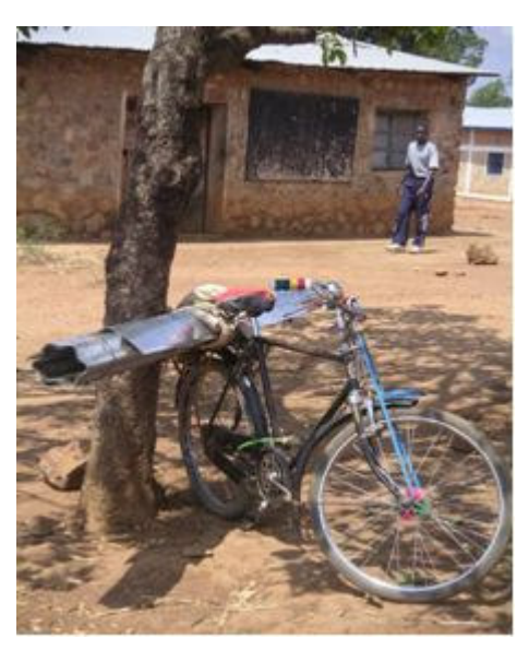
Transportation of corrugated iron sheet distributed to returnees (Burundi)

<sup>18</sup> In a patrilocal society, when a woman marries a man, she leaves her own family to join her new husband in his home or compound, near his relatives.