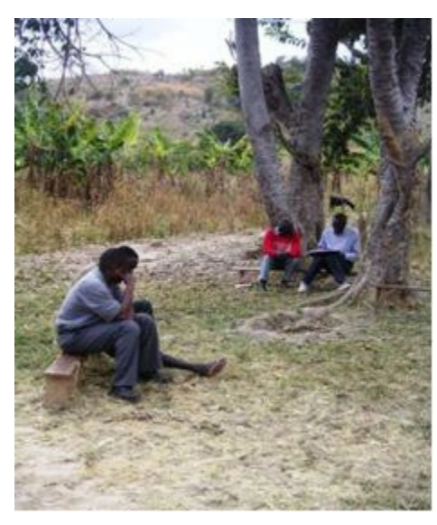
ACCORD workers talking to farmers in a dispute over land ownership (Burundi)

solidarity in case of hardship is largely based on family ties. As a consequence, the weakening of bonds of trust and the growth of resentment between relatives contributes to disaffiliating some individuals and dismantling the social fabric.