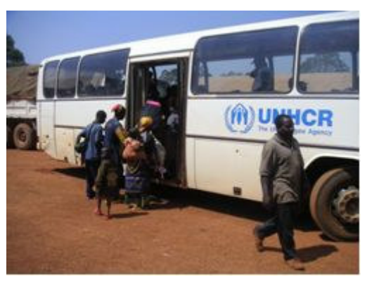
Day of departure to Burundi in Kanembwa camp

In collaboration with its operational field partners (NGOs, local associations) and other UN agencies, UNHCR provides assistance for the return to Burundi. Repatriation programs include the dissemination of information on the political and economic context in Burundi, the registration of voluntary returnees, the transportation of refugees, personal effects and livestock when possible, and the distribution of return packages. In Burundi, implementing partners and UN agencies to ensure the transition from humanitarian to development assistance, taking in charge shelter and infrastructure rehabilitation. legal assistance psychological support and helping for the development of self-reliance projects. The government of Burundi officially declared that it would be committed to a large-scale resettlement and reintegration program for returnees. UNHCR monitoring programs implemented in areas of return provide data on the status of returnees and the community they live in to identify returnees' needs for general assistance and support of their basic human rights.