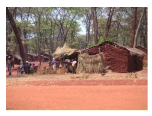
Traditional Burundian fences in Kanembwa camp

Kanembwa was the oldest camp in Kibondo. It was located 20 km from Kibondo town. In June 2006, it accommodated 14,323 refugees among the total 68,416 refugees of Kibondo. The refugee population of the camp mainly came from the northeastern and central provinces of Ruyigi, Cankuzo and Gitega in Burundi. Children under the age of 17 made up about 57% of the total population of the camps, with 22% being less than five years old. As in any refugee camp, the Tanzanian Ministry of Home Affairs (MHA) was in charge of the security and control of entries and exits<sup>8</sup>.