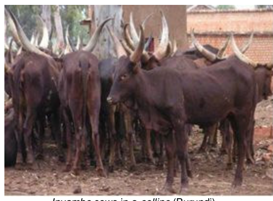
Inyambo cows in a colline (Burundi)