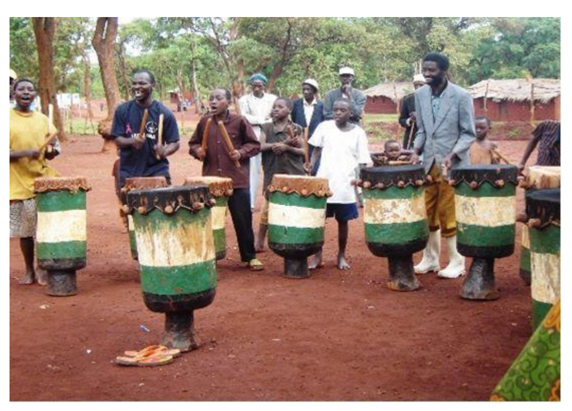
Drum performance in Kanembwa refugee camp, Tanzania, at the beginning of a story-telling session