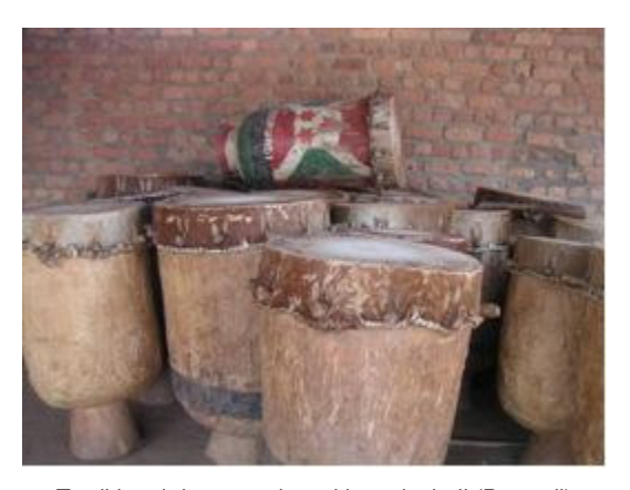
Traditional drums gathered in a city hall (Burundi)

structures. They are mainly active at the time of the celebration of international days, the most recent ones being the African Children Day (20 May) and the Refugee Day (30 June), or to start sessions about Sexually Transmitted Diseases and Peace and Conflict Reconciliation Programs.