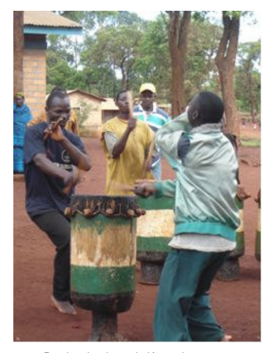
Beating the drums in Kanembwa camp

The fostering of a Hutu consciousness in refugee camps and, as a consequence, of an incommensurable Hutu-Tutsi divide obviously sustains fears and suspicion between these two "ethnic" groups. The IDPs issue and the difficult reintegration of ex-combatants might give rise to renewed ethnic clashes if they are not adequately addressed. Moreover, the reintegration of returnees in Burundi is conditioned by the production of a renewed consciousness of national unity that years of exile have participated to weaken. If such a production of identity rests largely in the hands of Burundian refugees, the implementation of appropriate cultural activities can contribute to promoting unity and raise questions about the current ethno-political situation in Burundi among refugees.