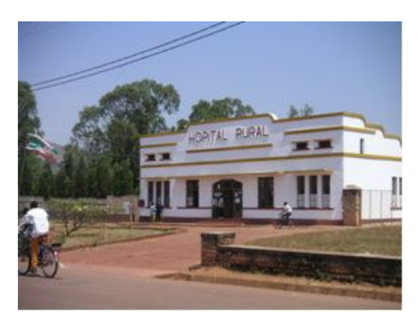
Ruyigi hospital, renovated with the help of the association Maison Shalom (Burundi)

A similar issue has emerged regarding ex-combatants of the rebel forces. An ongoing research program on former female forced combatants implemented by a local association in Ruyigi called Maison Shalom has shown that some of these women are not welcomed by the local population. Together with male ex-combatants, they are surrounded by suspicion. The fact that some of them are still in possession of firearms, alongside with their participation in specific programs designed to provide them with assistance or to collect their memories of the genocide, brings about feelings of fear, jealousy and animosity.