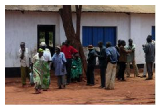
Story-tellers gathered together at the Youth Centre in Kanembwa camp

traditional performances, the risk is high to reduce Burundian culture to a couple of selected folkloric items<sup>25</sup> and disconnect it from its historical, socio-political and religious background. The question here is not to refute the desirability of the promotion of fundamental human rights but to highlight the fact that Burundian living cultural heritage should not be transformed into a set of folkloric tools that would no longer bear any connection to social norms, values and knowledge embedded in the specific history of Burundi and present concerns of its people.