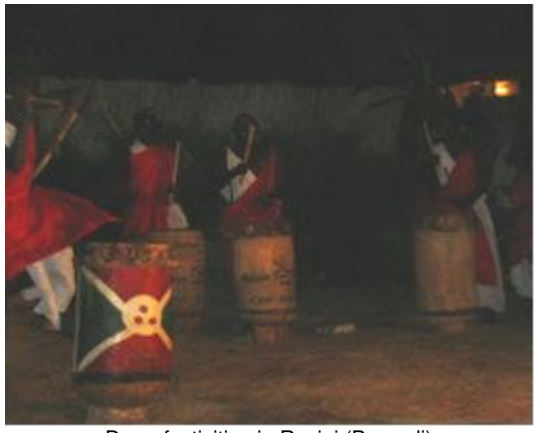
Drum festivities in Ruyigi (Burundi)

It is evident that the preservation of the national language in refugee camps, the reproduction of traditional and religious beliefs as well as the maintenance of social norms and values regarding solidarity and mutual aid contribute to facilitating the reintegration of returnees in Burundi.