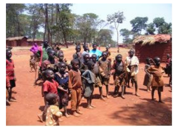
Children in Kibondo refuge camps: main targets of UNESCO activities

new cultural representations and to assistance-driven behaviours that did not exist in Burundi. Children, teenagers and young adults who have spent a large part of their life in refugee camps are particularly concerned with the issue of alteration of cultural knowledge.