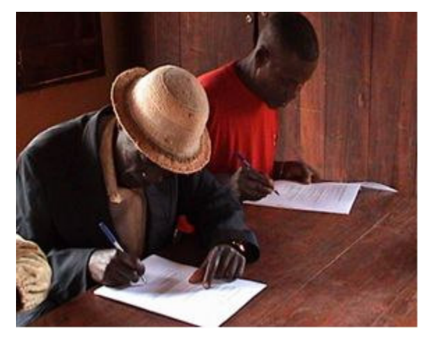
Elders filling up their questionnaires in Kanembwa

It was mentioned that many inhabitants in Burundi, living in regions covered by Radio Kwizera, followed UNESCO storytelling activities on the radio. Apart from appreciating stories and tales as a form of entertainment, it seems that Burundians highly appreciated the fact that refugee populations had striven to preserve their culture and tradition in the camps. Because the broadcasting of activities show that refugees have not turned into mere foreigners, but have continued transmitting their traditional cultural knowledge despite of their harsh conditions of life, it can be more easily considered that, in post-conflict Burundi, peaceful social relations between refugees, returnees and inhabitants, based on a common culture, can be built after the repatriation of all refugees to Burundi.