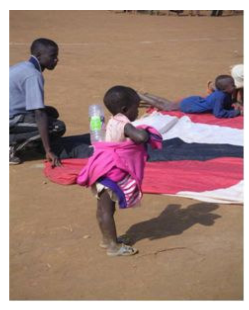
A little girl tying up a bottle of water on her back as if it were a baby, Mkugwa refugee camp

<sup>11</sup> Three women accused of witchcraft were killed in Kanembwa camp over the last two years by strangulation or fire.