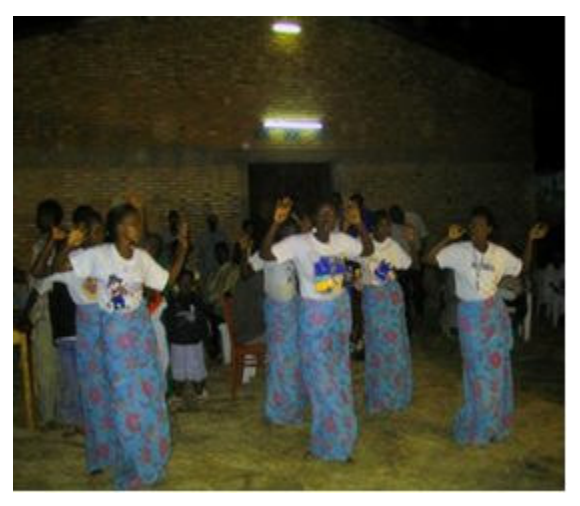
Traditional female singing and dances (Burundi)

while they are in exile. For refuges, perpetuating such traditional cultural skills is considered a way of keeping ties with Burundi. Yet, cultural activities implemented by refugees have been partly reduced due to both repatriation programs and budget cuts (UNHCR 2005). Voluntary repatriation has led to the departure of many refugees, some of them who had been active participants in these cultural activities. The general atmosphere created by prospects of return has reduced refugee commitment in previously well-attended activities (SAEU 2005). As for budget cuts, they have contributed to the reorganization of the planning of activities and the concentration on programs regarded as vital for refugees: protection of Vulnerable People, HIV/AIDS campaigns or Peace and Conflict Resolution Programs.