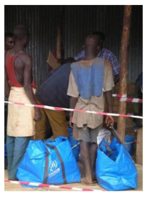
Distribution of return packages a Nyabitare transit centre (Burundi)

UNHCR Kibondo is in charge of the first steps of refugee facilitated repatriation which include, as stated previously, dissemination of information on the political and economic context in Burundi, registration of voluntary returnees, transportation of refugees as well as their personal effects and the livestock. When they reach the Burundian-Tanzanian border at Mabamba exit point, refugees are put under the responsibility of UNHCR Ruyigi. This UNHCR Field Office is in charge of the refugees from Kibondo camps repatriating to the northern and eastern regions of Burundi. Repatriation buses and lorries stop at Nyabitare transit centre in Burundi. The identity of refugees is checked by UNHCR repatriation staff. The Burundian Ministry of Home Affairs delivers identity cards to refugees whose identity papers are in order. Refugees then obtain their return package. Lorries are unloaded and reloaded according to refugees' destination. Refugees living in Nyabitare commune and in surrounding areas set out for their home the same day while refugees living in distant collines spend the night at Ruyigi town to be repatriated to the nearest commune the next day (UNHCR 2005c).