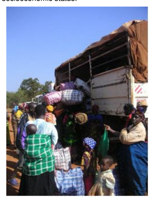
Day of departure to Burundi at Kanembwa camp