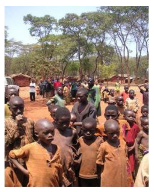
Children gathered at Mtendeli refugee camp

My final thanks go to all refugees and returnees for their willingness to respond to my questions and to share their life experience.