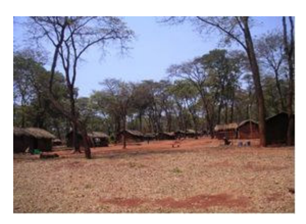
House planning in Kibondo refugee camps

political landscape. Past traumatic experiences that resulted from 1993-94 genocide have led some refugees to reject their culture. Described as a country of violence and ethnic divisions. Burundi has become tantamount to shame generalized insecurity. Many refugees do not want to repatriate to a country they do not consider as being theirs anymore. The trauma of a nation-wide genocide has led some refugees to reject their past and tradition, considered as a culture of divisions and violence. As shown previously, this explains why refugees do not address the genocide of 1993 and avoid considering the existence of an ethnic divide in general, thus contributing to the disappearance of an oral tradition which illuminates the historical unity of the country and the solidarity within the whole population.