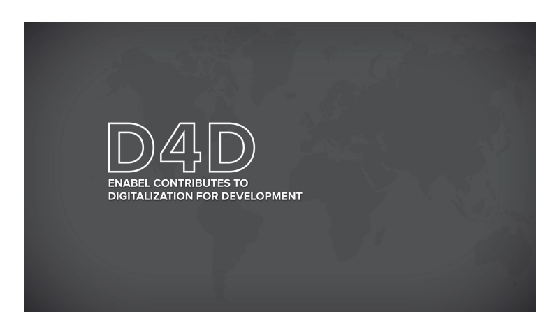
Video: Digitalization for Development as a leverage for TTE

Internationally celebrated on 5th October, Teachers' Day aims to focus on appreciating, understanding and improving the practices of educators around the world and to provide an opportunity to consider issues related to teachers and teaching. This year was special, as it was the first time for the National Teachers' Colleges to celebrate the efforts of teachers online. On 8th October 2020, our focus was on the innovations and initiatives brought forward by NTC lecturers as they embraced new digital tools in order to support distance teaching and learning. This event was attended by many different and important stakeholders from Belgium, the Ministry of Education and Sports, NTC Education staff and students, Development Partners, medias, etc. This report summarizes the different celebrations that were targeted that day.