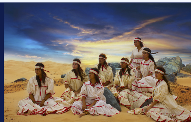
Naramuri in the desert, Mexico