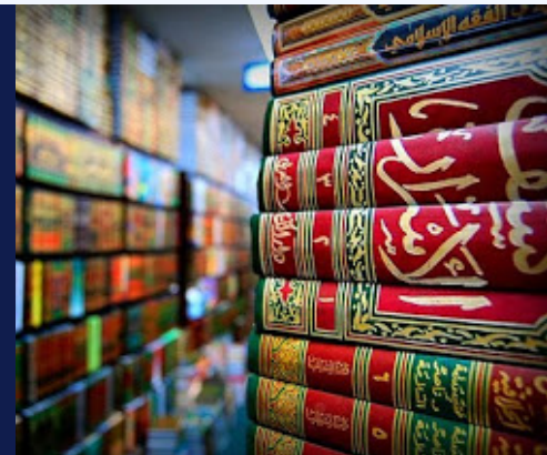
Arabic Books in Amsterdam

Sheikha Bodour bint Sultan Al Qasimi, founder and president of the Emirates Publishers Association, EPA