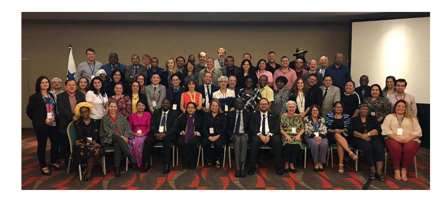
UNESCO: Memory of the World Inter Regional Conference, Panama City, 2018

The Inter-Regional Conference on Preservation and Accessibility of Documentary Heritage, organized by UNESCO in the Holiday Inn Hotel Panama City, from 24 to 27 October 2018, brought together participants from 46 countries. Among them were representatives from the MoW International Advisory Committee, members from diverse National Committees around the globe, and members of the Regional Committee for Latin America and the Caribbean (MOWLAC), the African Regional Committee for Memory of the World (ARCMOW), and the Memory of the World Committee for Asia/Pacific (MOWCAP).