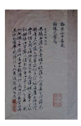
3: Taixi renshen shuogai , 1643 – End of the table of contents and beginning of the first chapter dealing with bones.

The Macau project will concentrate on the Taixi renshen shuogai 泰西人身說概 (An Outline of the Human Body from the Occident).