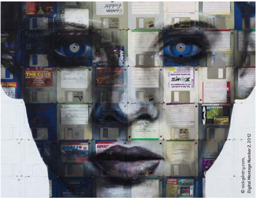
© nickgentry.com. Digital Montage Number 2, 2012