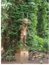
Ouidah May 2010 (17)