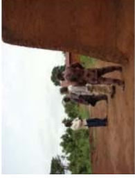
Abomey May 2010 (73)