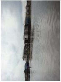
Ganvie May 2010 (25)