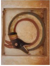
Abomey May 2010 (150)