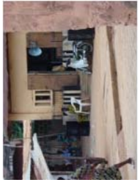
Porto Novo May 2010 (29)