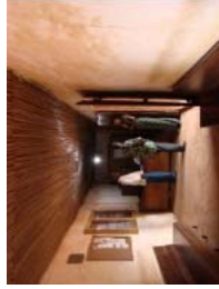
Abomey May 2010 (181)