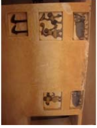
Abomey May 2010 (141)