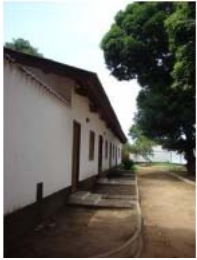
Ouidah May 2010