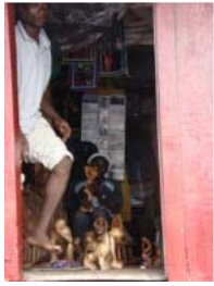
Ganvie May 2010 (31)