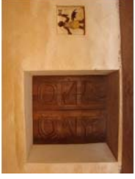
Abomey May 2010 (142)