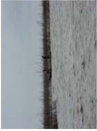
Ouidah May 2010 (81)