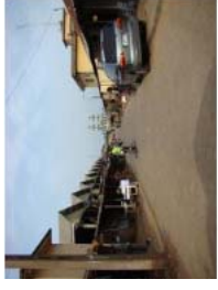
Porto Novo May 2010 (32)