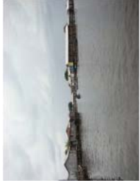
Ganvie May 2010 (42)