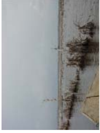
Ganvie May 2010 (47)