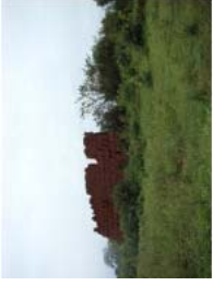
Abomey May 2010 (86)