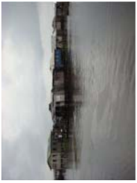
Ganvie May 2010 (16)