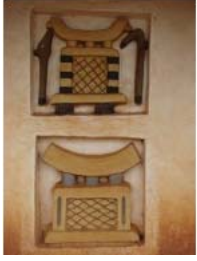
Abomey May 2010 (38)