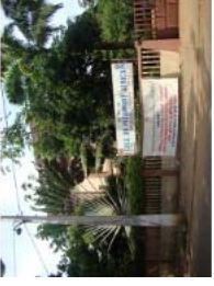
Ouidah May 2010 (78)