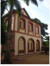
Porto Novo May 2010 (16)