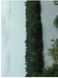
Ouidah May 2010 (35)