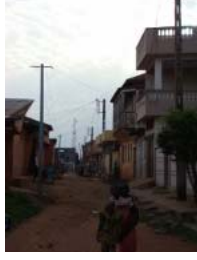
Porto Novo May 2010 (3)