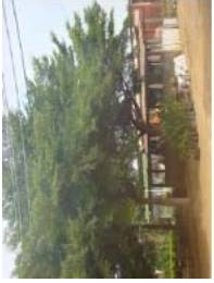
Abomey May 2010 (61)