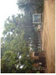
Abomey May 2010 (62)