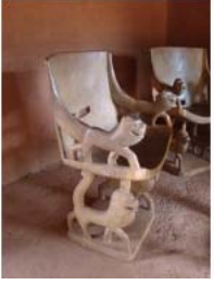
Abomey May 2010 (22)