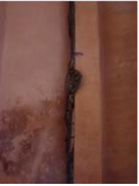
Ouidah May 2010 (65)