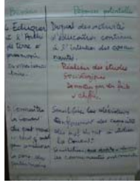
EPA May 2010 (8)