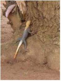
Abomey May 2010 (20)