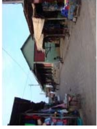
Porto Novo May 2010 (31)