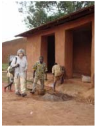
Abomey May 2010 (51)