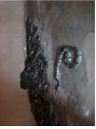
Ouidah May 2010 (66)