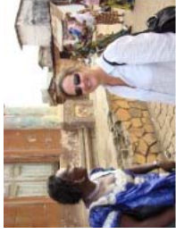
Porto Novo May 2010 (21)