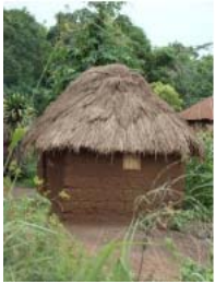
Abomey May 2010 (60)