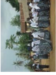
Ouidah May 2010 (54)