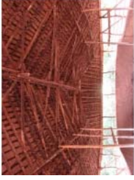
Abomey May 2010 (71)