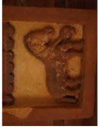
Abomey May 2010 (158)