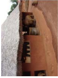
Abomey May 2010 (113)