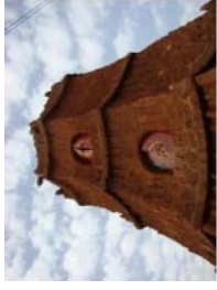
Porto Novo May 2010 (57)