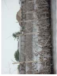
Ganvie May 2010 (7)