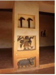
Abomey May 2010 (30)