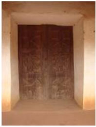
Abomey May 2010 (36)