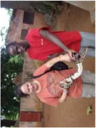
Ouidah May 2010 (60)