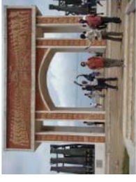
Ouidah May 2010 (44)