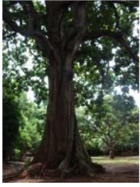
Ouidah May 2010 (4)