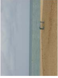
Ouidah May 2010 (57)