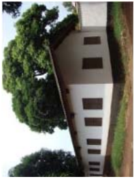
Ouidah May 2010 (1)