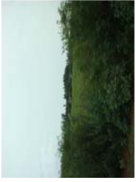
Ouidah May 2010 (34)