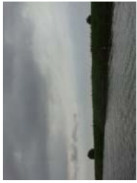
Ganvie May 2010 (1)