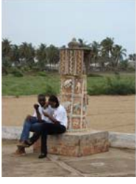
Ouidah May 2010 (43)