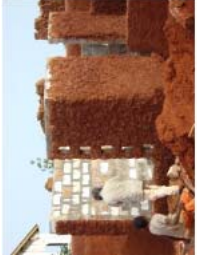
Porto Novo May 2010 (52)