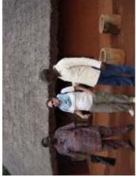
Abomey May 2010 (102)