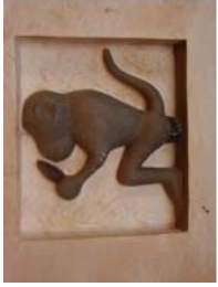
Abomey May 2010 (126)