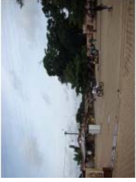
Ouidah May 2010 (72)