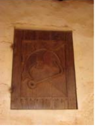
Abomey May 2010 (33)