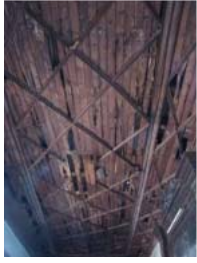
Porto Novo May 2010 (20)