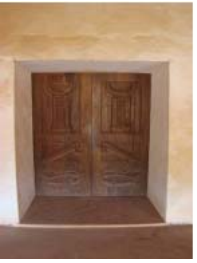
Abomey May 2010 (31)