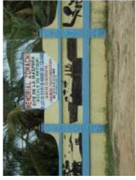
Ouidah May 2010 (24)