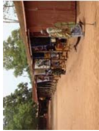
Abomey May 2010 (179)