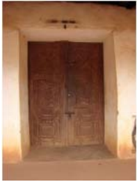
Abomey May 2010 (35)