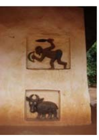
Abomey May 2010 (34)