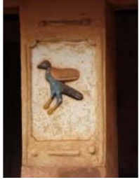
Abomey May 2010 (59)