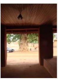
Abomey May 2010 (14)