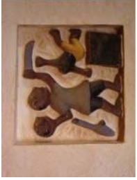
Abomey May 2010 (131)