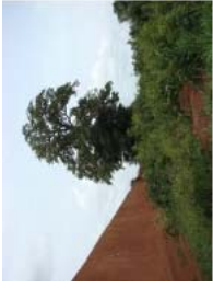
Abomey May 2010 (75)