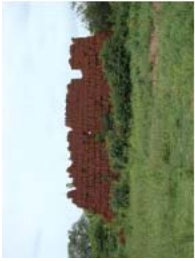
Abomey May 2010 (79)