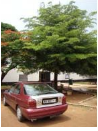
Ganvie May 2010 (53)