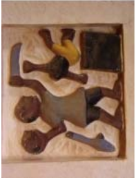
Abomey May 2010 (133)