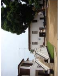
Ouidah May 2010 (2)