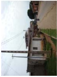
Porto Novo May 2010 (55)