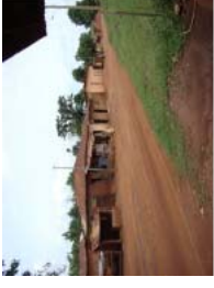
Abomey May 2010 (78)