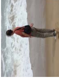
Ouidah May 2010 (38)