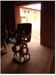
Abomey May 2010 (21)