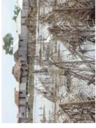
Ganvie May 2010 (49)