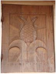
Abomey May 2010 (40)