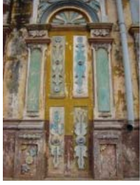
Porto Novo May 2010 (7)