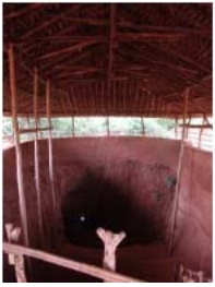
Abomey May 2010 (6)