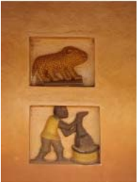
Abomey May 2010 (25)