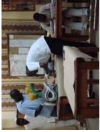
EPA May 2010 (1)