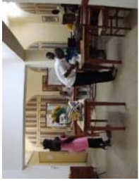
EPA May 2010 (3)