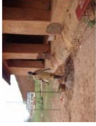
Abomey May 2010 (178)