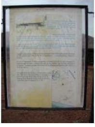
Abomey May 2010 (8)