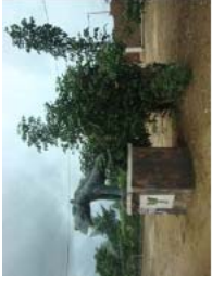
Ouidah May 2010 (52)