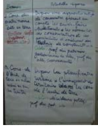
EPA May 2010 (9)