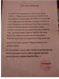
Abomey May 2010 (65)