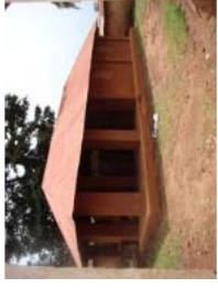
Abomey May 2010 (157)