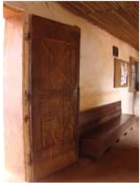
Abomey May 2010 (55)