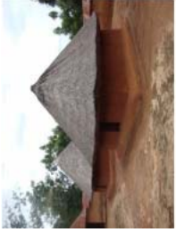
Abomey May 2010 (106)