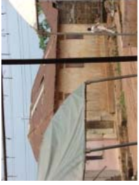
Ganvie May 2010 (52)