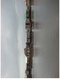
Ganvie May 2010 (17)