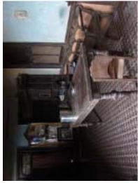
Porto Novo May 2010 (19)