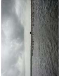
Ganvie May 2010 (9)