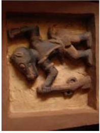
Abomey May 2010 (160)