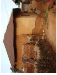
Porto Novo May 2010 (41)