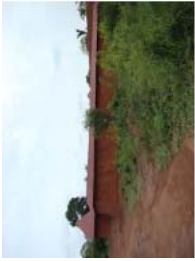
Abomey May 2010 (74)