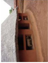
Abomey May 2010 (111)