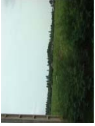
Ouidah May 2010 (33)