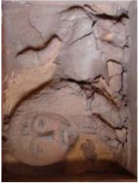
Abomey May 2010 (165)