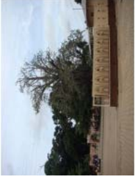
Ouidah May 2010 (73)