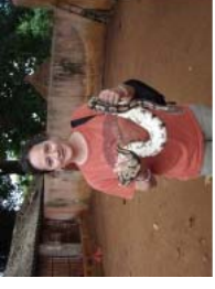
Ouidah May 2010 (69)