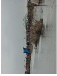
Ganvie May 2010 (12)