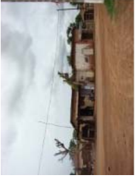
Abomey May 2010 (92)