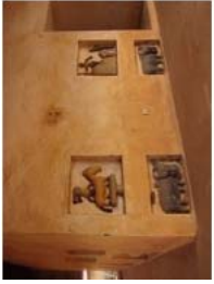
Abomey May 2010 (140)