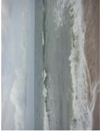
Ouidah May 2010 (42)