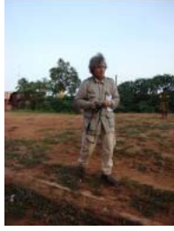
Porto Novo May 2010 (2)