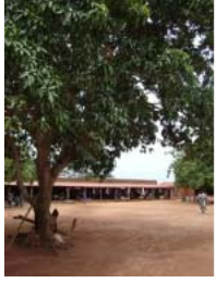
Abomey May 2010 (54)