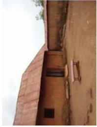
Abomey May 2010 (154)