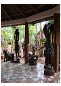
Abomey May 2010 (9)