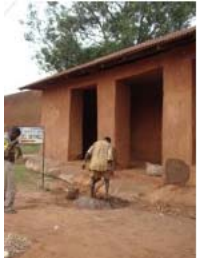
Abomey May 2010 (50)