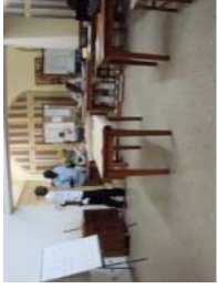
EPA May 2010 (2)