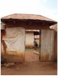
Abomey May 2010 (43)