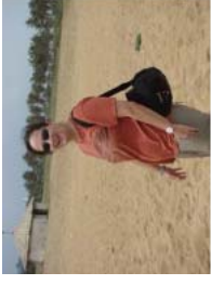
Ouidah May 2010 (48)