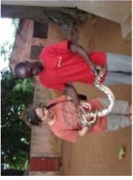
Ouidah May 2010 (61)