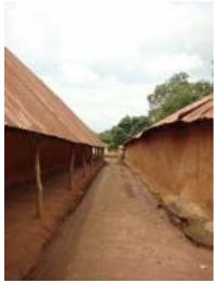
Abomey May 2010 (45)