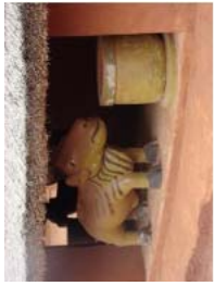
Abomey May 2010 (115)