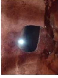
Abomey May 2010 (68)