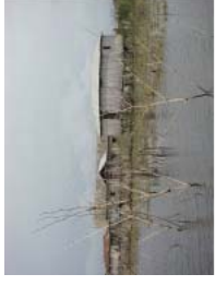
Ganvie May 2010 (39)