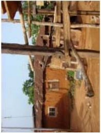
Porto Novo May 2010 (49)