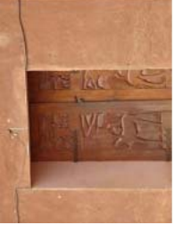
Abomey May 2010 (98)