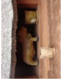
Abomey May 2010 (116)