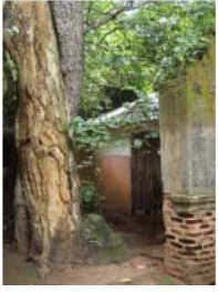
Ouidah May 2010 (9)