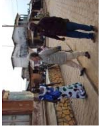
Porto Novo May 2010 (23)