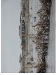
Ganvie May 2010 (13)