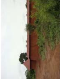
Abomey May 2010 (76)