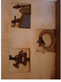
Abomey May 2010 (137)