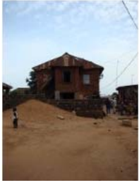
Porto Novo May 2010 (10)