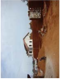
Porto Novo May 2010 (53)