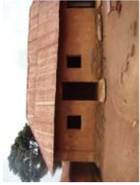
Abomey May 2010 (155)