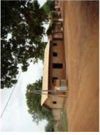
Abomey May 2010 (90)