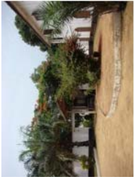
Ganvie May 2010 (50)