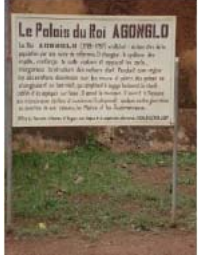
Abomey May 2010 (58)