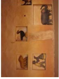
Abomey May 2010 (138)