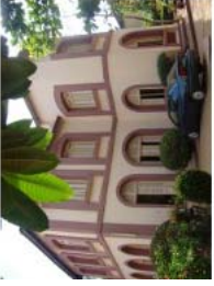
Ouidah May 2010 (77)