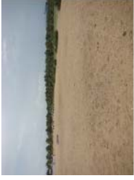
Ouidah May 2010 (47)