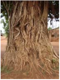
Abomey May 2010 (15)