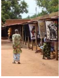
Abomey May 2010 (53)