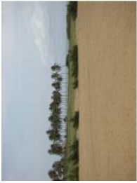
Ouidah May 2010 (45)