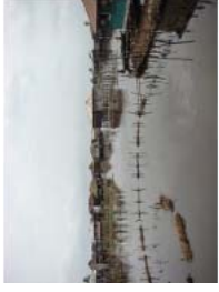
Ganvie May 2010 (23)