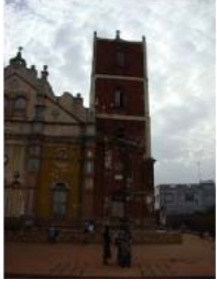
Porto Novo May 2010 (12)