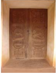
Abomey May 2010 (37)