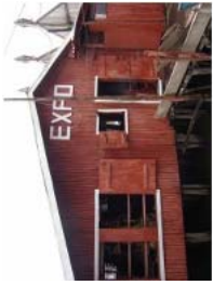
Ganvie May 2010 (21)