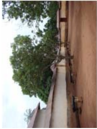
EPA May 2010 (6)