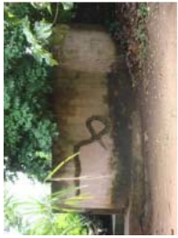
Ouidah May 2010 (16)