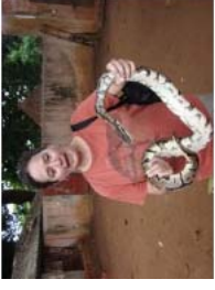
Ouidah May 2010 (58)