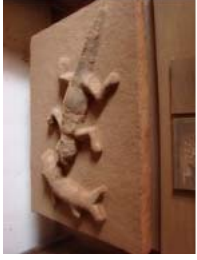
Abomey May 2010 (163)