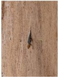
Abomey May 2010 (120)