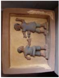
Abomey May 2010 (170)