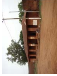
Abomey May 2010 (187)