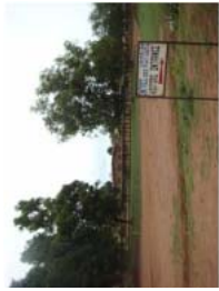
Abomey May 2010 (175)