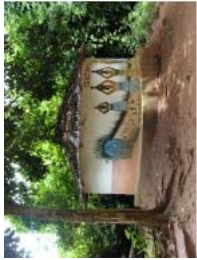
Ouidah May 2010 (10)