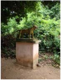
Ouidah May 2010 (5)