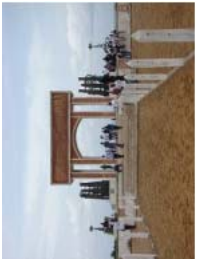
Ouidah May 2010 (31)