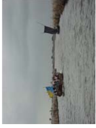
Ganvie May 2010 (8)