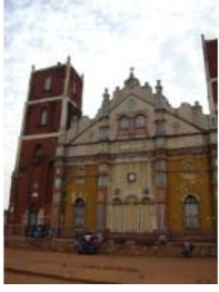
Porto Novo May 2010 (11)