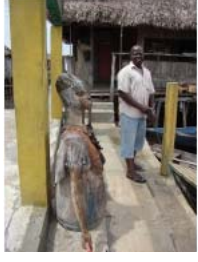
Ganvie May 2010 (44)