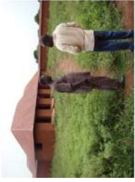
Abomey May 2010 (85)