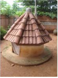
Ouidah May 2010 (76)