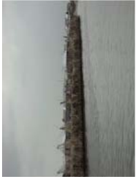
Ganvie May 2010 (14)