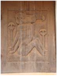
Abomey May 2010 (41)