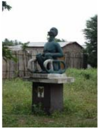
Ouidah May 2010 (21)