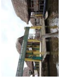
Ganvie May 2010 (43)