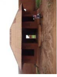
Abomey May 2010 (87)