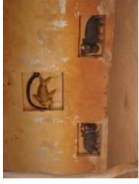
Abomey May 2010 (152)