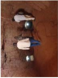
Abomey May 2010 (69)