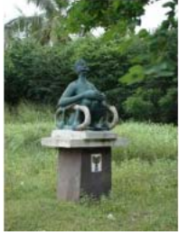
Ouidah May 2010 (22)