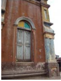
Porto Novo May 2010 (6)