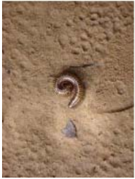
Ouidah May 2010 (25)