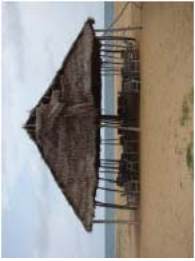
Ouidah May 2010 (55)