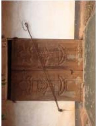
Abomey May 2010 (99)