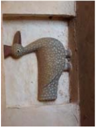
Abomey May 2010 (129)