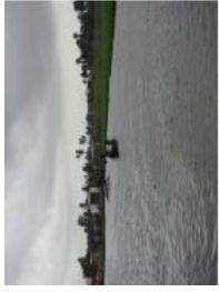
Ganvie May 2010 (4)