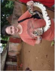
Ouidah May 2010 (59)