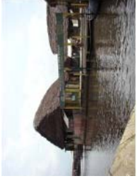
Ganvie May 2010 (29)