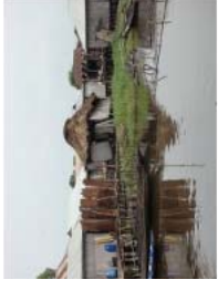
Ganvie May 2010 (24)