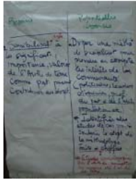
EPA May 2010 (10)