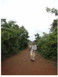
Abomey May 2010 (2)