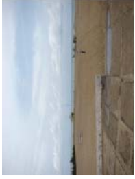
Ouidah May 2010 (28)