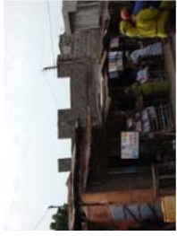
Porto Novo May 2010 (30)