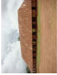
Abomey May 2010 (148)