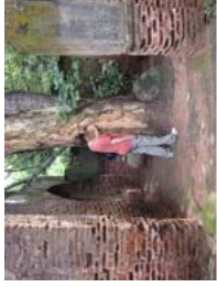
Ouidah May 2010 (13)