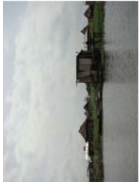
Ganvie May 2010 (35)