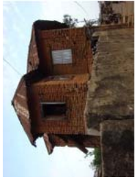
Porto Novo May 2010 (24)