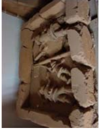
Abomey May 2010 (172)