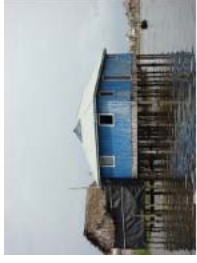
Ganvie May 2010 (38)