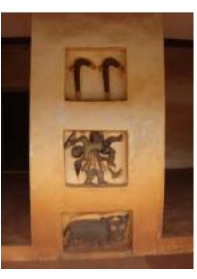
Abomey May 2010 (29)