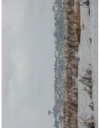
Ganvie May 2010 (48)