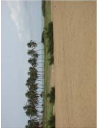
Ouidah May 2010 (46)