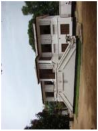
Ouidah May 2010 (6)