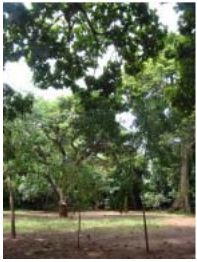
Ouidah May 2010 (26)