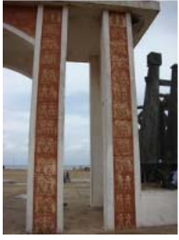
Ouidah May 2010 (29)