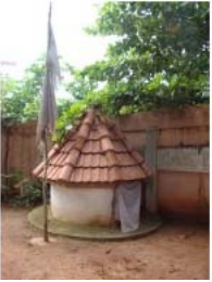
Ouidah May 2010 (75)