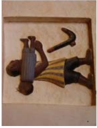
Abomey May 2010 (135)