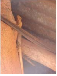
Abomey May 2010 (23)