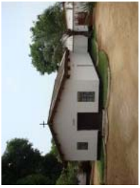
Ganvie May 2010 (51)