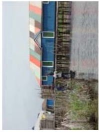
Ganvie May 2010 (41)