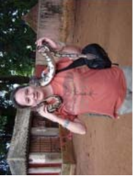
Ouidah May 2010 (67)