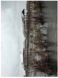
Ganvie May 2010 (11)