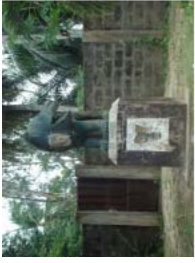
Ouidah May 2010 (51)