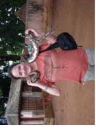
Ouidah May 2010 (68)