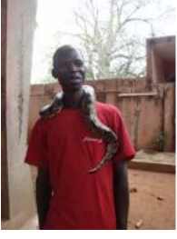
Ouidah May 2010 (63)