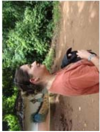
Ouidah May 2010 (20)