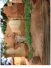
Porto Novo May 2010 (43)