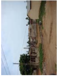
Ganvie May 2010