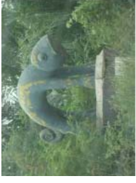
Ouidah May 2010 (53)