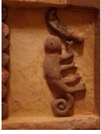
Abomey May 2010 (162)