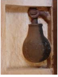
Abomey May 2010 (132)