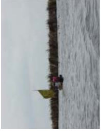
Ganvie May 2010 (54)