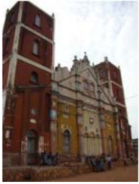
Porto Novo May 2010 (9)