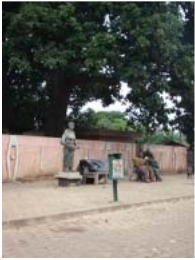
Ouidah May 2010 (80)