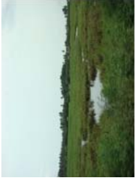
Ouidah May 2010 (32)