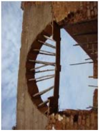
Porto Novo May 2010 (50)