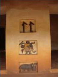
Abomey May 2010 (27)