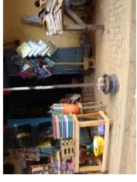
Porto Novo May 2010 (33)