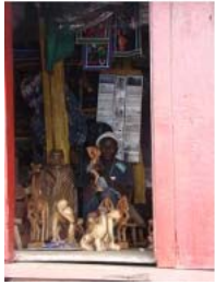
Ganvie May 2010 (30)