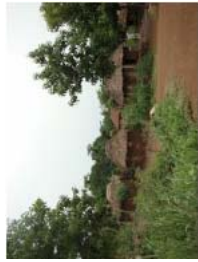
Abomey May 2010 (190)