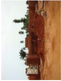
Porto Novo May 2010 (54)