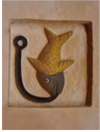
Abomey May 2010 (145)