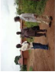
Abomey May 2010 (72)