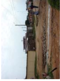
Porto Novo May 2010 (56)