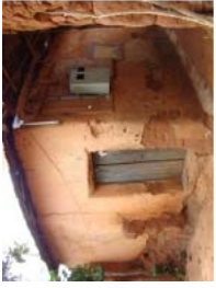
Porto Novo May 2010 (40)