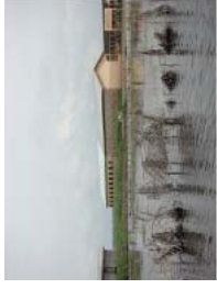
Ganvie May 2010 (33)