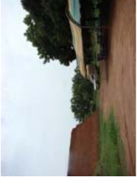
Abomey May 2010 (93)