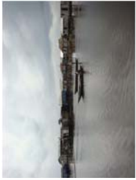
Ganvie May 2010 (20)