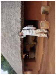
Abomey May 2010 (105)