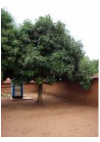
Abomey May 2010 (19)