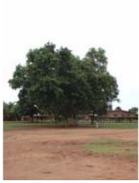
Abomey May 2010 (57)