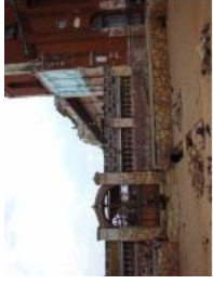
Porto Novo May 2010 (26)