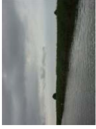
Ganvie May 2010 (3)