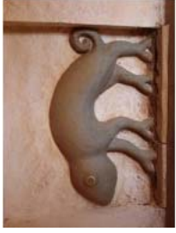
Abomey May 2010 (136)