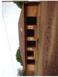
Abomey May 2010 (185)