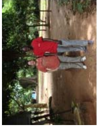
Ouidah May 2010 (18)