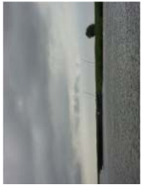
Ganvie May 2010 (6)