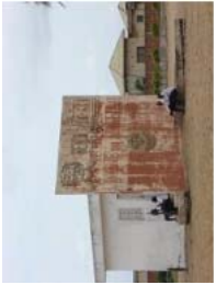
Ouidah May 2010 (30)