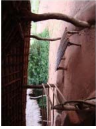
Abomey May 2010 (70)