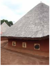
Abomey May 2010 (18)