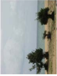
Ouidah May 2010 (56)