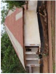
Abomey May 2010 (124)