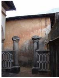
Porto Novo May 2010