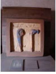
Abomey May 2010 (167)