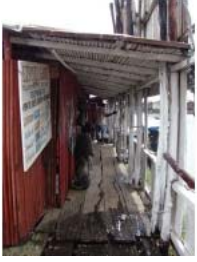
Ganvie May 2010 (27)