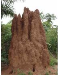
Abomey May 2010