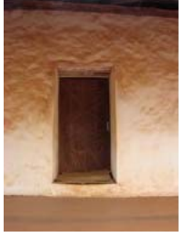
Abomey May 2010 (48)