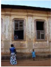
Porto Novo May 2010 (4)