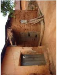
Porto Novo May 2010 (39)