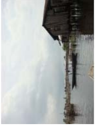
Ganvie May 2010 (28)