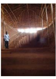
Abomey May 2010 (4)