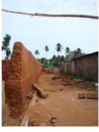
Porto Novo May 2010 (13)