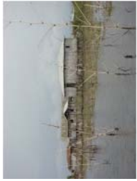
Ganvie May 2010 (40)