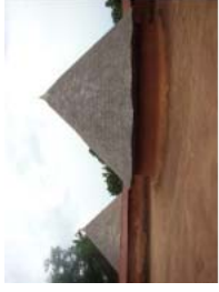
Abomey May 2010 (117)