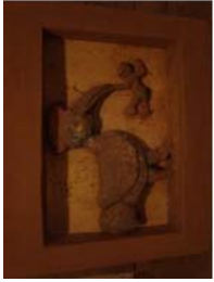
Abomey May 2010 (159)