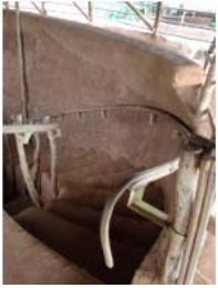
Abomey May 2010 (5)