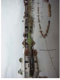
Ganvie May 2010 (22)