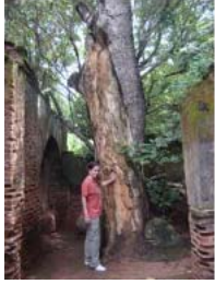
Ouidah May 2010 (12)