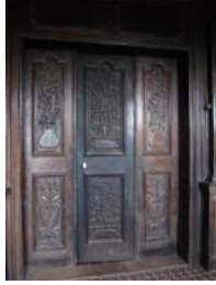
Porto Novo May 2010 (1)