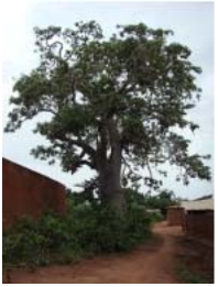
Abomey May 2010 (10)