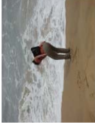
Ouidah May 2010 (39)