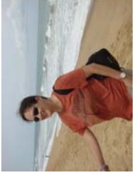
Ouidah May 2010 (49)