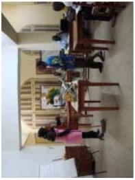
EPA May 2010 (5)