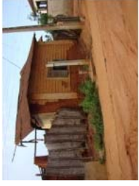
Porto Novo May 2010 (47)