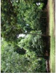
Ouidah May 2010 (7)