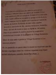
Abomey May 2010 (64)