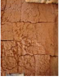
Porto Novo May 2010 (42)