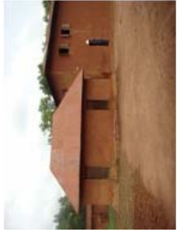
Abomey May 2010 (123)