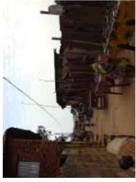
Porto Novo May 2010 (25)