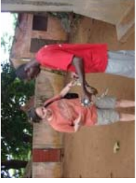
Ouidah May 2010 (62)