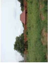
Abomey May 2010 (81)