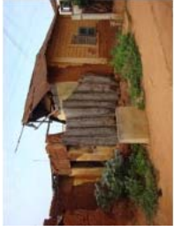
Porto Novo May 2010 (46)