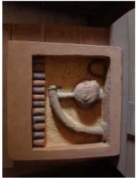
Abomey May 2010 (169)