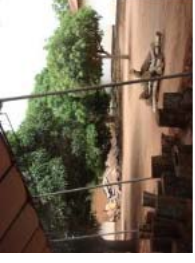
Abomey May 2010 (97)