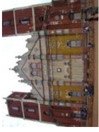
Porto Novo May 2010 (27)