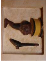
Abomey May 2010 (146)