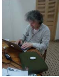
EPA May 2010 (7)