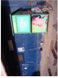
Porto Novo May 2010 (35)