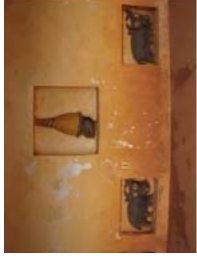
Abomey May 2010 (147)