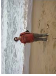
Ouidah May 2010 (36)