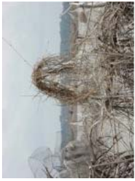
Ganvie May 2010 (46)