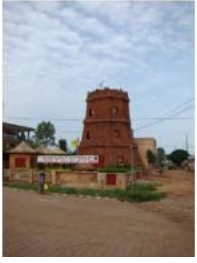
Porto Novo May 2010 (15)