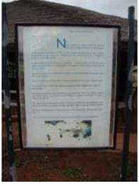
Abomey May 2010 (7)