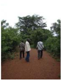
Abomey May 2010 (3)