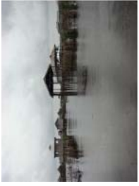
Ganvie May 2010 (19)