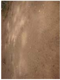
Ouidah May 2010 (11)