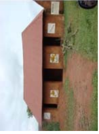
Abomey May 2010 (95)