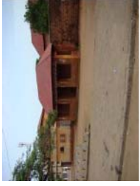
Porto Novo May 2010 (36)