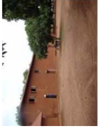
Abomey May 2010 (122)