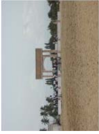
Ouidah May 2010 (41)