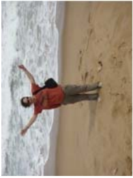
Ouidah May 2010 (50)