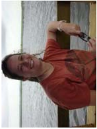
Ganvie May 2010 (10)