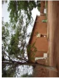
Abomey May 2010 (184)