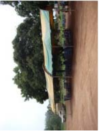
Abomey May 2010 (94)