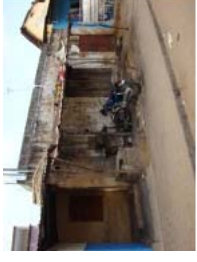
Porto Novo May 2010 (38)