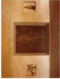
Abomey May 2010 (144)