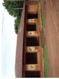
Abomey May 2010 (186)