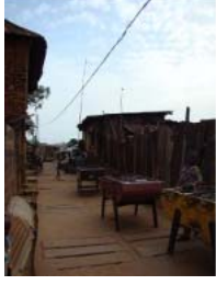
Porto Novo May 2010 (8)