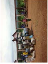
Abomey May 2010 (63)