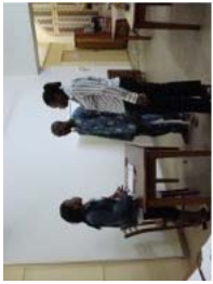
EPA May 2010