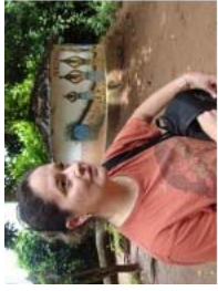
Ouidah May 2010 (19)