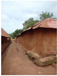
Abomey May 2010 (46)