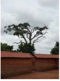
Abomey May 2010 (17)