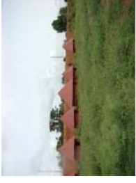
Abomey May 2010 (82)