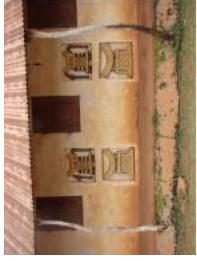
Abomey May 2010 (151)