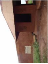
Abomey May 2010 (89)