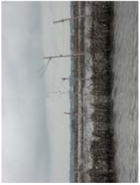
Ganvie May 2010 (15)