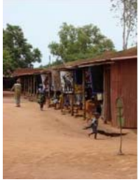
Abomey May 2010 (52)