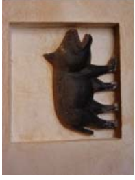
Abomey May 2010 (127)