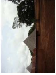
Abomey May 2010 (107)