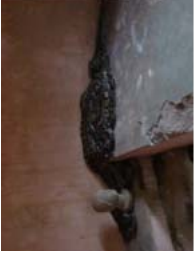
Ouidah May 2010 (64)