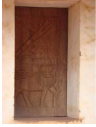
Abomey May 2010 (49)