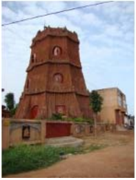
Porto Novo May 2010 (14)