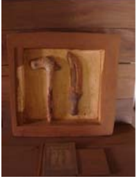
Abomey May 2010 (168)