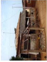
Porto Novo May 2010 (48)