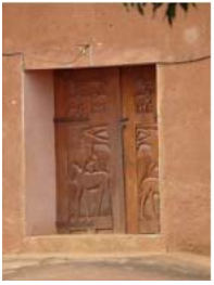
Abomey May 2010 (16)