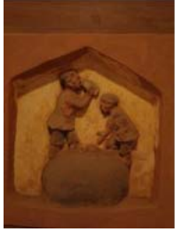
Abomey May 2010 (47)