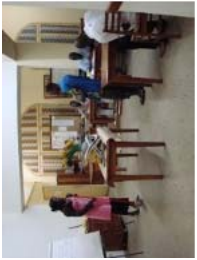
EPA May 2010 (4)