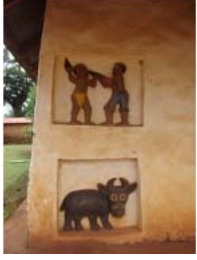
Abomey May 2010 (39)