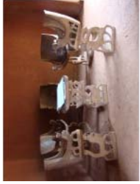
Abomey May 2010 (121)