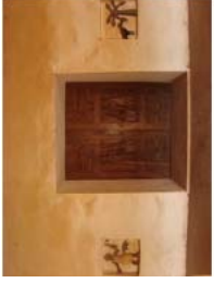
Abomey May 2010 (143)