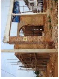
Porto Novo May 2010 (51)