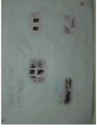
Porto Novo May 2010 (18)