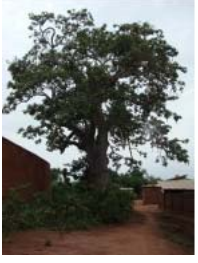
Abomey May 2010 (13)