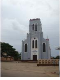
Ouidah May 2010 (74)