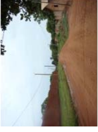
Abomey May 2010 (88)