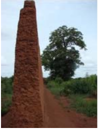
Abomey May 2010 (12)