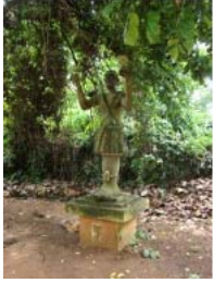
Ouidah May 2010 (27)