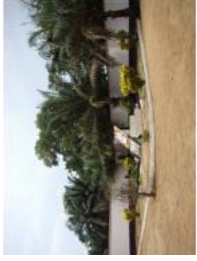
Ouidah May 2010 (3)