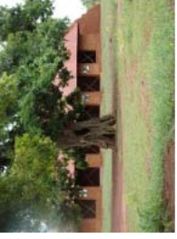
Abomey May 2010 (96)