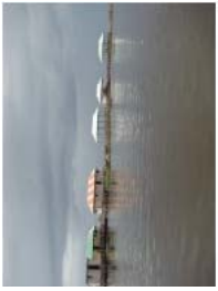
Ganvie May 2010 (26)