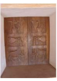
Abomey May 2010 (24)