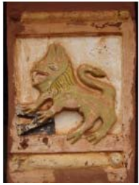
Abomey May 2010 (56)