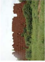
Abomey May 2010 (80)