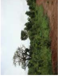
Abomey May 2010 (77)