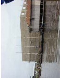
Ganvie May 2010 (37)