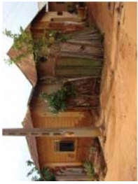
Porto Novo May 2010 (45)