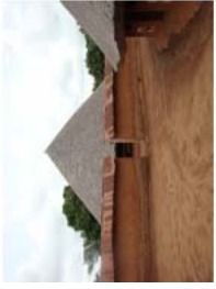
Abomey May 2010 (108)