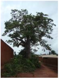
Abomey May 2010 (11)