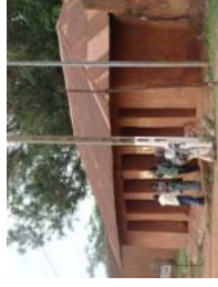
Abomey May 2010 (183)