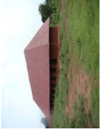
Abomey May 2010 (83)