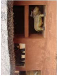
Abomey May 2010 (114)