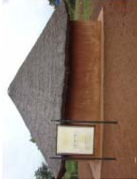
Abomey May 2010 (66)