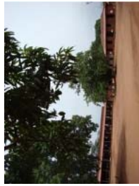
Abomey May 2010 (180)