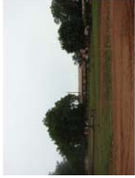
Abomey May 2010 (176)