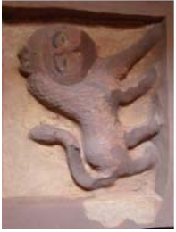
Abomey May 2010 (164)