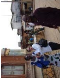
Porto Novo May 2010 (22)