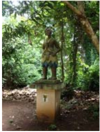
Ouidah May 2010 (15)