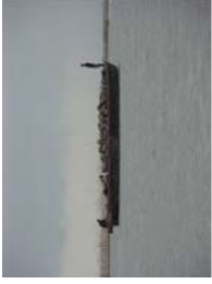
Ouidah May 2010 (82)