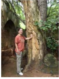
Ouidah May 2010 (14)