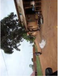
Abomey May 2010 (91)