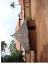
Abomey May 2010 (156)