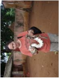
Ouidah May 2010 (70)