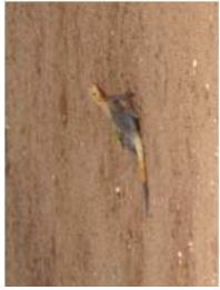
Abomey May 2010 (119)