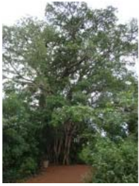
Abomey May 2010 (1)