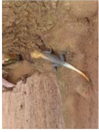
Abomey May 2010 (118)