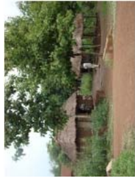
Abomey May 2010 (189)