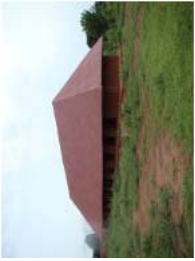
Abomey May 2010 (84)