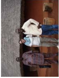
Abomey May 2010 (101)