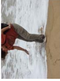
Ouidah May 2010 (37)