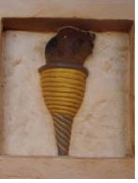
Abomey May 2010 (32)