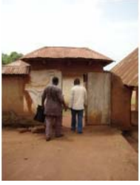
Abomey May 2010 (44)