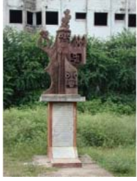
Ouidah May 2010 (23)