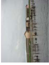
Ganvie May 2010 (34)