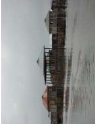
Ganvie May 2010 (18)