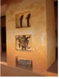
Abomey May 2010 (28)