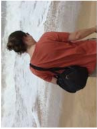
Ouidah May 2010 (40)