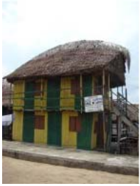
Ganvie May 2010 (45)