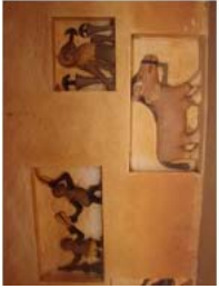
Abomey May 2010 (139)