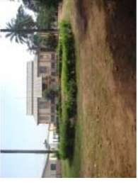
Ouidah May 2010 (79)