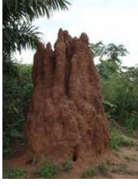
Abomey May 2010 (67)