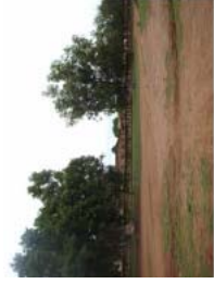
Abomey May 2010 (177)