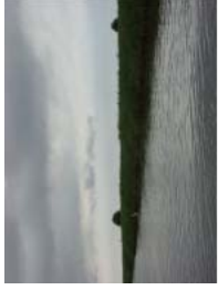
Ganvie May 2010 (2)