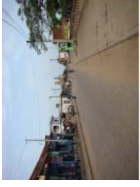
Porto Novo May 2010 (37)