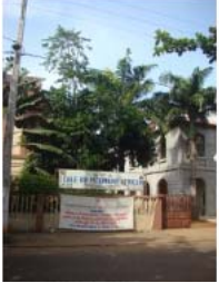
Porto Novo May 2010 (17)