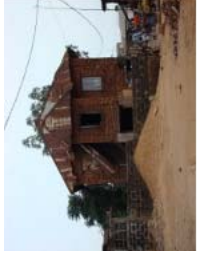
Porto Novo May 2010 (28)