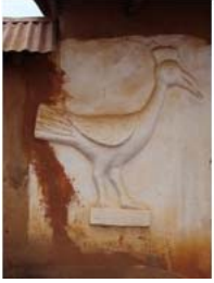
Abomey May 2010 (42)