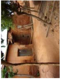
Porto Novo May 2010 (44)