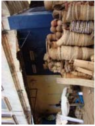
Porto Novo May 2010 (34)