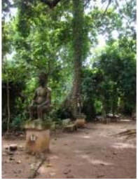
Ouidah May 2010 (8)