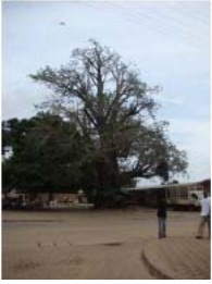
Ouidah May 2010 (71)