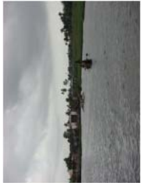
Ganvie May 2010 (5)