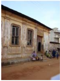
Porto Novo May 2010 (5)