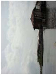
Ganvie May 2010 (36)