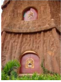
Porto Novo May 2010 (58)