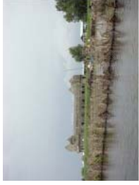
Ganvie May 2010 (32)