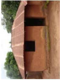
Abomey May 2010 (109)