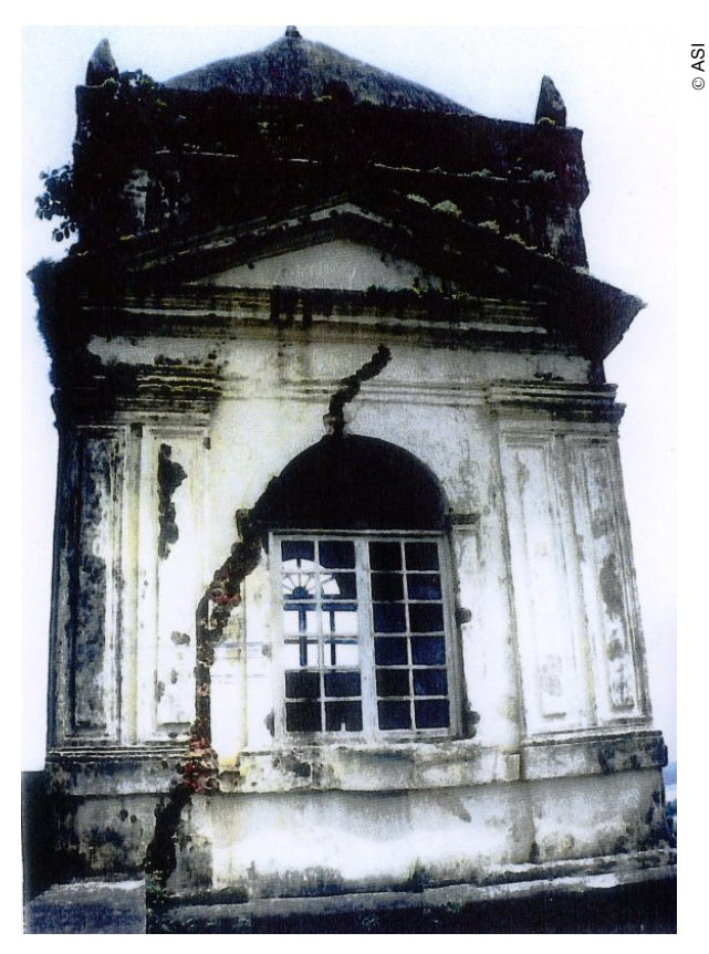
Northern Bell Tower of St. Cajetan before restoration