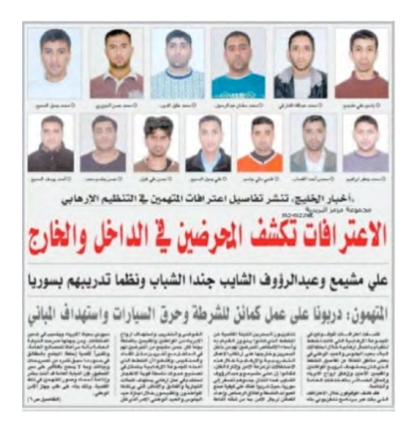
Fig. 1. Akhbar al-Khaleej report showing names and pictures of alleged Shia terrorists

and his colleagues so that the crew could film "a happy doctor walking unscathed through the doors of the ER to freedom."<sup>30</sup> As soon as the crew was finished filming, however, the security forces resumed the abuse.<sup>31</sup>