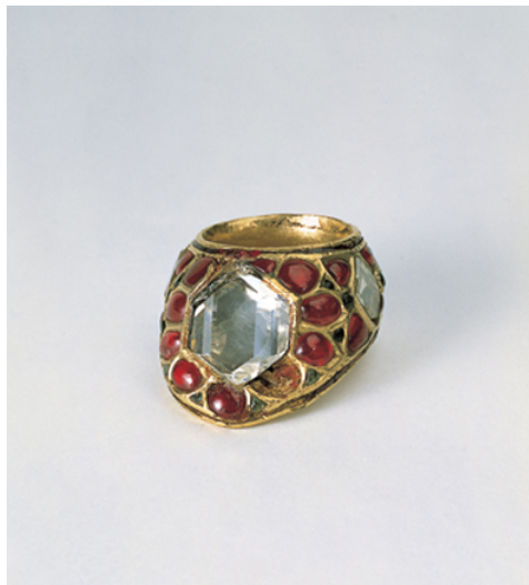
Fig. 11. India. Gold ring ( zehgir ) bearing the name of Shāh Jahān and decorated with diamonds, rubies and emeralds. First half of seventeenth century. Photo: © Terebenin (Hermitage, St. Petersburg.)

has been largely achieved by Zebrowski in his book, 82 which includes objects from the eighteenth and early nineteenth centuries.