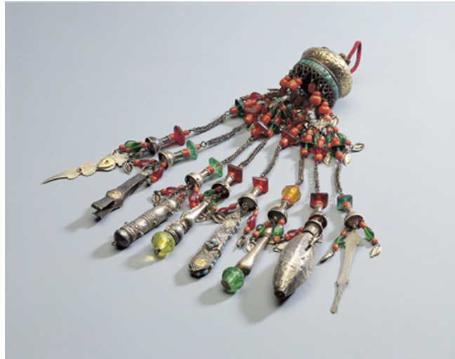
Fig. 8. Bukhara. Silver pendant for make-up. Nineteenth century. (Hermitage, St. Petersburg.)