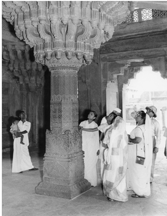
Fig. 15. Fatehpur Sikri. Pillar of the Diwān-i Khās.