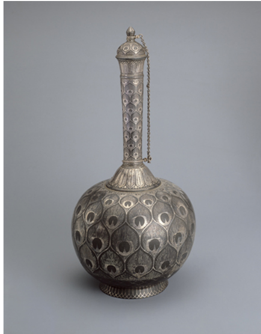
Fig. 4. India. Bidri ewer inlaid with silver. Eighteenth century. Photo: © Terebenin (Hermitage, St. Petersburg.)

No eighteenth-century steel objects 33 have been found so far and the same is true of the nineteenth century; the steel objects we know of are Isfahan ware from the second half of the nineteenth century, 34 but there is nothing from the first half. The role of Khurasan again remains unclear.