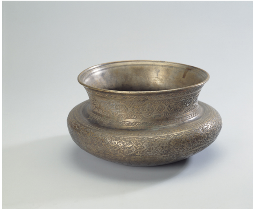
Fig. 1. Mashhad. Copper vessel. First half of the seventeenth century. Photo: © Terebenin (Hermitage, St. Petersburg.)

objects. Inscriptions in Arabic are found rarely, mostly, as mentioned above, on ‘magic cups’.