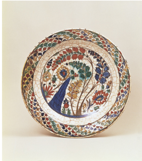
Fig. 12. Iran. Dish, faïence. Seventeenth century. Photo: © Terebenin (Hermitage, St. Petersburg.)

It is believed that Persian pottery entered a period of decline after 1700 because the domestic market was flooded with Chinese and European products. 88 This may well have been the case, but it needs to be proved.