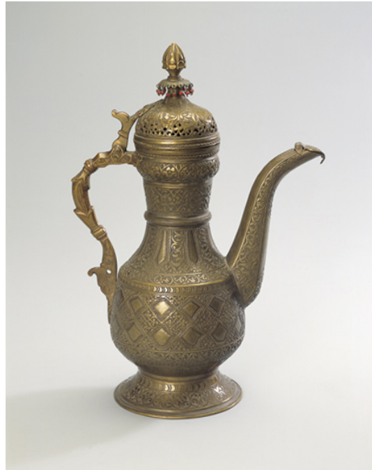
Fig. 3. Transoxania (Khiva?). Bronze or brass ewer. Mid-nineteenth century.

different from Persian objects of the same period. The same can be said of plant ornamentation. Living creatures are rarely depicted in Transoxanian ware of the nineteenth century, while they appear in great numbers on Persian ware. Inscriptions (with the exception of the names of the craft workers) are rarely found on objects from Transoxania, while in Persia they are very often used to decorate metalware.