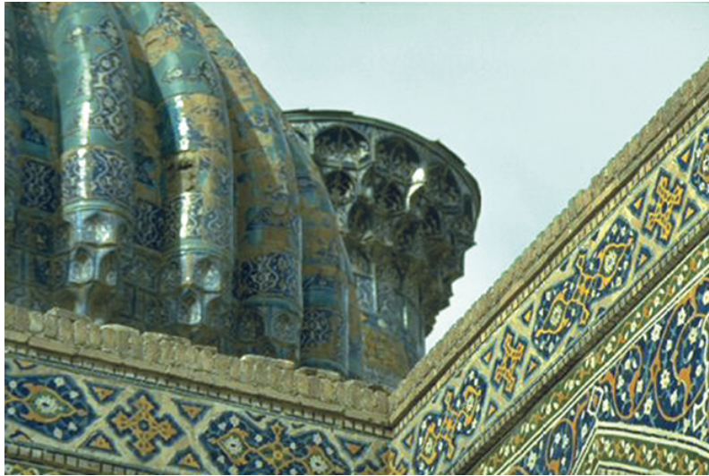
Fig. 13. Samarkand. Detail of tile-work of the Shir-Dor madrasa .