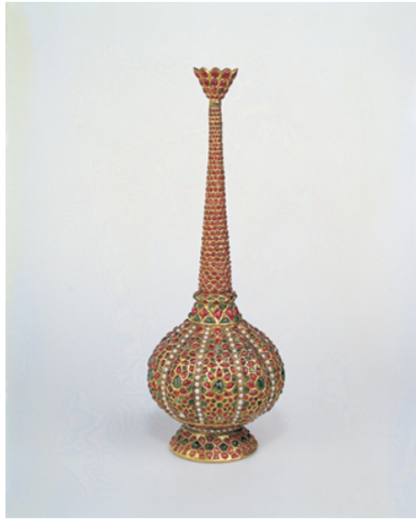
Fig. 10. India. Bottle decorated with gold, silver, rubies, emeralds and pearls. Seventeenth century. Photo: © Terebenin (Hermitage, St. Petersburg.)