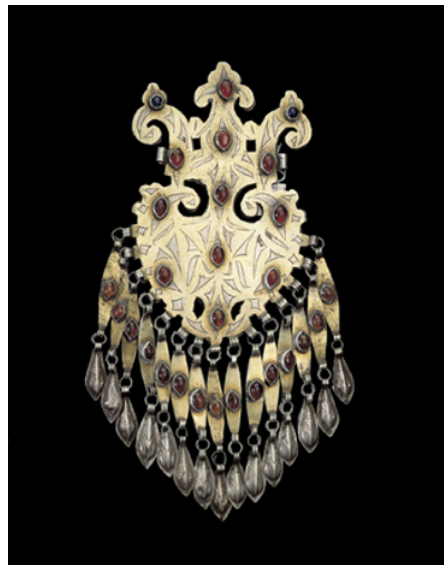
Fig. 9. Turkmenistan. Amulet in silver decorated with glass (Teke Turkmens). Nineteenth century.