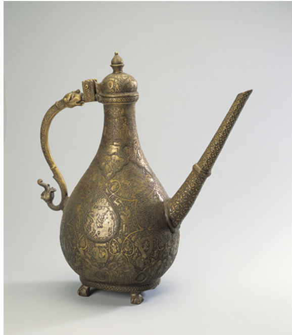
Fig. 2. Iran. Bronze (or brass) ewer signed by Muhammad Hakkāk. Mid-nineteenth century.

Shahrud is referred to with 5 coppersmiths and Herat with 15 workshops. 3 It is thus difficult to determine whether copper and brass (or bronze) objects were produced in Khurasan towns in the first half of the nineteenth century. It would be premature to assume that the nineteenth-century metalware kept in museums in eastern areas of Iran and western Afghanistan was actually made in these regions, as these objects may have been brought from elsewhere. 4