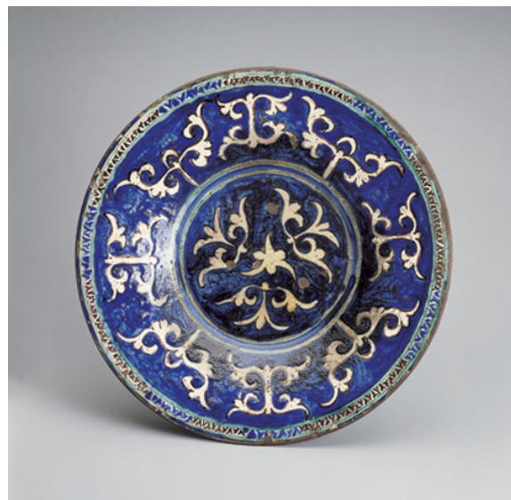
Fig. 14. Transoxania. Dish, faience. Late nineteenth century. Photo: © Terebenin (Hermitage, St. Petersburg.)