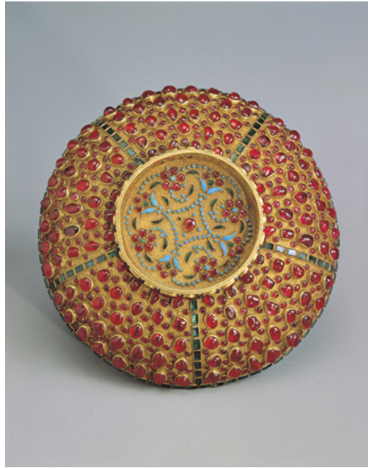
Fig. 7. Iran and India. Gold cup decorated with rubies, emeralds, pearls and turquoises. Seventeenth century. Photo: © Terebenin (Hermitage, St. Petersburg.)

is not known. As mentioned above, there were 30 goldsmiths' shops in Herat in the late nineteenth century, but the precise nature of their work remains unclear. 62