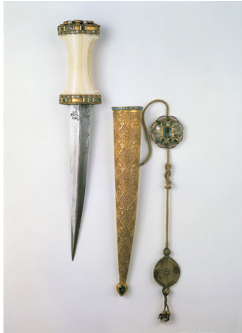
Fig. 5. Iran and India. Dagger with sheath (steel, gold, emeralds, rubies, pearls). The blade bears the signature of Muhammad Lārī dated 1031/1621–2. Lārī, a Persian artist, may have been active in India where the handle and the sheath of this dagger were added later at the end of the seventeenth century. Photo: © Terebenin (Hermitage, St. Petersburg.)