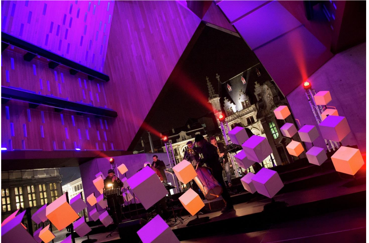
EUROCITIES Concert – City Pavilion

The main cultural theme in Ghent in 2014 was '50 years of migration' , the celebration of the protocols between Belgium, Turkey and Morocco on the migration of citizens. Under the title 'Dear co-patriots' 16 concerts, 15 expositions, 8 festivals, 20 debates, 4 theatre plays, 3 book presentations and 2 film screenings were organised. In a special edition of the annual festival 'Istanbul Express', the Ghent Intercultural Centre De Centrale and the Ghent concert hall HA presented the creation of 'YOLDA', a project that musically links Ghent with the Mediterranean cities of origin of migration. 'Gent UNESCO Muziekstad' joined the ngo that was founded to coordinate the initiatives re this year.