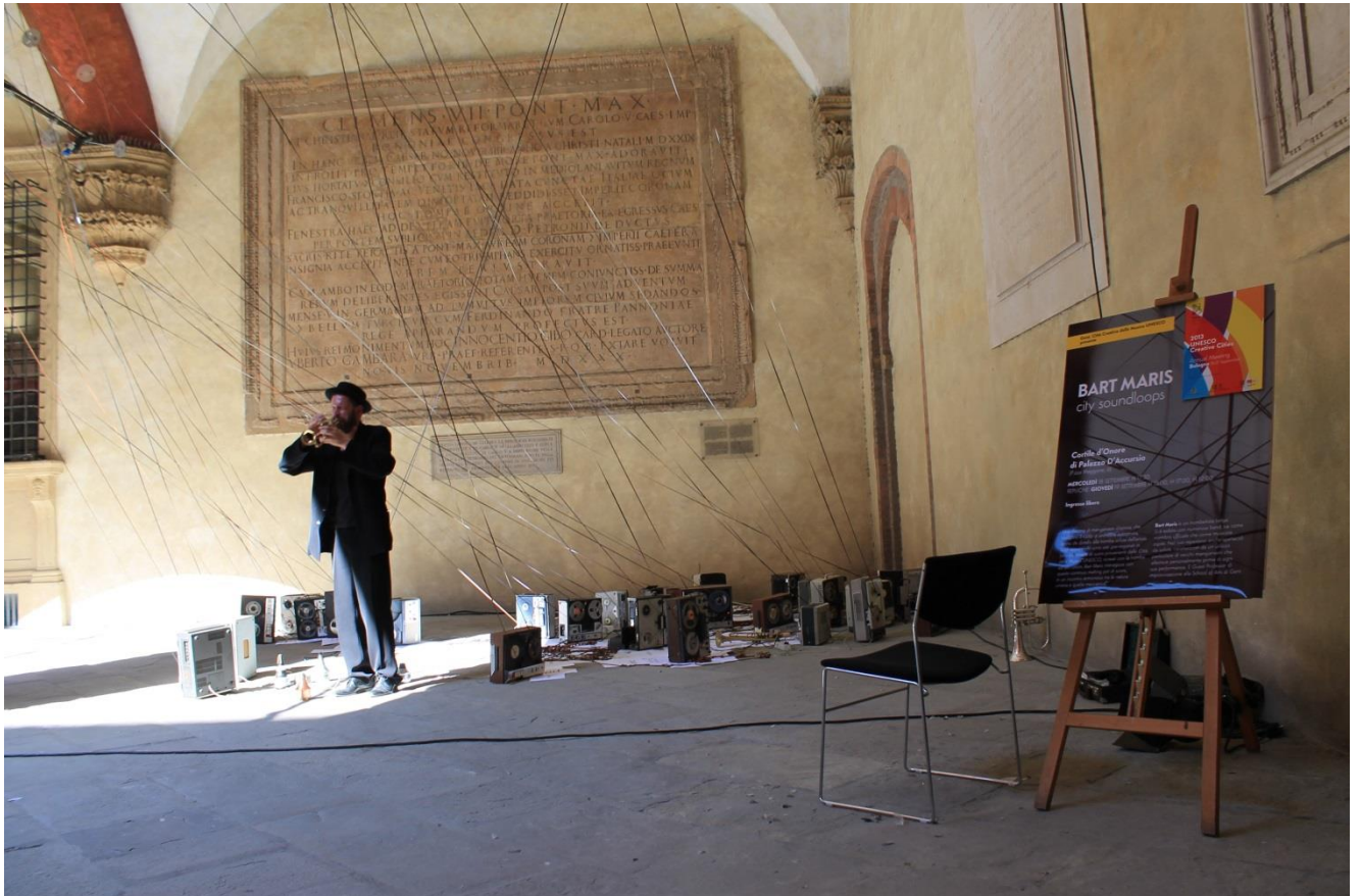
BOLOGNA 2013 - Bart Maris performing

Furthermore when it comes to UNESCO Music Cities there were exchanges between Ghent and Bologna (artists), and Ghent and Hannover (artists and managers), in the context of festivals such as GLIMPS, Reeperbahn and Fête de la Musique.