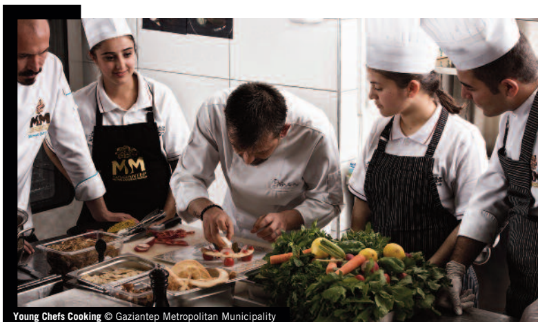
Young Chefs Cooking

chain process from food production to cooking. School educators and many local businesses contribute best practices and hands-on experience to support the project. The blending of in-house teaching and business coaching helps align learning with the jobs of tomorrow and prepares students to work in the industry. By encouraging more students to move into the field of gastronomy through inspiring and practical courses, the partnering cities aim to preserve their own food culture, as well as being able to create a budding generation of food entrepreneurs. This project has been promoted at the 2018 Sustainable Gastronomy Day.