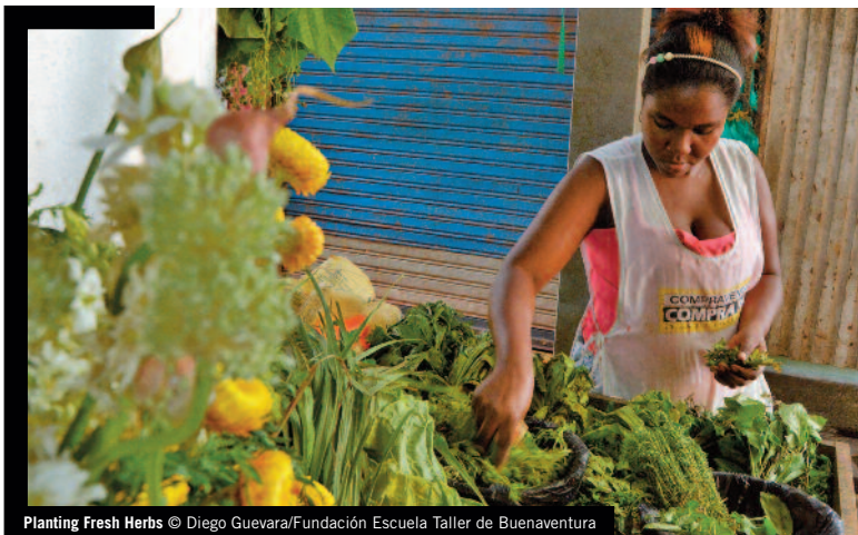
Planting Fresh Herbs