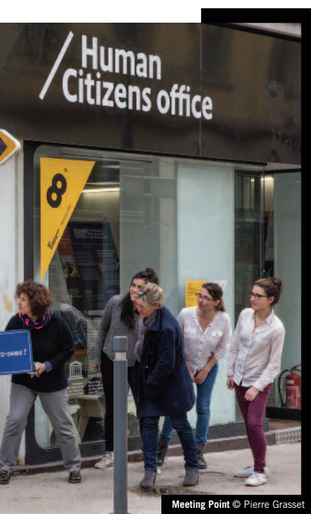
Meeting Point © Pierre Grasset