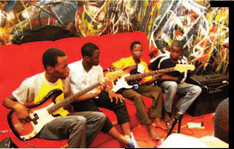
Reemdoogo