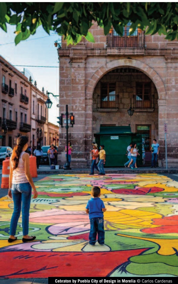
Cebraton by Puebla City of Design in Morelia