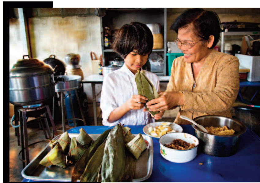
Cooking Together

André Kimbuta Governor of the City of Kinshasa (Democratic Republic of the Congo)