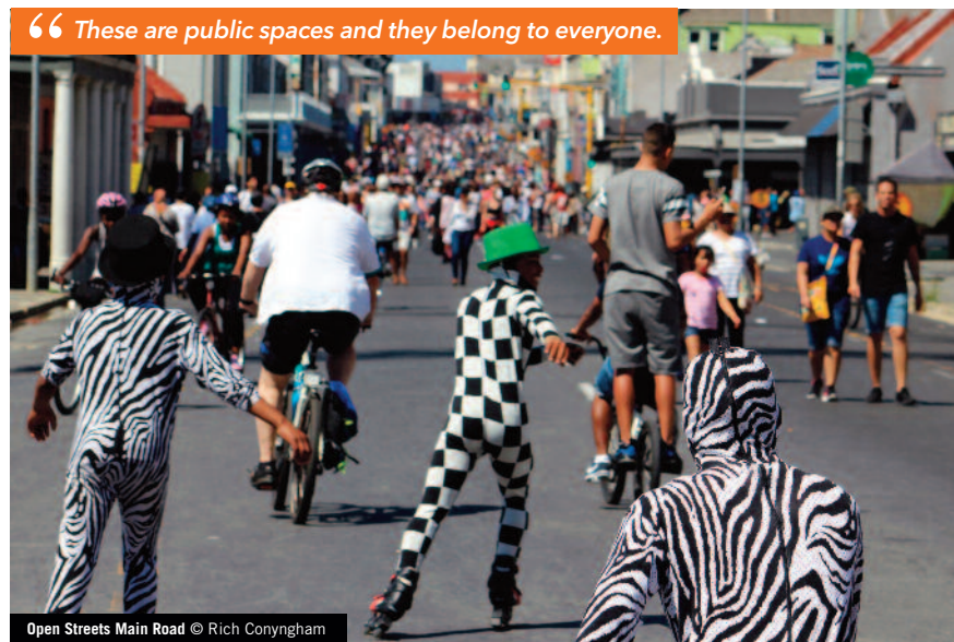
Open Streets Main Road

“ These are public spaces and they belong to everyone. ”