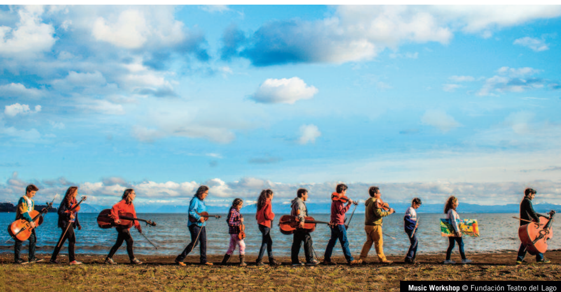
Music Workshop

Chair of Bandung Creative Economy Committee and Chairman of BCCF (Indonesia)