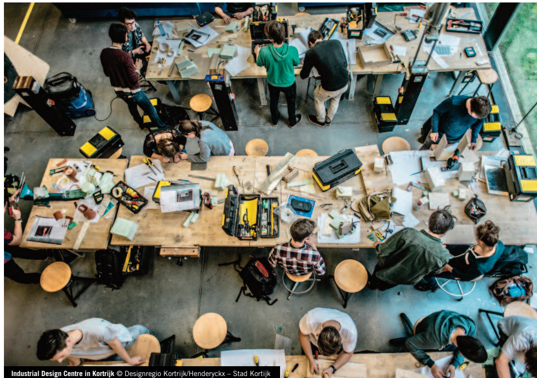
Industrial Design Centre in Kortrijk

The Tapiskwan initiative was launched in 2013 by the Atikamekw Nation Council, in collaboration with the University of Montréal. Supporting creative, social and economic development within the villages of Manawan and Wemotaci in the province of Quebec, every year a workshop is held to promote knowledge and skills of the Atikamekw indigenous community through design and crafts. The traditional creative styles and know-how are subtly combined with contemporary techniques. This immersive project enables knowledge transfer and the safeguarding of the Atikamekw ancestral heritage . By providing a space to sell their products, the initiative also supports economic and social development within the community .