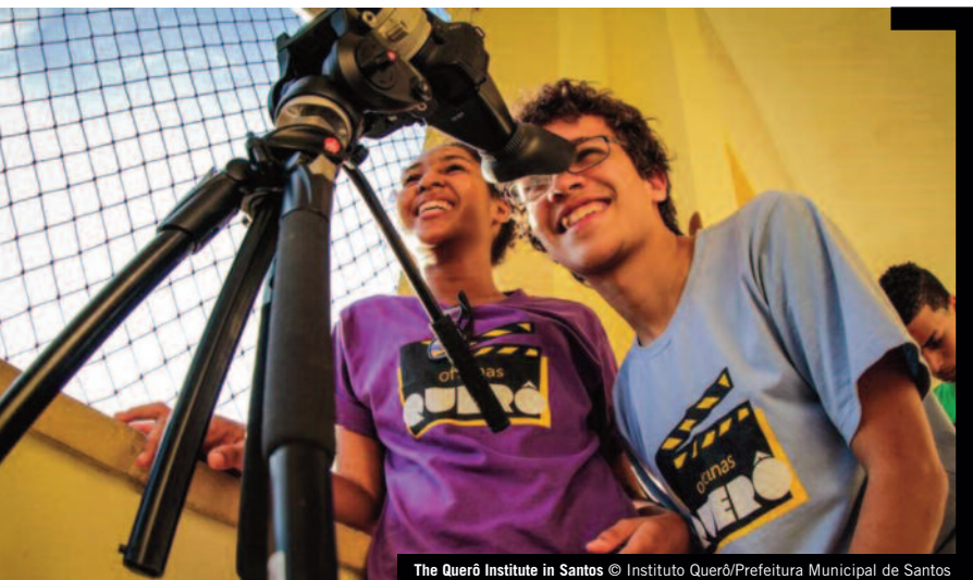
The Querô Institute in Santos

Donald Harwin Minister for the Arts New South Wales (Australia)