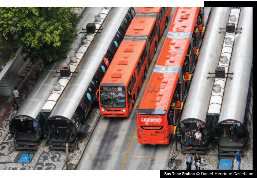
Bus Tube Station

The Amarante Urban Revitalization initiative (RUA) aims to foster a people-led regeneration of the urban fabric . The project is about creating more than just new and improved public areas, but crafting a positive response with and for the residents and visitors of Amarante. The initiative intends to repurpose and revitalize a number of areas and historic buildings within the city centre by relying on the creativity of local inhabitants, as the main actors of urban life, when designing the city's new uses . Based on the placemaking approach, the municipality actively engages with citizens to help capture the city's current realities , and assess challenges and opportunities. The initiative promotes the use of new developments for outdoor activities and social gatherings between residents. Encouraging local trade and stimulating the economic vitality within the area is also an important aspect of the project.