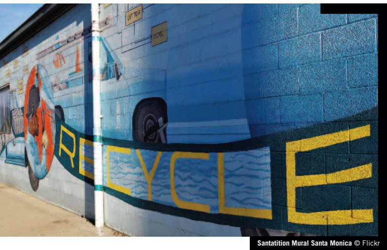
Santation Mural Santa Monica

Josco Products, waste material supplier to [Re]Verse Pitch