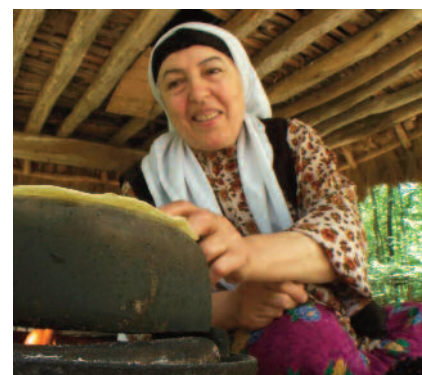
Gil Banoo

Initiated in 2018 by the Urban Development Group of the Municipality of Rasht, Gil Banoo is a crafts centre established to support job and enterprise creation with and for women . Located in the heart of a city garden, the centre provides a wide range of locally produced and hand-made items, using essentially local resources. Weaving methods and gastronomic recipes are thus shared and renewed. More than a cultural centre, Gil Banoo is a space of conviviality and exchange that empowers women and supports them in launching their own business and, more broadly, contributes to their participation in the social and economic life of their community.