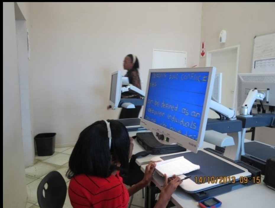
Partial Visual Impaired Student using closed circuit TV