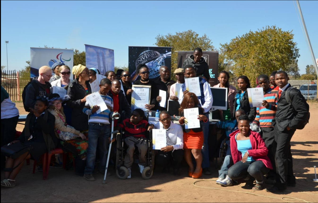
LUCT Students with disabilities receiving awards for participating in the Youth with Disability Pitso Training