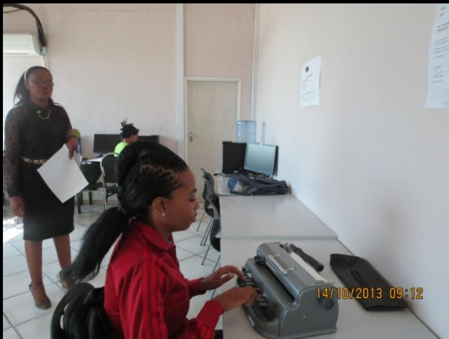
Visually Impaired Student using perkins Brailer