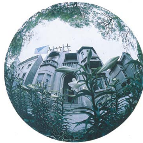
The 1970s: decentralization and consolidation of major programmes