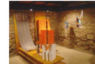
The start of a new century: the Culture Programme joins the Bureau

After 70 years working in the region, today we support: