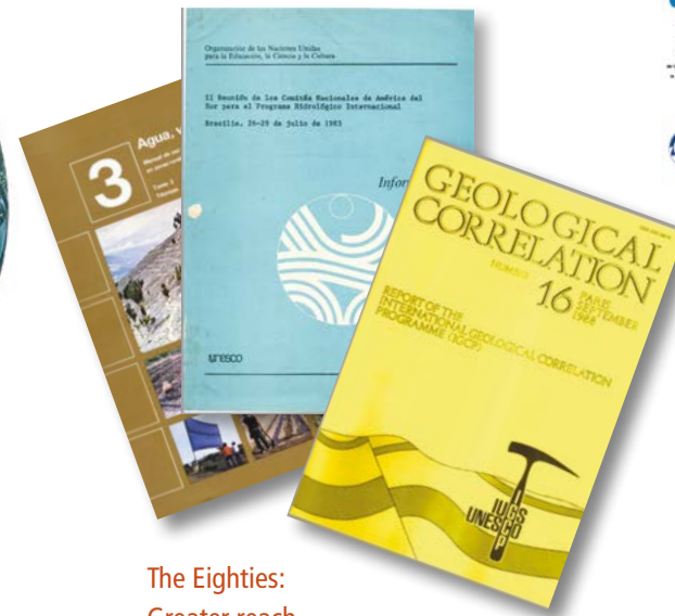
The Eighties: Greater reach in the region