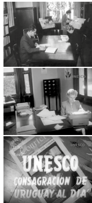
The 1950s: First actions in the region

Seventy years ago, shortly after the creation of UNESCO and through the impetus of a group of distinguished regional scientists, the Latin American Science Cooperation Office (LASCO) was established, with the aim of promoting and consolidating science in the region