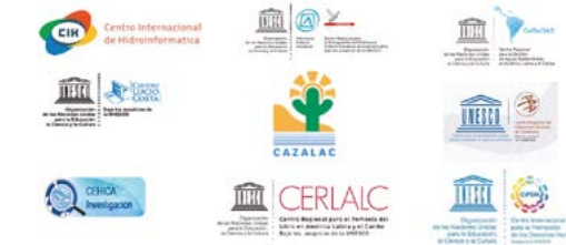
Promotion of regional networks in Science and Technology (RedCiencia; RedFAC; RedPOP; RELAA; RELAB; RELACQ; RELACT, RedPOST)