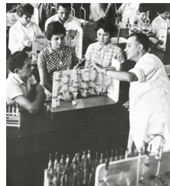
The Sixties: UNESCO promotes science policy in Latin America