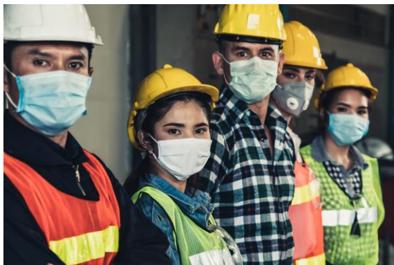
Health and Equity