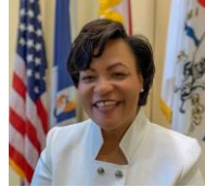
Mayor Quintero Calle Medellín