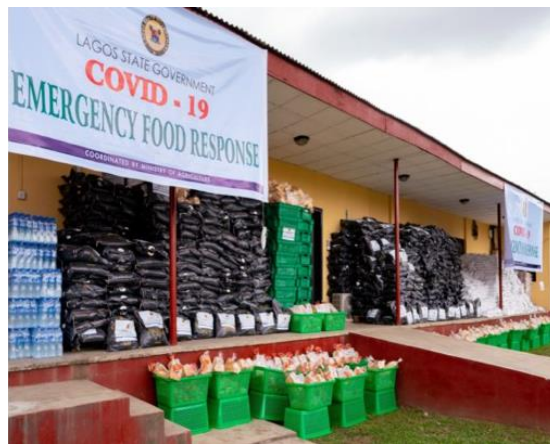
Food and waste