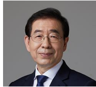
Mayor Cantrell New Orleans