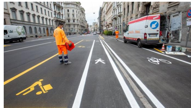
Public space and mobility