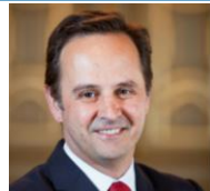
Mayor Durkan Seattle