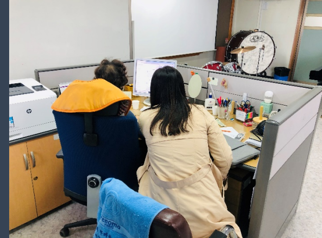
Expert TA helps a teacher build up the competency for online teaching, to get prepared for online school