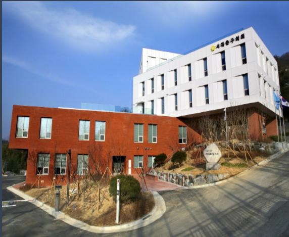
CONVERGENCE TALENT EDUCATION CENTER