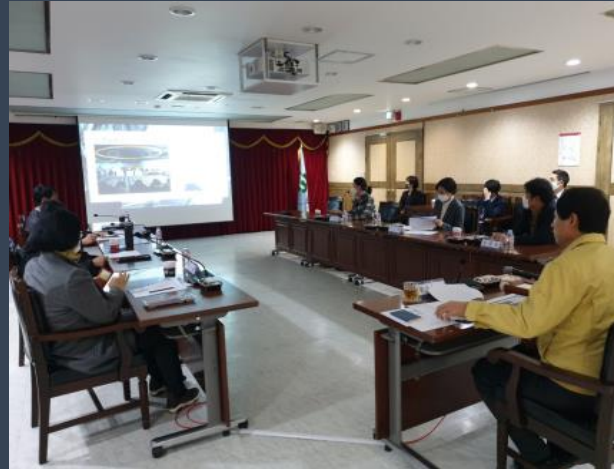
Committee Meeting of CONVERGENCE TALENT EDUCATION CENTER